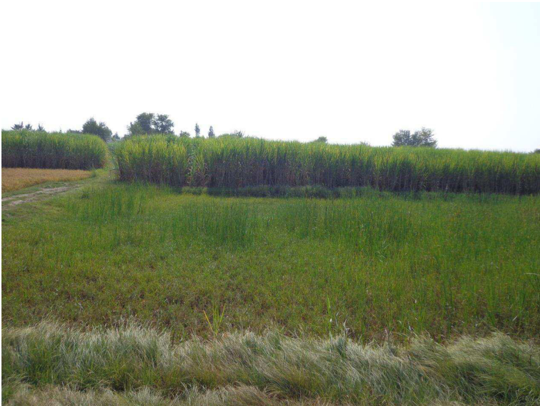
Figure-4: Sugarcane Fields – major Crop of the Project Area