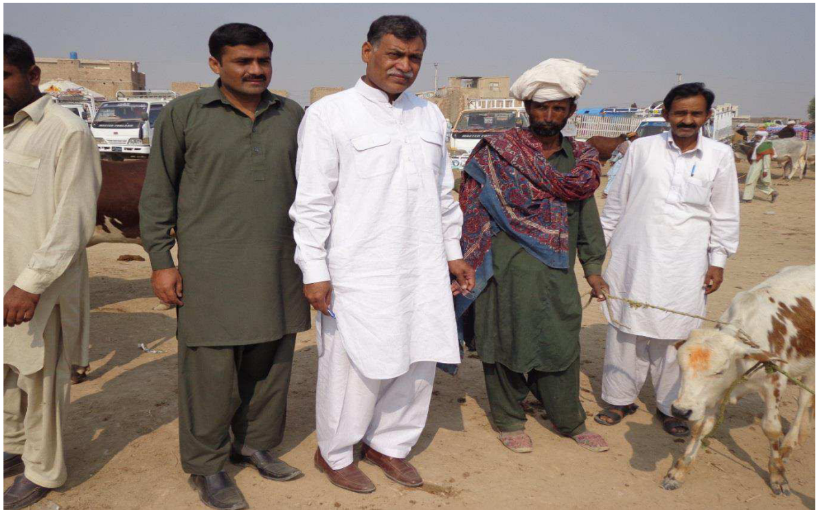
Figure-5: A way side Consultation at Jampur