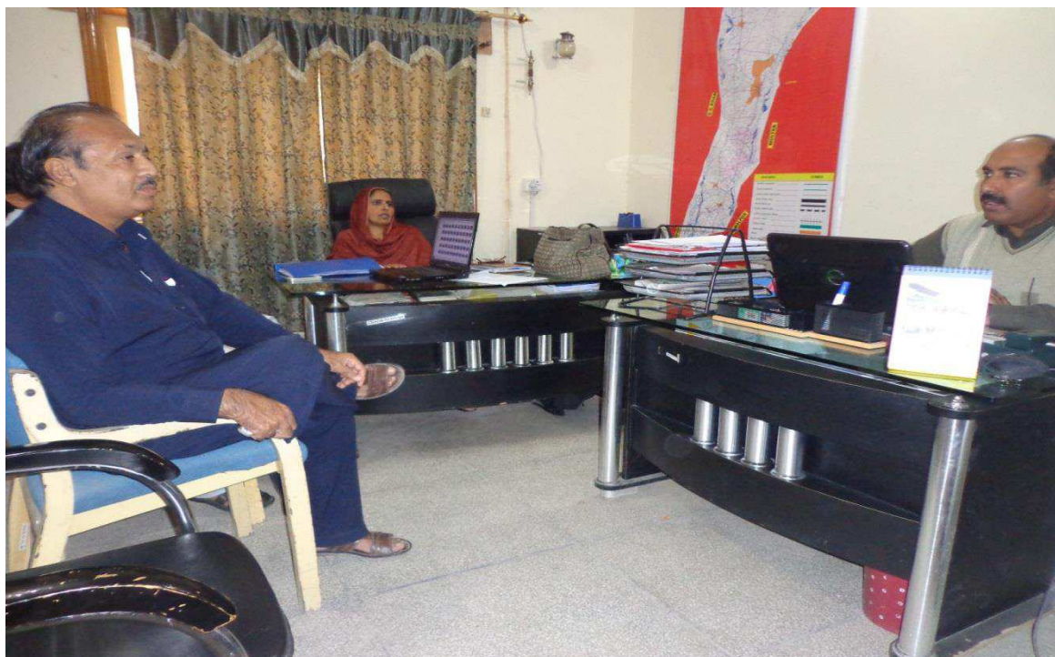
Figure-2: Meeting in the Office of SYCOPE NGO Muzaffargarh