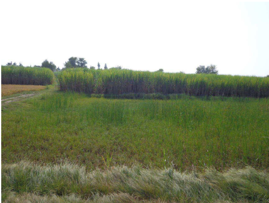
Figure-4: Sugarcane Fields – major Crop of the Project Area