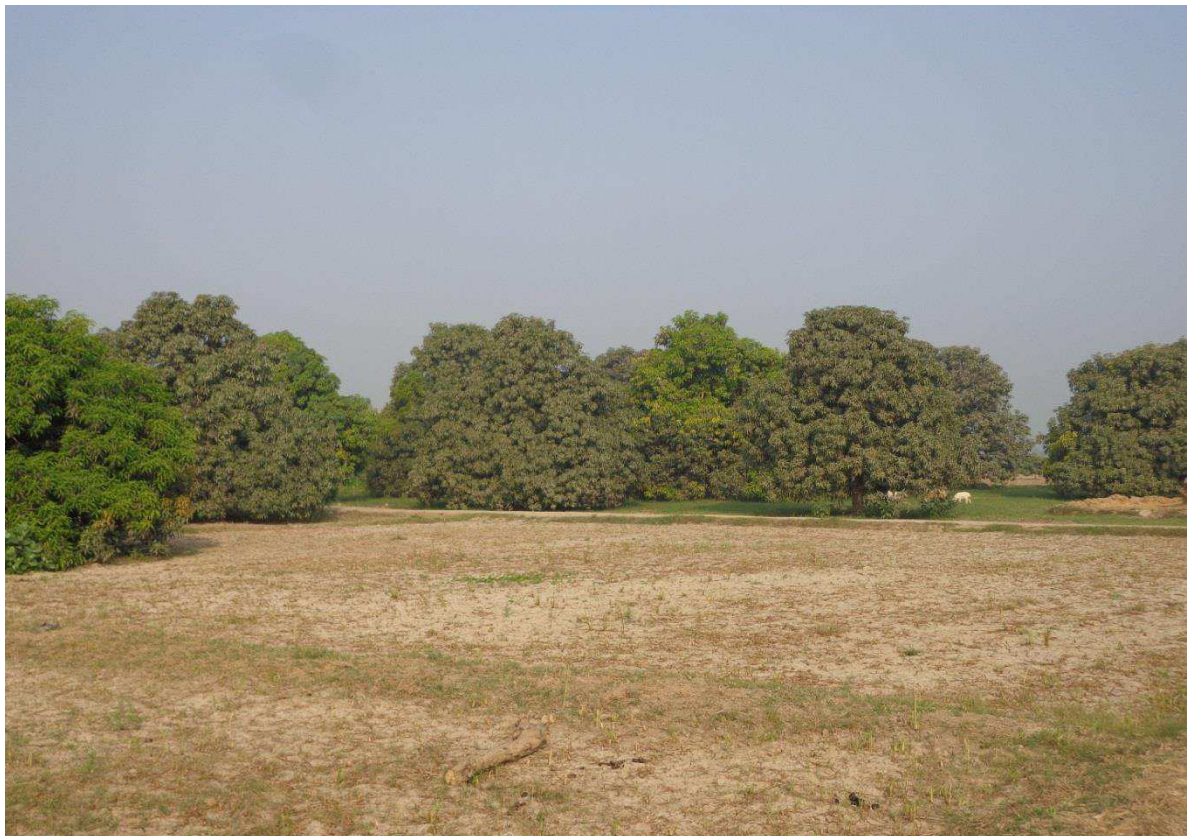
Figure-6: A Mango Orchard in the Project Area