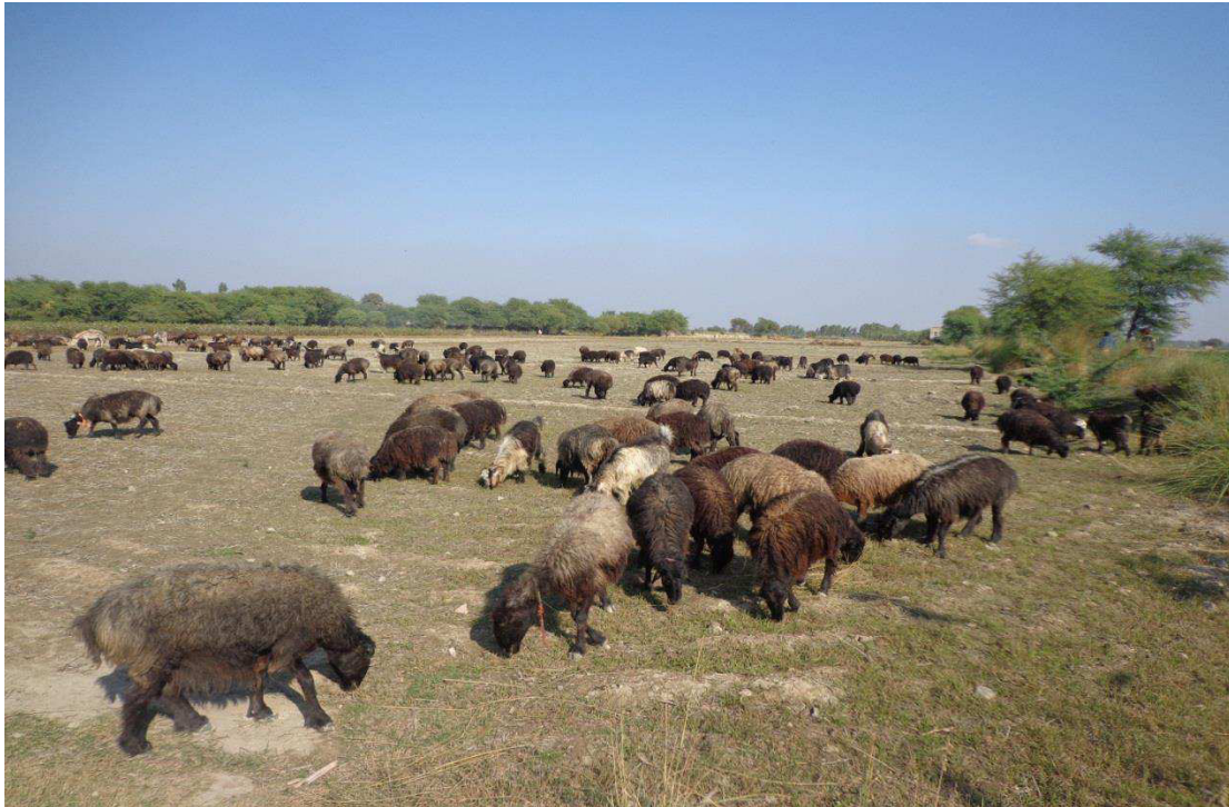
Figure-3: Livestock Raring along the Project Corridor – a Significant Livelihood Source of the Area