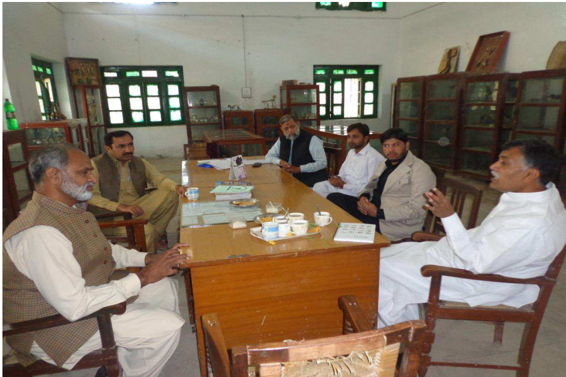
Figure-1: A Consultative Session with the Professors of Govt. Post Graduate College Muzaffargarh regarding Flora and Fauna of TL Route