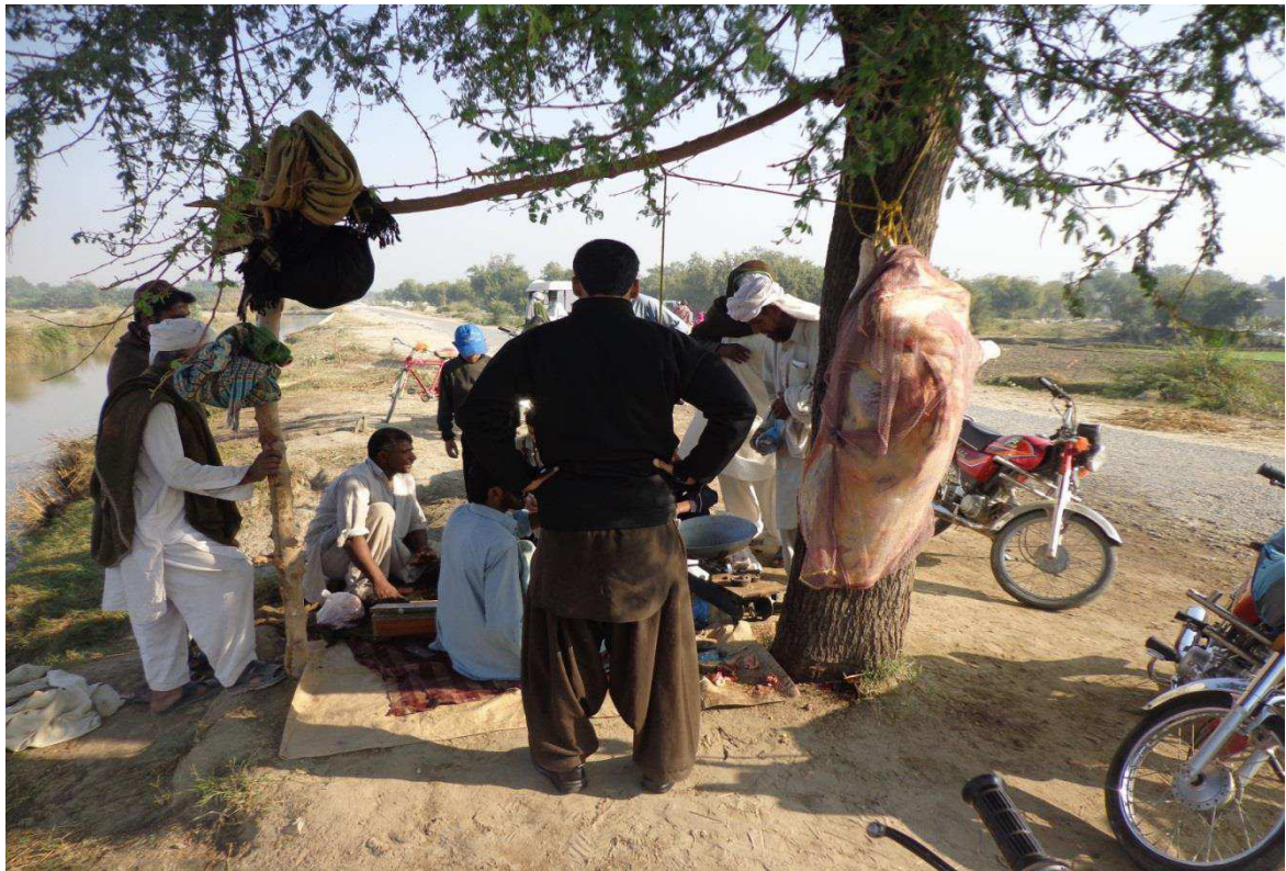
Figure-1: Consultation near Chak 1/M-L along the Transmission Line Route