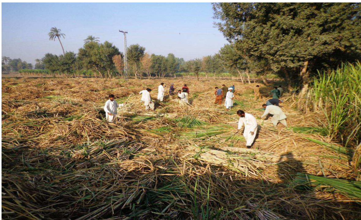
Figure-2: Sugarcane Harvesting in Project Area – An Important Crop of the Tract