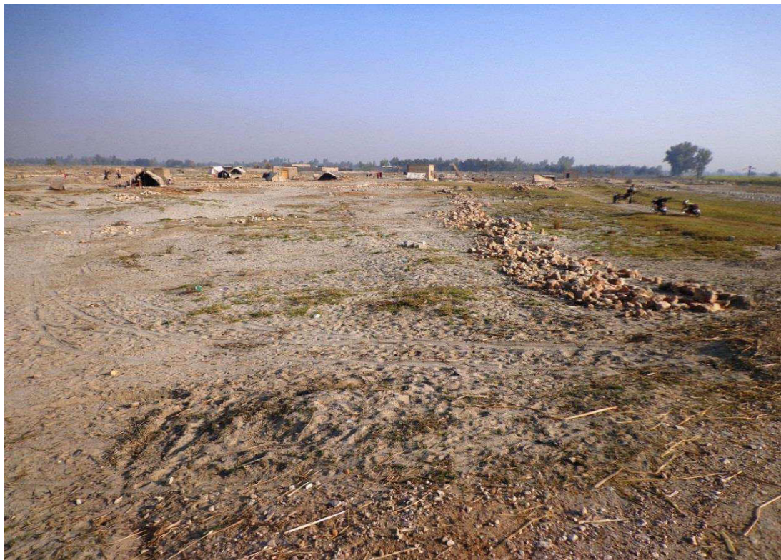
Figure-6: Barren Part of Transmission Line Route near Grid Station Site