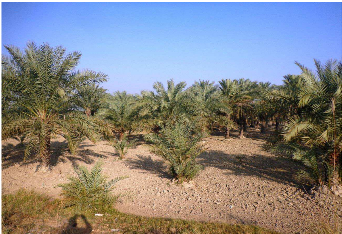
Figure-4: Date Palm Orchard in Project Area