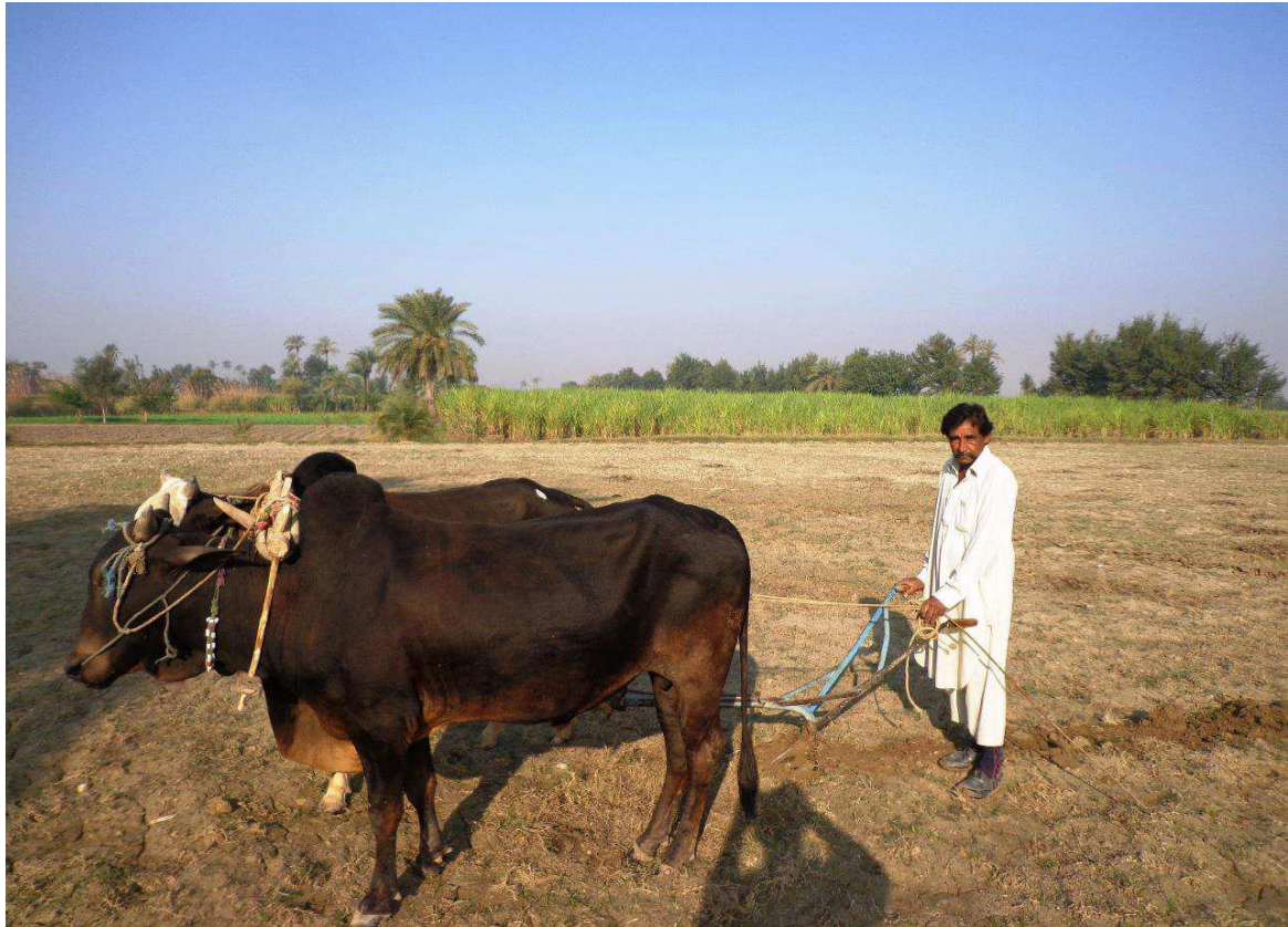
Figure-3: A Farmer using Typical Method of Crop Cultivation in the Project Area near Piplan Tehsil