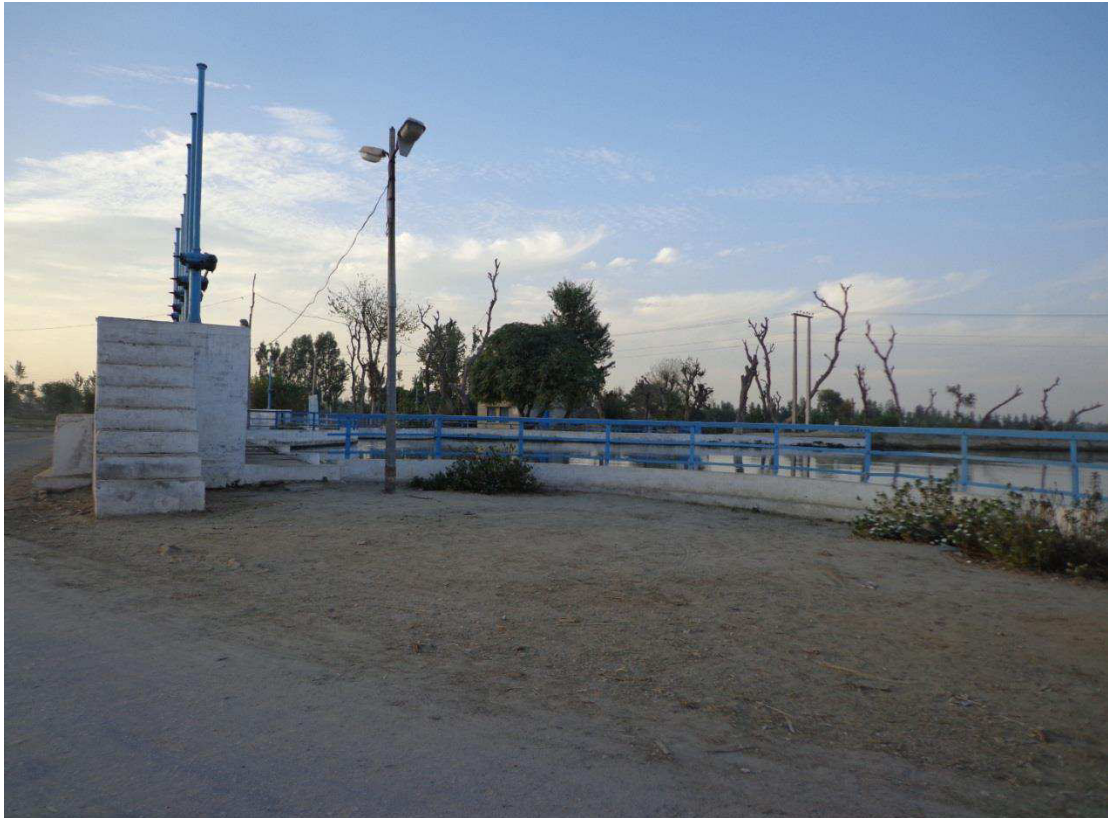
Figure-5: A Glimpse of CRBC Canal to be crossed by Transmission Line