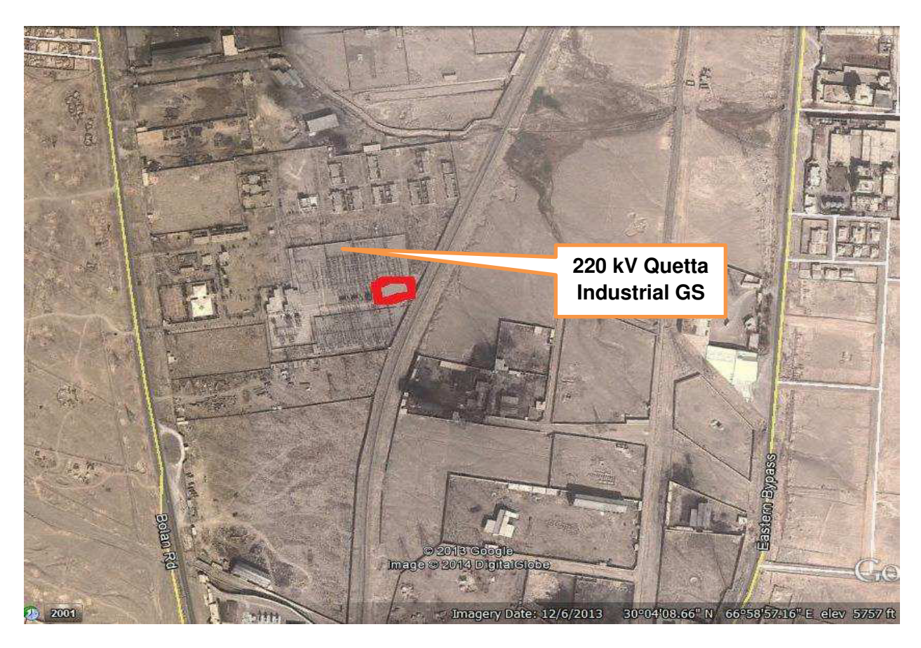
Fig.3.4: Location of proposed SVC (Red Block) at Existing 220 kV Quetta Industrial Grid Station

51. The environmental impacts are likely to be minor and localized near the foundation construction sites and are reviewed in the environmental impact section of the report. The impacts will need to be reviewed and amended if necessary if the locations change, scope of work change and when the detailed designs are available.