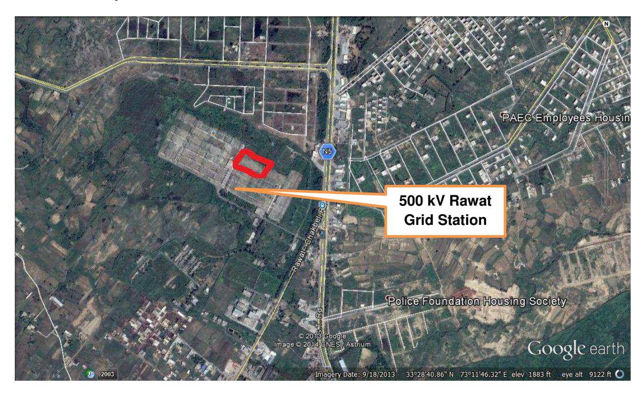
Fig.3.2: Location of proposed Extension Works (Red Block) at Existing 500 kV Rawat Grid Station