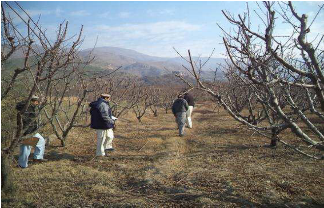
Figure-1: A view of affected Peach Orchard by 220 kV Transmission Line at Nalo Kalay, Tehsil Thana, District Mardan,