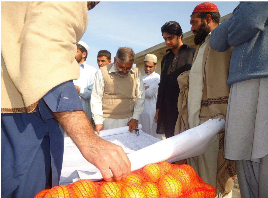
Figure-4: Identification of Transmission Line Route by Survey Team