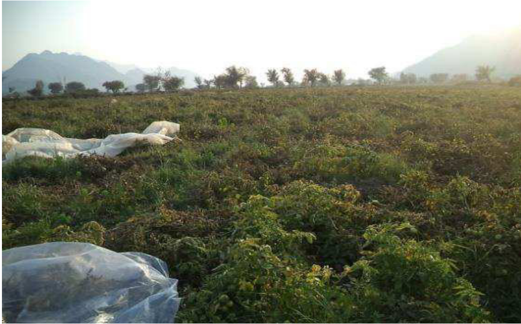
Figure-3: A view of the affected Tomato crops, at Mora Banda, Malakand Agency