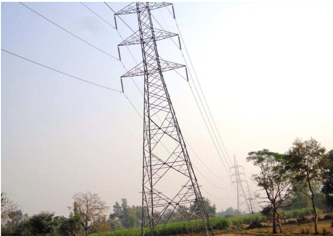
Figure-4: Existing Ghatti-Ludewala TL to be connected by 200 kV Grid Station of Tranche-IV.