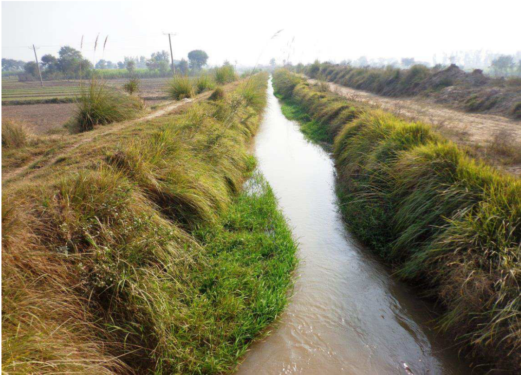
Figure-3: A Small Water Channel near Chak Saggawala (Tehsil Lalian District Chiniot) need to be crossed by 220 kV Transmission Lines