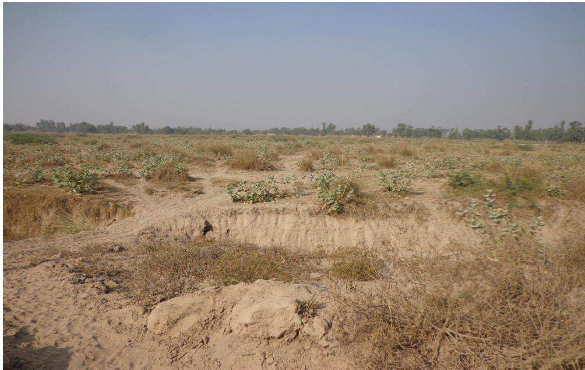
Figure-1: A view of 220 kV Lalian Grid Station Site along the Faisalabad – Sargodha Road