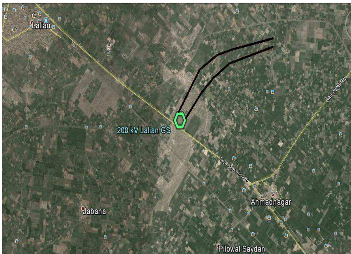
Fig 3.1: Google Image of 220 kV Lalian Grid Station along the Faisalabad-Sargodha Road, 5 km East to Lalian City

46. As evident from Fig.3.1 and 3.2 , the 220 kV Lalian grid station is located on semi barren land along the Faisalabad-Sargodha Road, while the transmission lines route passes from some forest land of Kot Ismail and cultivated land of village Bahadur and village Saggawala, Tehsil Lalian and District Chiniot. The coordinates of Grid Station site are 31°48'10.98" N, 72°51'24.01" E and 596 feet elevation are sea level. The whole project tract is flat and no considerable elevation difference exists.