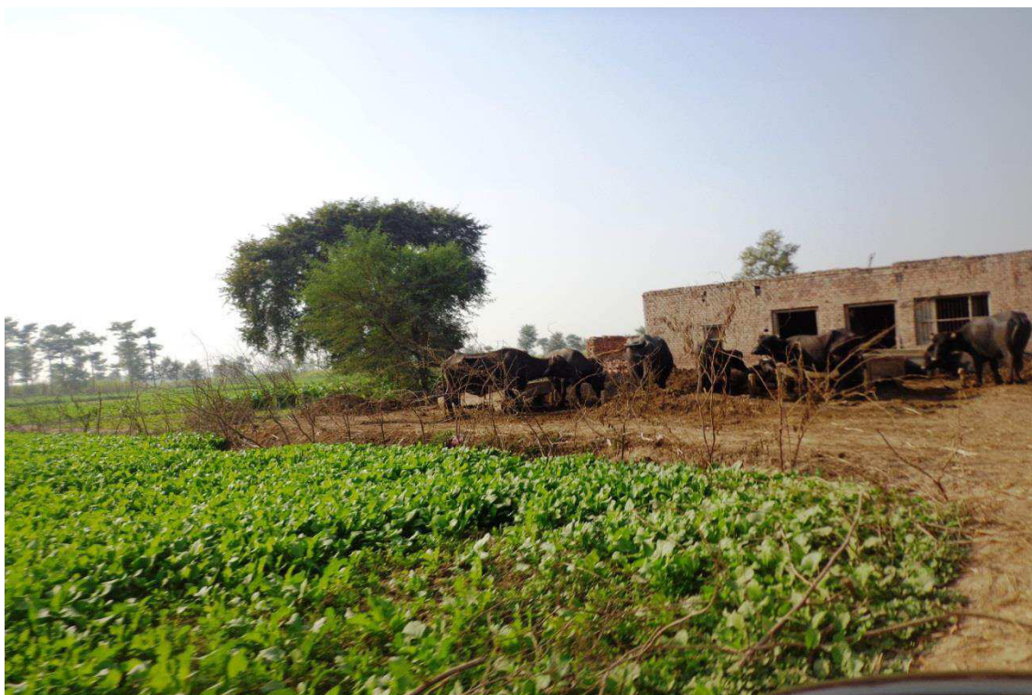
Figure-2: Agriculture and Livestock Activities along the 220 kV Transmission Lines Route