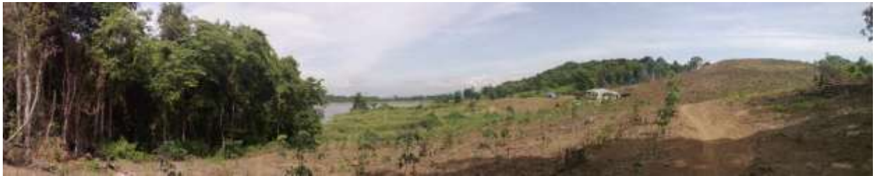
Rubber plantation of Son Trang Company