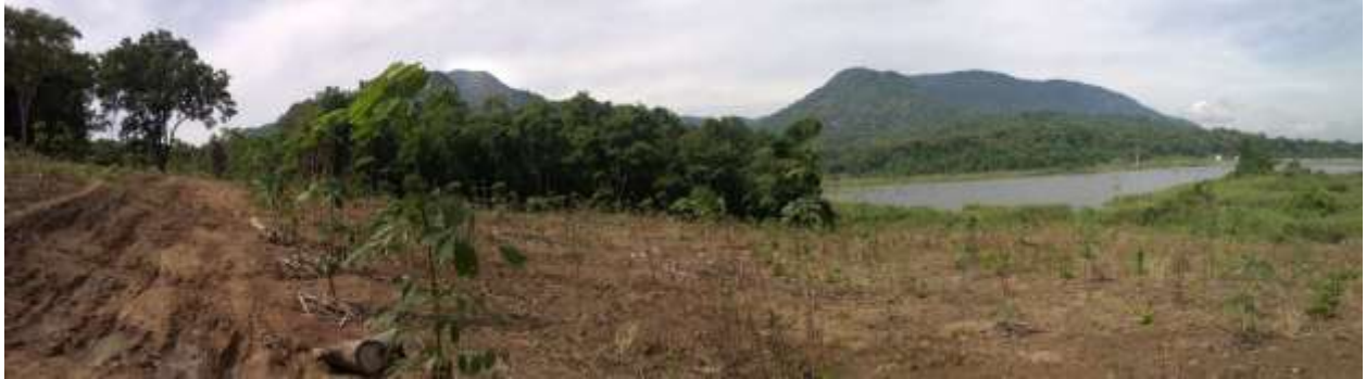
View of Saloun reservoir from rubber plantation