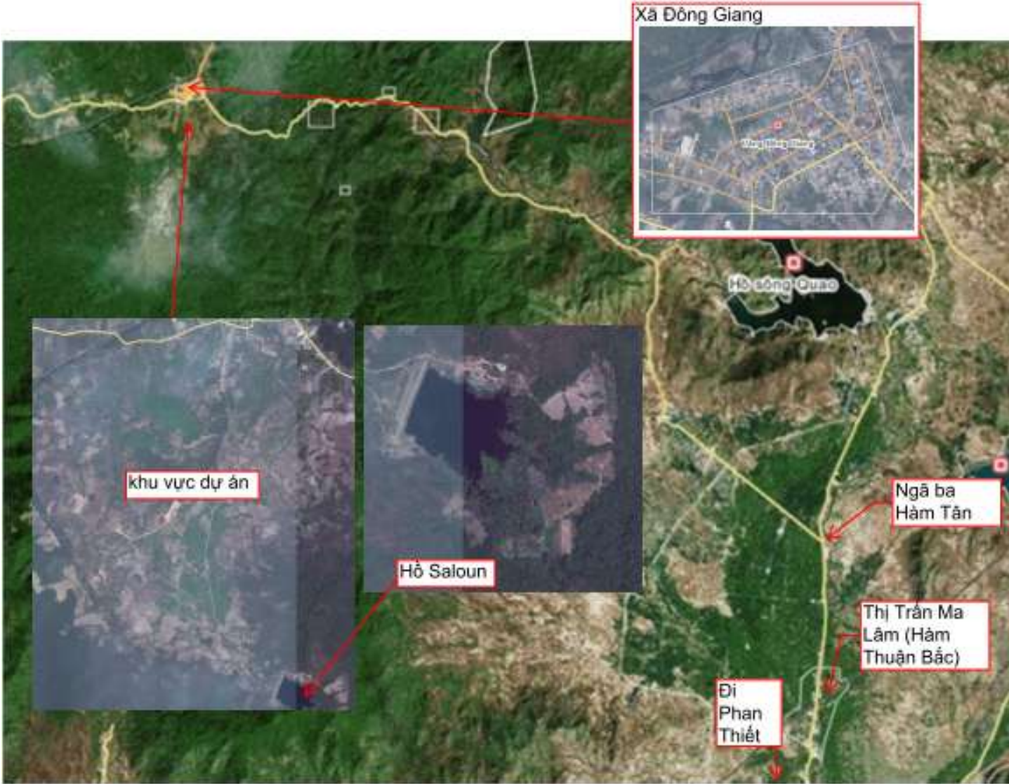
Figure 1: Location of Subproject