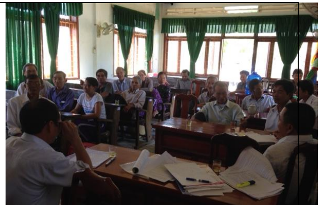
Consultation in Binh Thuan Commune