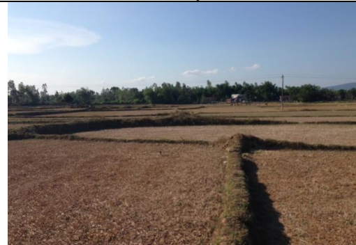
Canal section in Cat Tan