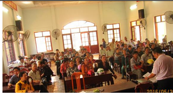
Consultation in Cat Tan Commune