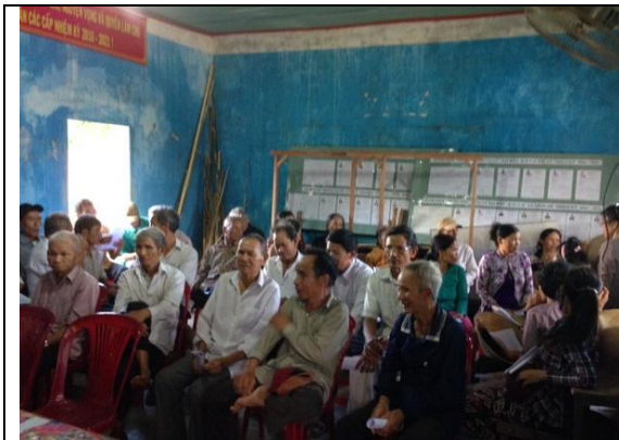
Consultation in Nhon My Commune