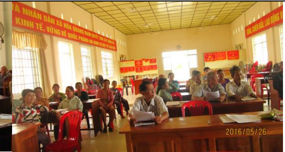
Consultation in Tay An Commune