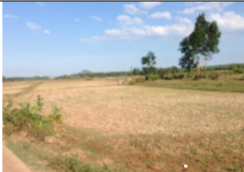
Canal section in Cat Tan