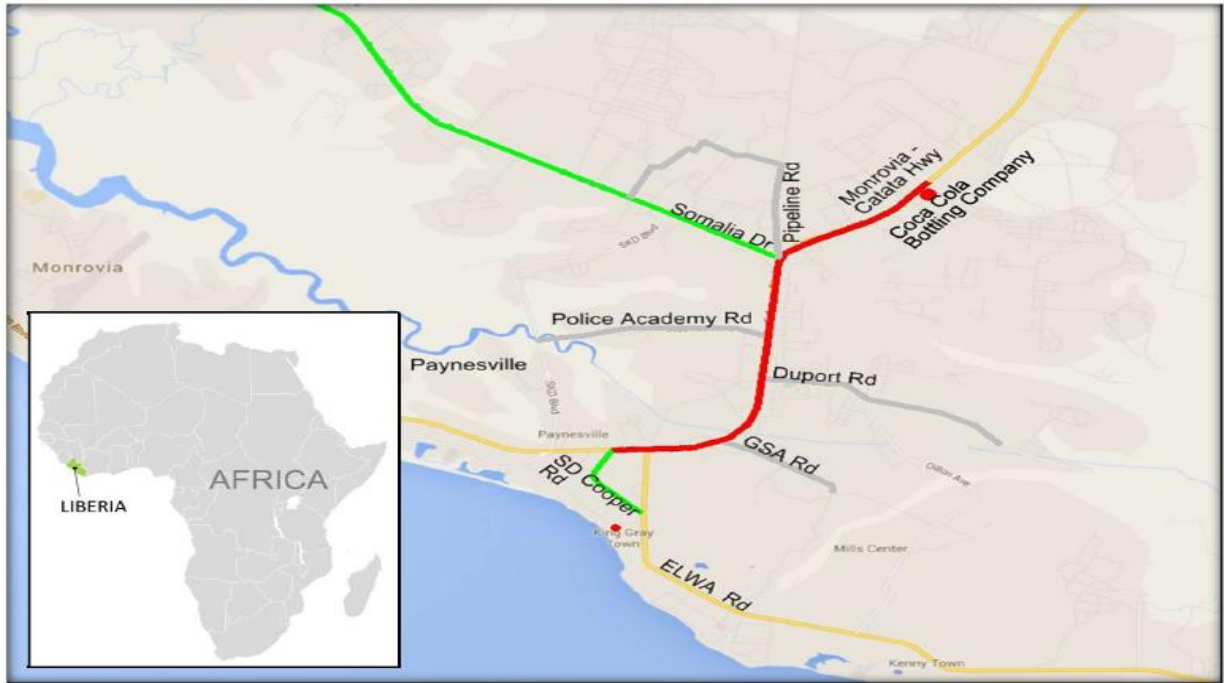
Figure: 1 Map of Project Area