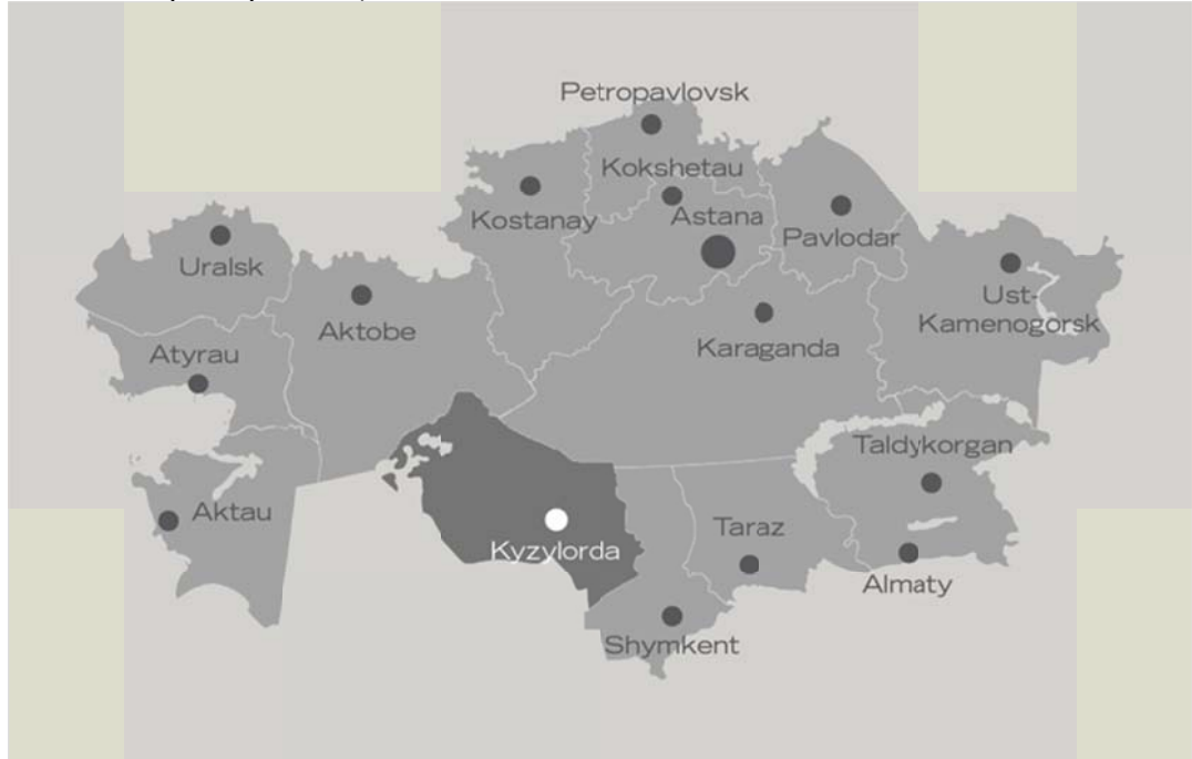
Exhibit 1 Location of the Kyzylorda City

The City of Kyzylorda is located in the Southern Part of Kazakhstan on the northern bank of Syrdarya river, as seen in Exhibit 1.