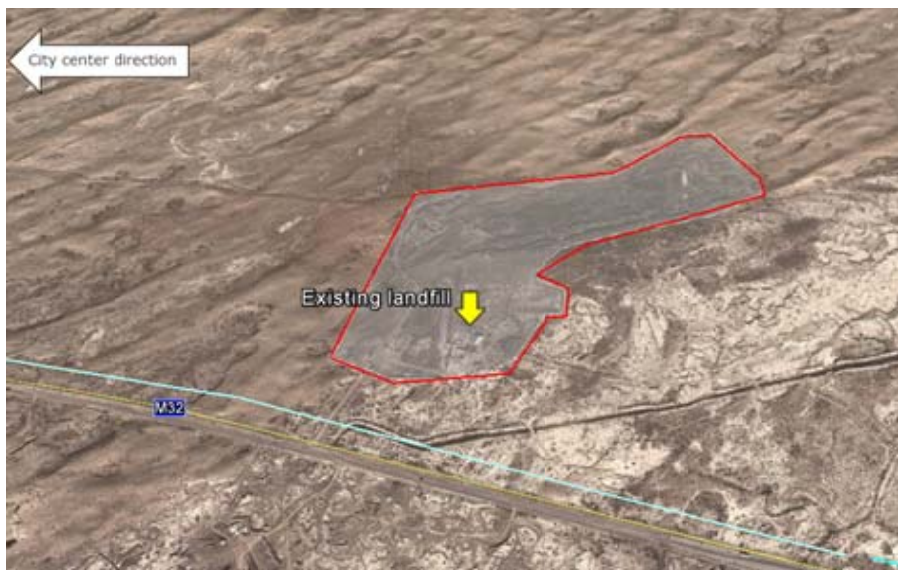
Exhibit 2 Municipal solid waste landfill