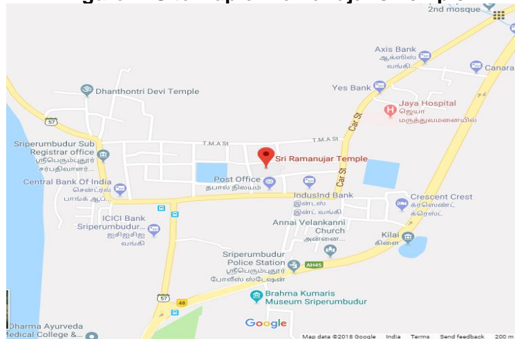
Figure 2. Site Map of Ramanujar's Temple

14. Location. Sriperumbudur is a town panchayat in the Indian state of Tamil Nadu located 40 kilometers southwest of the city of Chennai on the National Highway 4. It is known for being the birthplace of Sri Ramanuja, one of the most prominent Hindu Vaishnava saints. The former Indian Prime Minister Rajiv Gandhi was assassinated here in 1991. Since 2000, Sriperumbudur has seen rapid industrialization. The old name of Sriperumbudur is "Bhoodhapuri.