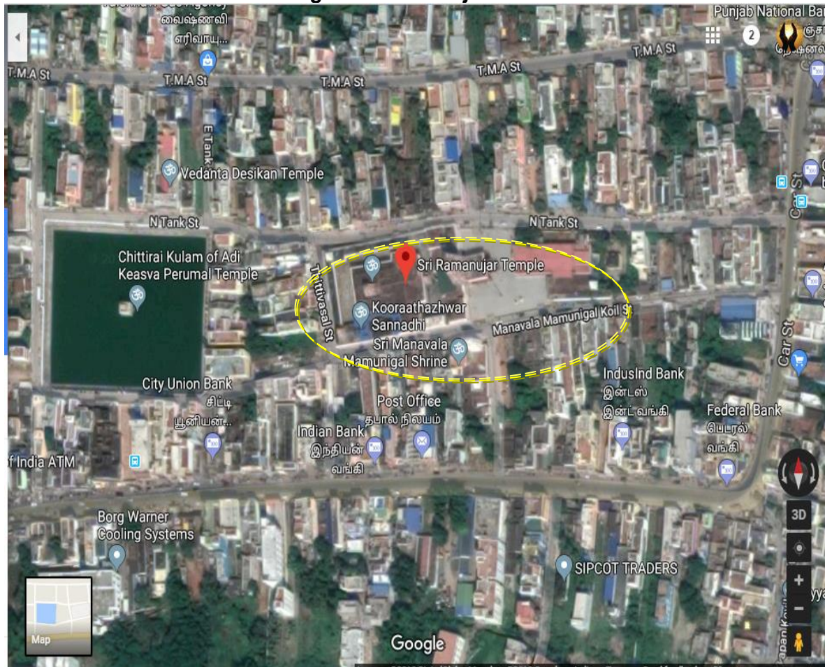
Figure 1: Sub Project Location

13. Purpose of the IEE. The IEE was based on a careful review of subproject site plans, detailed design and reports, defined management plans, field visits, stakeholder consultations/discussions and secondary data to characterize the environment and identify potential impacts. The adverse environmental impacts for this contract package are primarily related to the “Development and Tourist Information Centre & Theatre, Cultural Centre, Hostel Building, Dormitory Hall, Library and Bookshop and Road Along with Other facilities at Sri Ramanujar’s Birth Place in Sriperumpudhur in Kancheepuram District”. Therefore, as per the Asian Development Bank’s (ADB) Environmental Assessment Guidelines (SPS 2009), the subproject components are categorized as ‘B’ and an IEE carried out. This IEE provides mitigation measures for impacts related to location, design, construction, operation, and maintenance. The REA checklist is attached as Appendix 3 with this report.