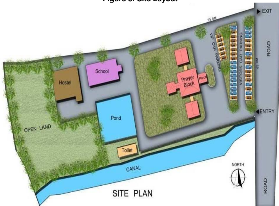
Figure 3: Site Layout