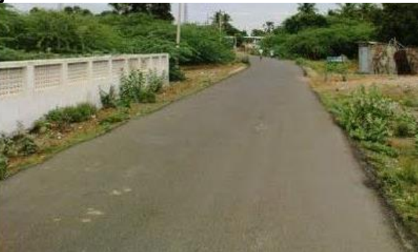
Nagore Beach Road at Nagapatinam District