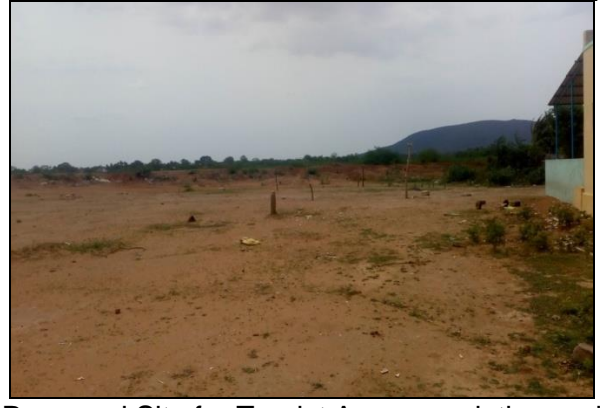
Proposed Site for Tourist Accommodation and Basic Facilities in Veerapor, Trichy