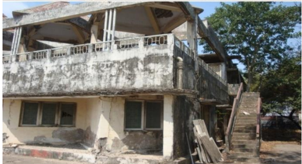
Construction of Tourist Accommodation at Chidambaram in Cuddalore District