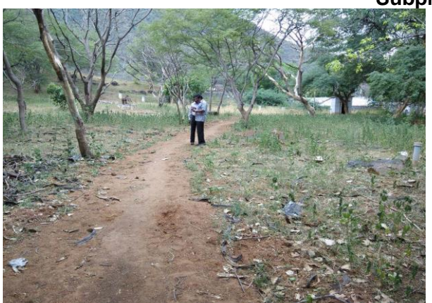
Proposed Site for Building Cottage at TTDC Hotel Hogenakkal