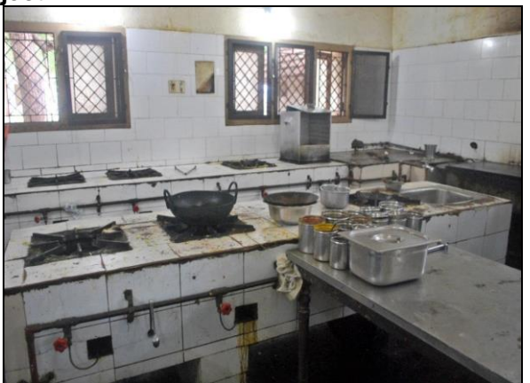
TTDC Hotel, Kanyakumari