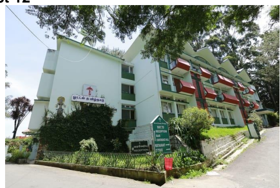
Tamilnadu Tourism Development Corporation Complexes