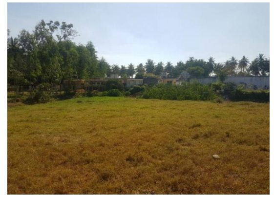
Proposed Site for Construction of Tourist Accommodation and Basic Infrastructure at Alangudi, Thiruvarur District and Arulmigu Vedaraneswarar Temple, Vedaranyam, Nagapattinam District