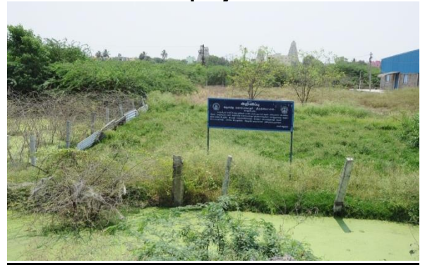
Proposed Site for Tourist Accommodation in Kanchipuram