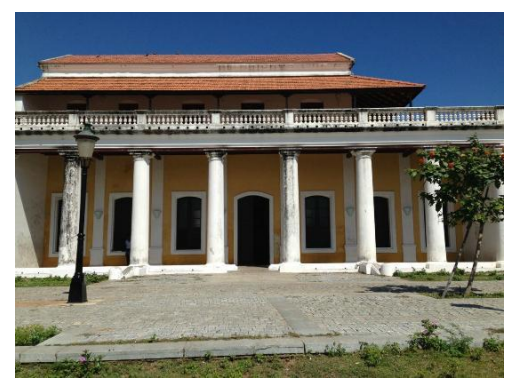
Governor House, Tharangambadi