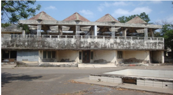
Construction of Tourist Accommodation at Chidambaram in Cuddalore District