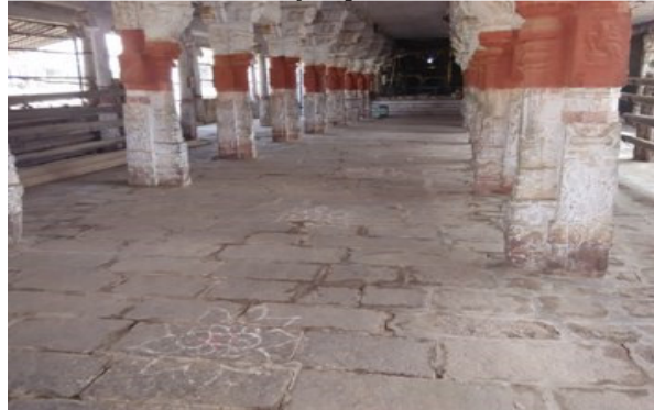
Development of Ramanujar's BirthPlace in Sriperumpudur, Kancheepuram District