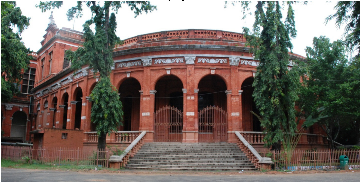
Improvement Works in Government Museum (Egmore Museum)