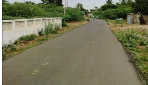
Nagore Beach Road at Nagapattinam District