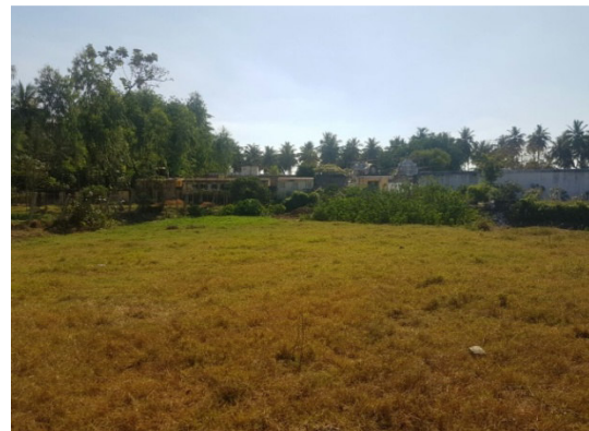
Proposed Site for Construction of Tourist Accommodation and Basic Infrastructure at Alangudi, Thiruvavur District and Arulmigu Vedaraneswarar Temple, Vedaranyam, Nagapattinam District