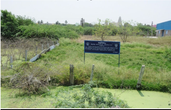
Proposed Site for Tourist Accommodation in Kanchipuram