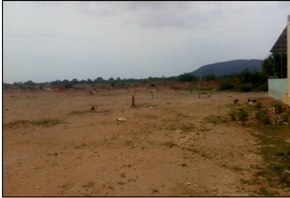
Proposed Site for Tourist Accommodation and Basic Facilities in Veerapor, Trichy