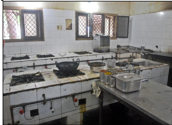
TTDC Hotel, Kanyakumari