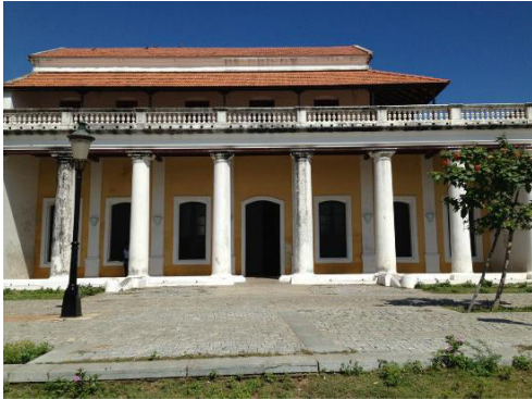
Governor House, Tharangambadi