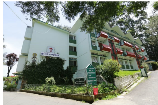
Tamilnadu Tourism Development Corporation Complexes