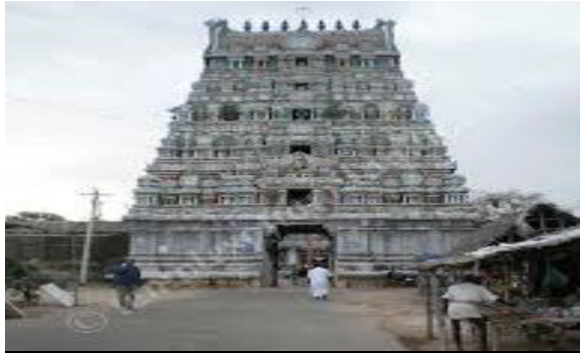
Sri Lalithambigai Temple at Thiruvavur District