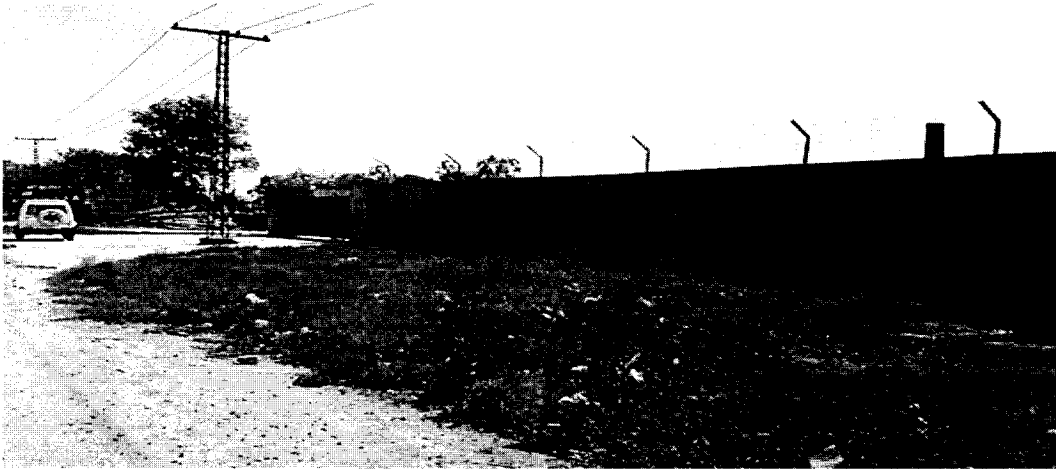
Main Gate and boundary wall of Punjab University Grid Station land