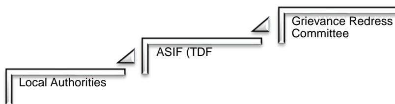
Figure 2. Grievance Redress Mechanism

ASIF (TDF) in order to provide a direct channel to the affected PAPs and community members for approaching ASIF (TDF) and have their grievance recorded and redressed in an appropriate time frame will establish a first step of grievance redress mechanism in cooperation with Local Authorities. Prior to RAP preparation as well as Construction works, ASIF (TDF) will inform the beneficiary community about the grievance redress mechanism and provide contact details of persons responsible for grievance collection and response in the community.