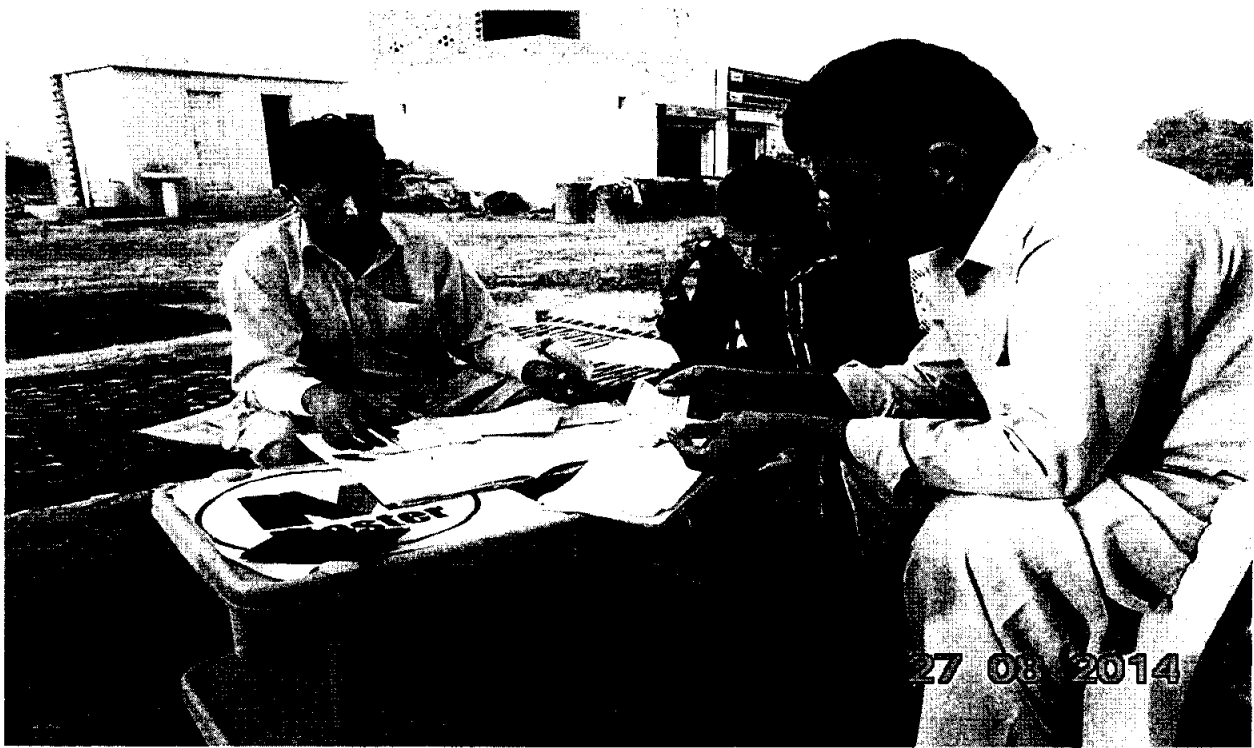
Distribution of Crop compensation cheques to AP at their door step