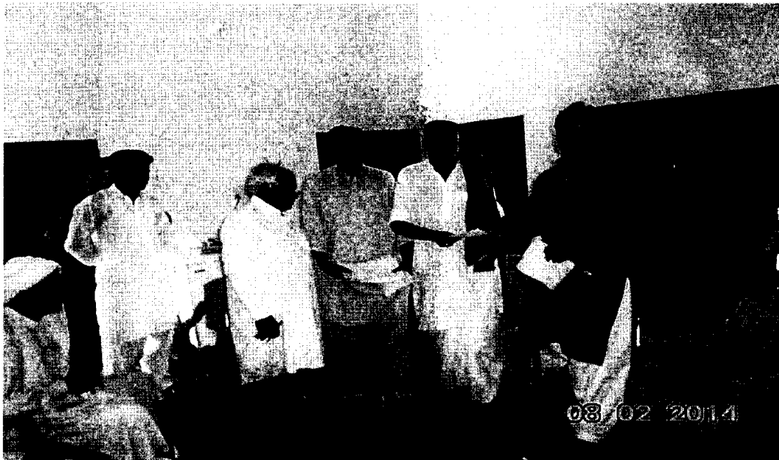
Distribution of crop compensation cheques to AP at HB Shah -18-Hazari Transmission Line