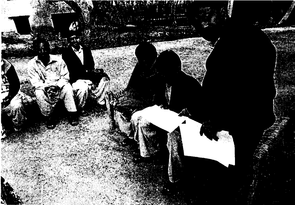
Social Safeguard Expert giving brochure to the community of RakhDagran