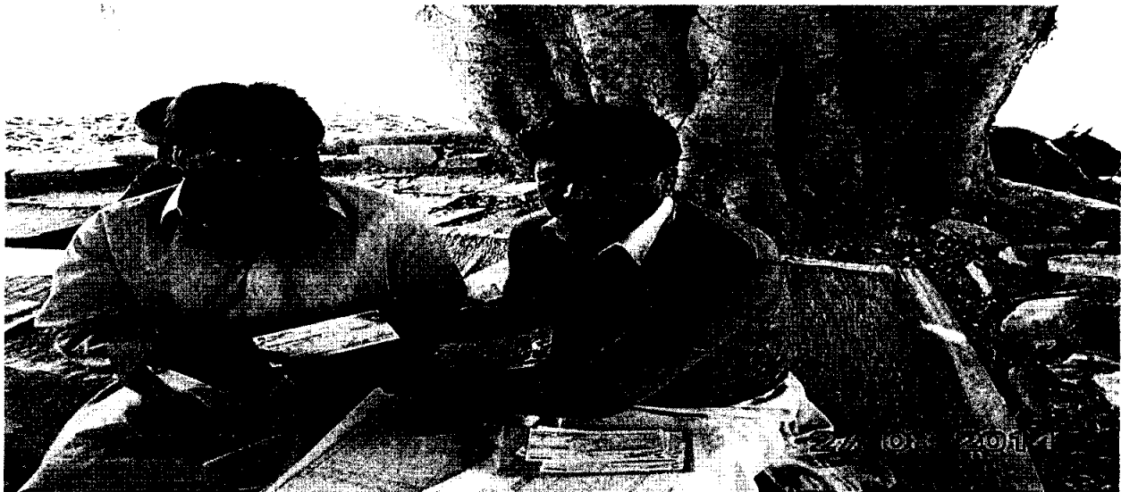
Distribution of Crop Compensation under religious Tree BORE