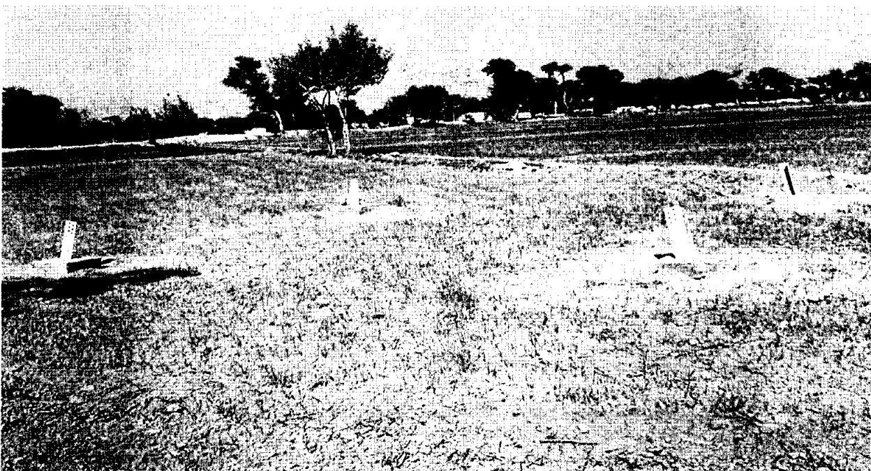
Restoration and backfilling of Tower Foundation Area