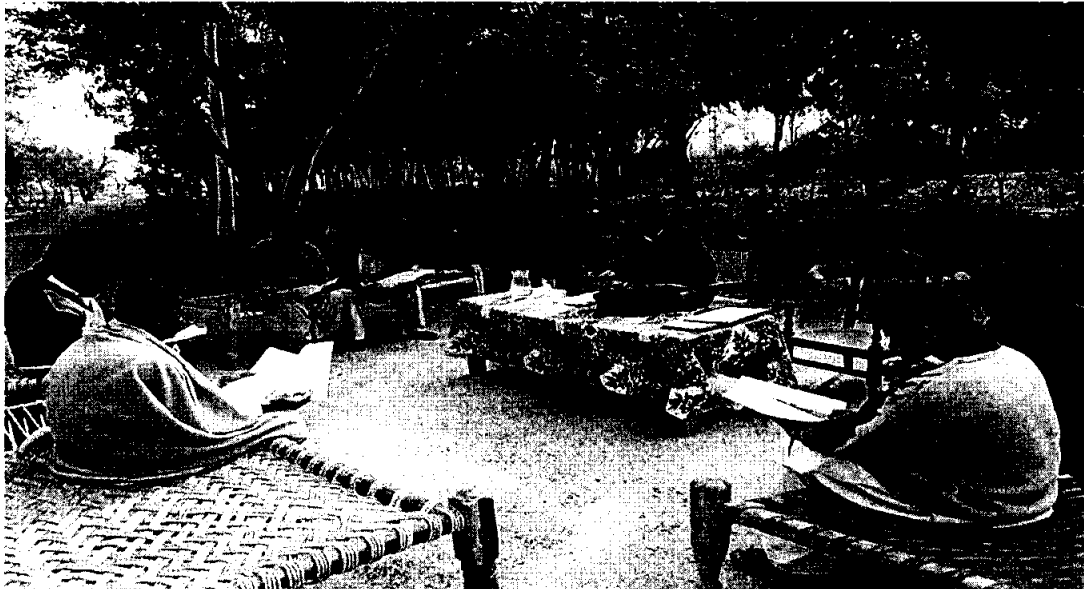
Consultation with Community of Barkatwala for the Grid Station RakhDagran