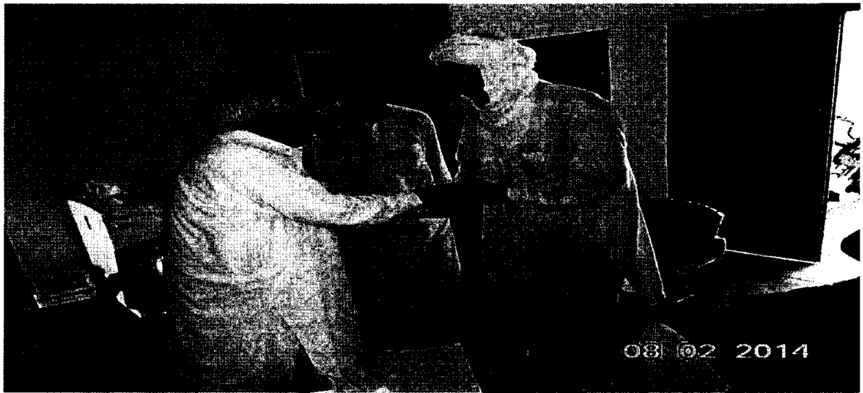
Distribution of crop compensation cheques to AP at HB Shah -18-Hazari Transmission Line