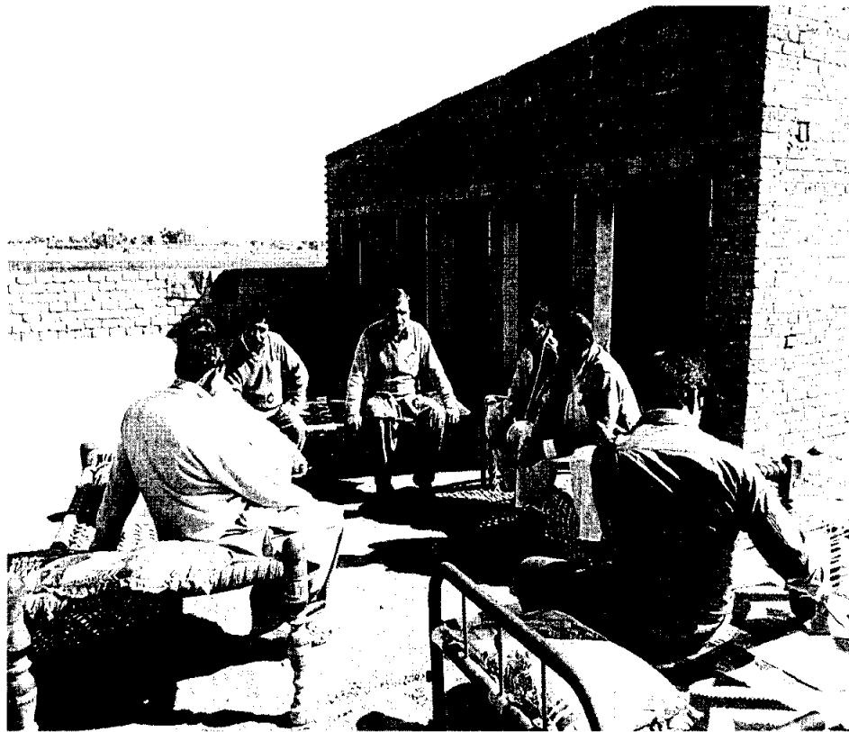
Consultation with the Affected Community of Kala Bagh Transmission Line