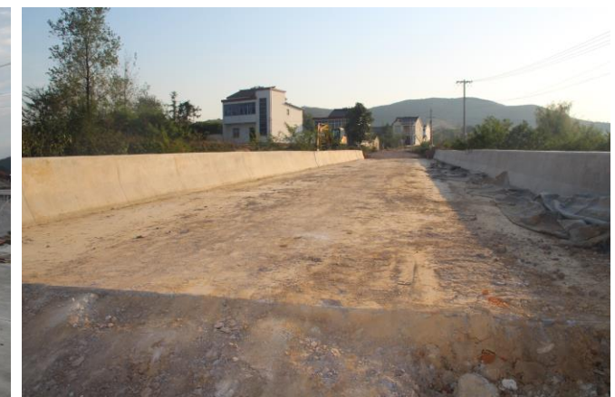
Dangerous Bridge Renovation, Shucheng 2015