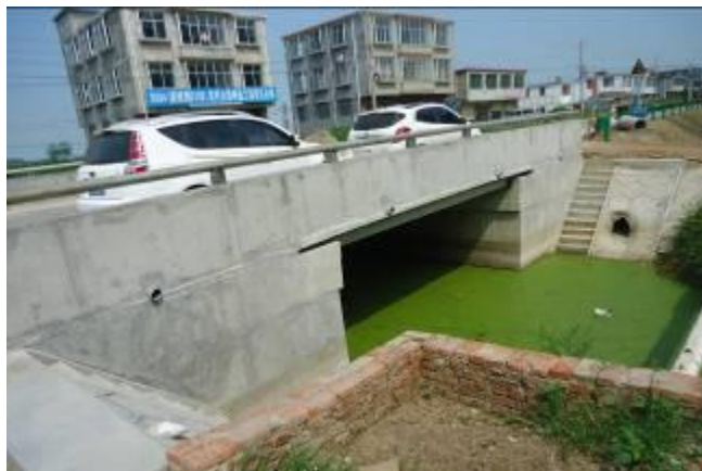
Dangerous Bridge Renovation, Xiaoxian, 2017