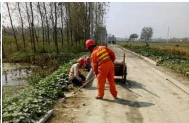
Ruxiying Road, Lixin, 2017