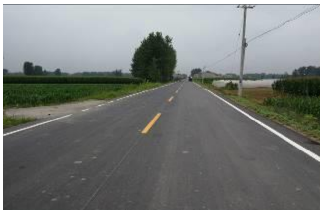
Zhaoji –Gongqiao, Funan, 2017