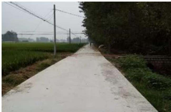
Huailiulu – Dongguan, Shouxian, 2016