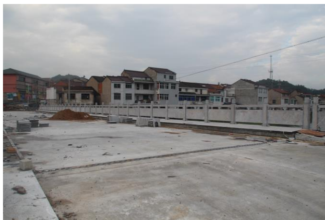
Dangerous Bridge Renovation, Shucheng, 2014