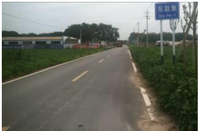
Chenyang Road, Sixian, 2017