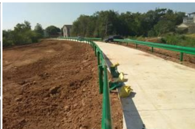
Dama Road, Hanshan, 2017