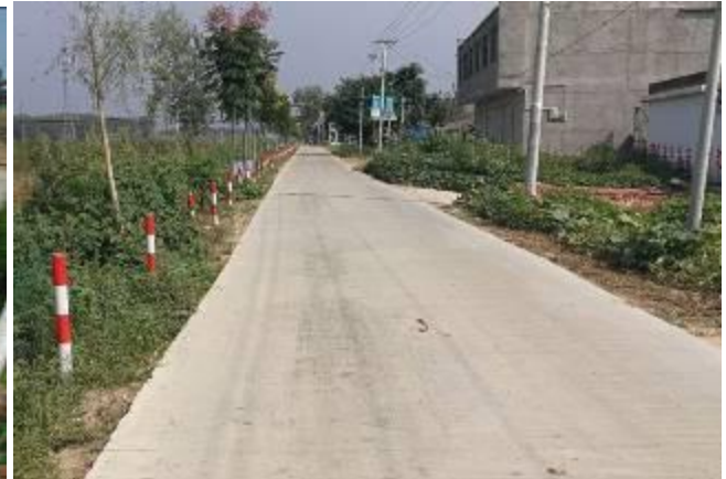
Road Safety Measures, Linquan, 2017