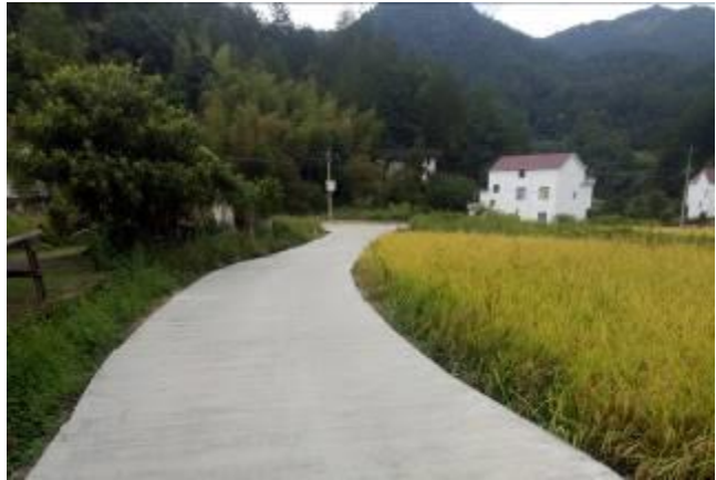
Dianqian Rural Road, Yuexi, 2017