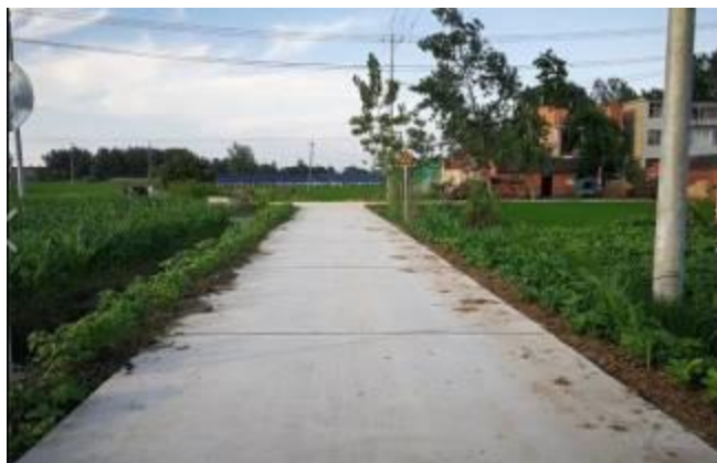
Yangqiao Zhongxilu, Linqun, 2017