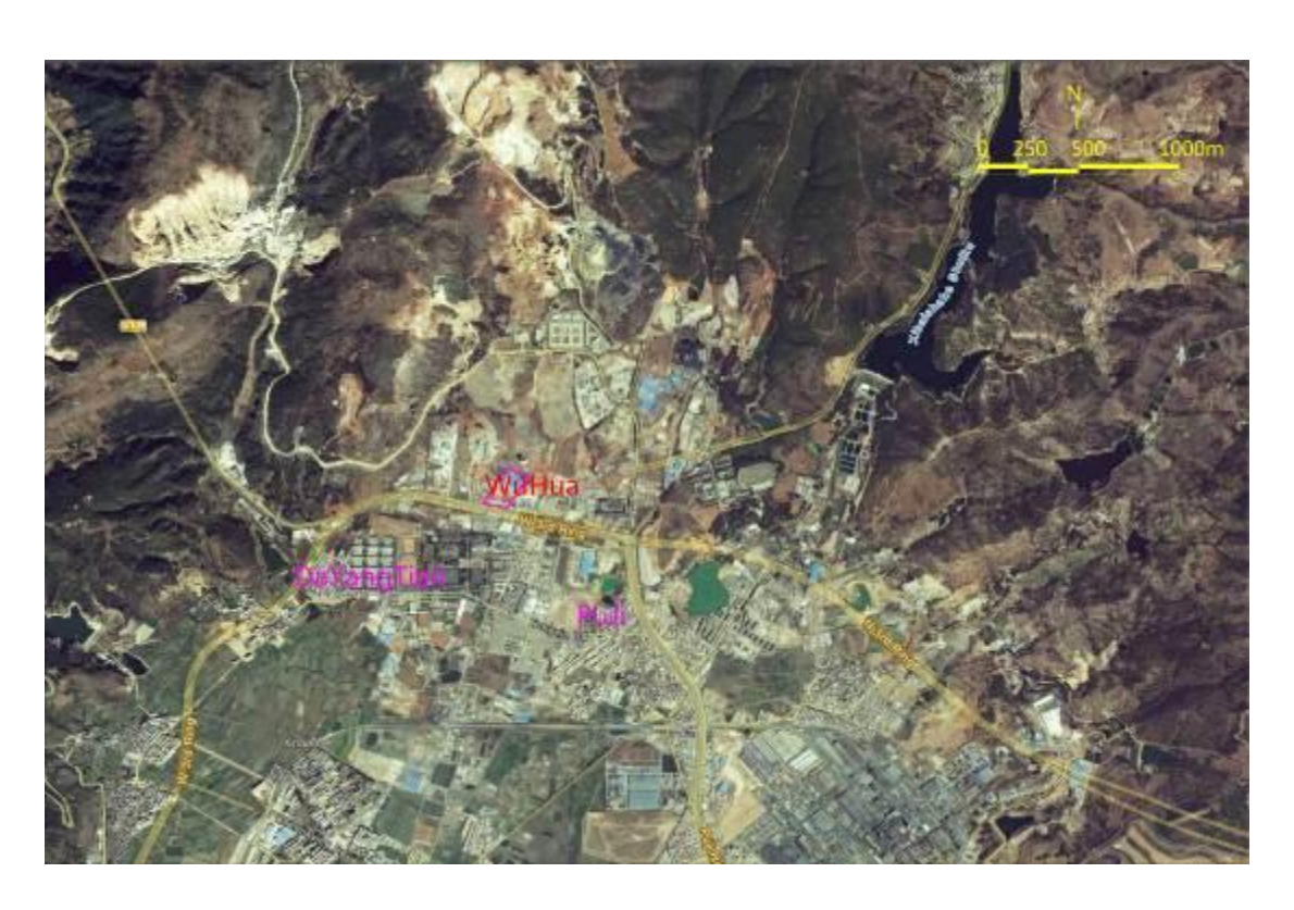
Figure 1-2 Wuhua incinerator and nearby village/community