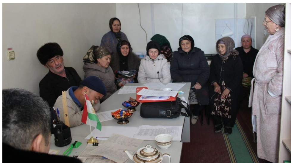
Figure 6. Consultation in Yangiobod Jamoat, Spitaмен District, Sughd Region