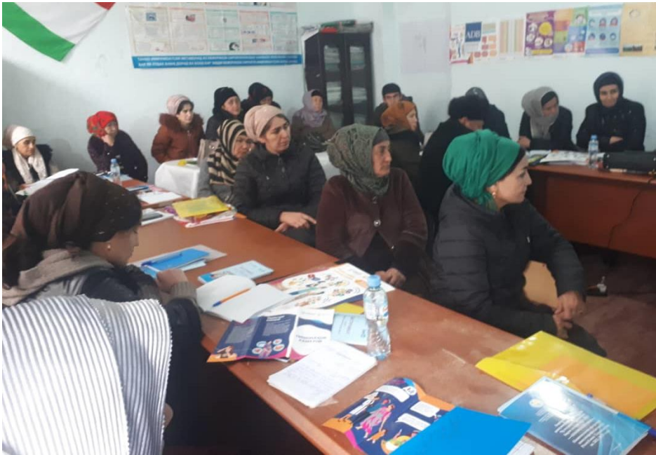
Figure 9. Consultation in Fakhrobod Jamoat, Khuroson District