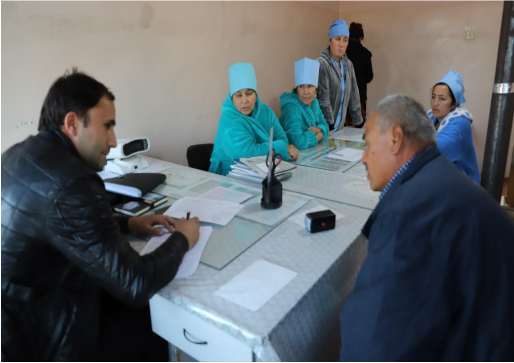
Figure 3. Lolazor RHC personnel, Devashtich district, insert date