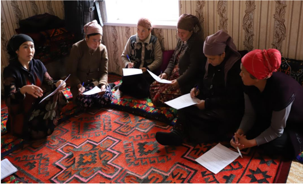
Figure 1 Population of Kushtegirmon village, Spitamen district