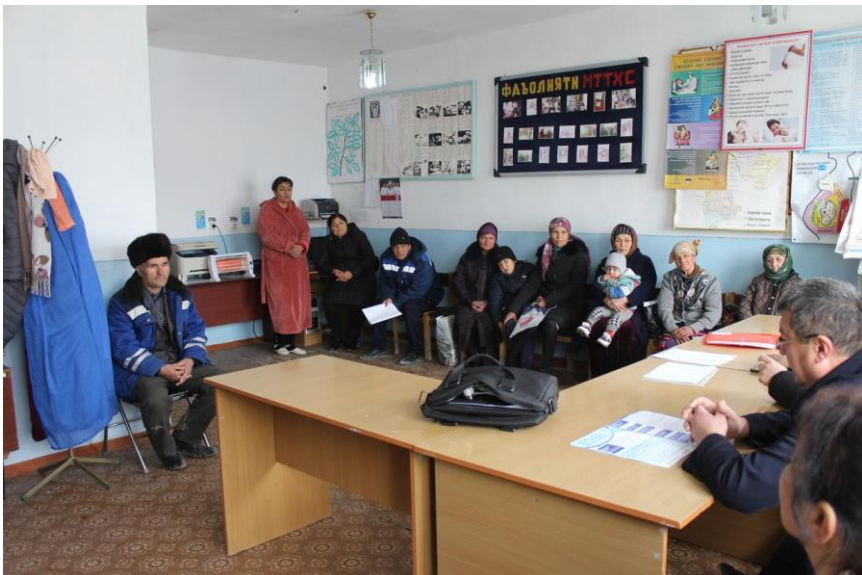
Figure 4 Consultations in Gazantarak Jamoat, Devashtich District, Sughd Region