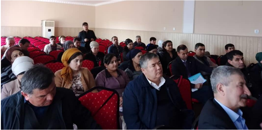
Figure 8. Consultation in Guliston Jamoat, J. Balkhi District