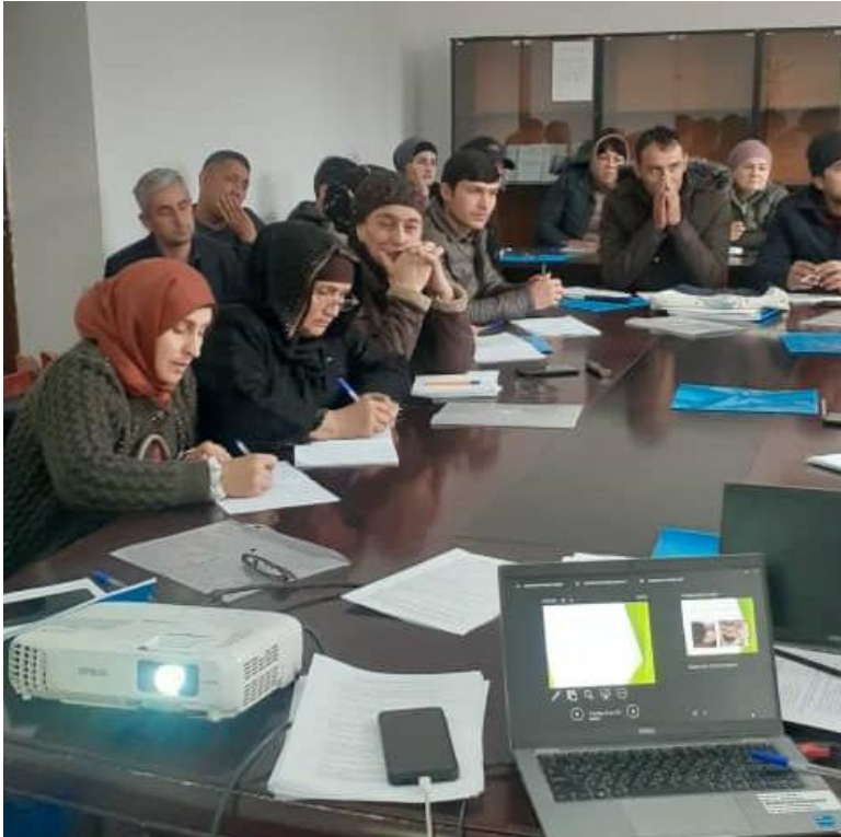
Figure 10. Consultation in Kyzyl Kala Jamoat, Khuroson District

36 Zugurova Umada 37 Bobobekov Khairullo