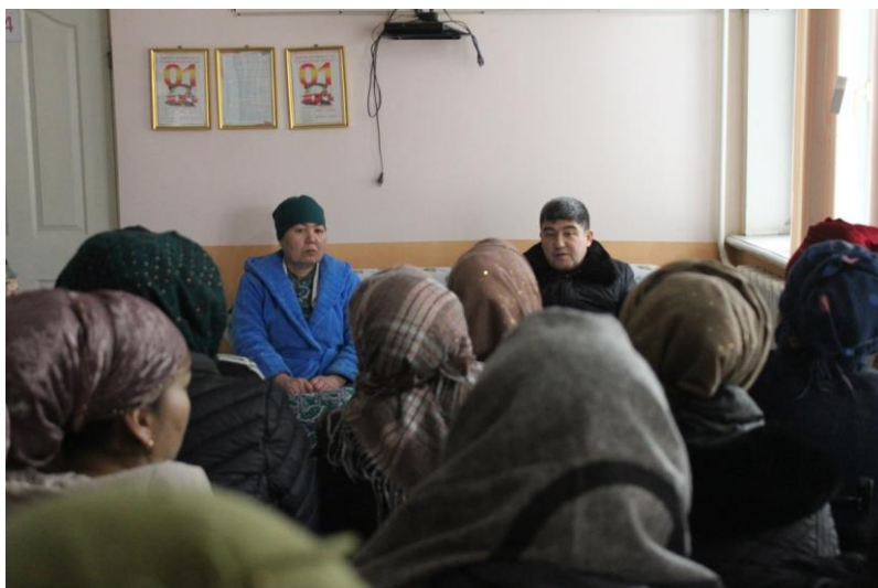
Figure 5. Consultations in Kurush Jamoat, Spitaamen District, Sughd Region