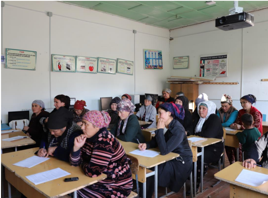
Figure 2. Population of Lolazor RHC, Devashtich district insert date