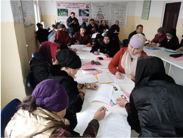
Figure 7. Consultation in Navobod Jamoat, J. Balkhi District