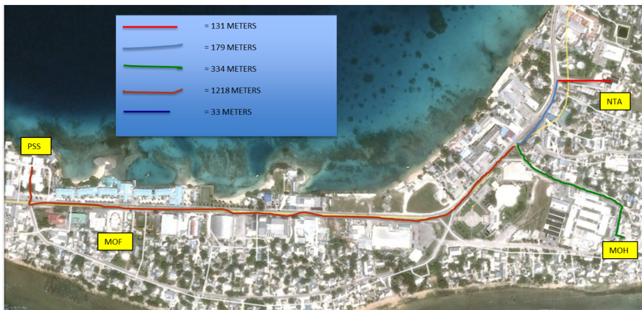
Figure 1 Majuro Local Area Network (LAN)

The LANs will involve below-ground installation of fibre-optic cabling housed in conduit. This will involve digging a narrow trench, using an excavator or trenching machine, to a depth of three feet and emplacement of the conduit. The trench will then be backfilled with excavated material and sealed with concrete at the surface. The total length of trenching on Majuro is expected to be approximately 1,900 metres and on Ebeye 1,100 metres and will be situated beneath the road verges. The LAN will also include pits to house conduit connections.