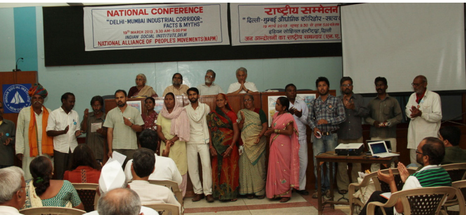
Activists meeting to discuss the Delhi Mumbai Industrial Corridor.

So does the NIIF or the AIIB have the systems in place to ensure this same mistake is not repeated? The AIIB's President has similarly expressed his doubts around coal; but does his team have the means to ensure FI investments do not end up backing coal?