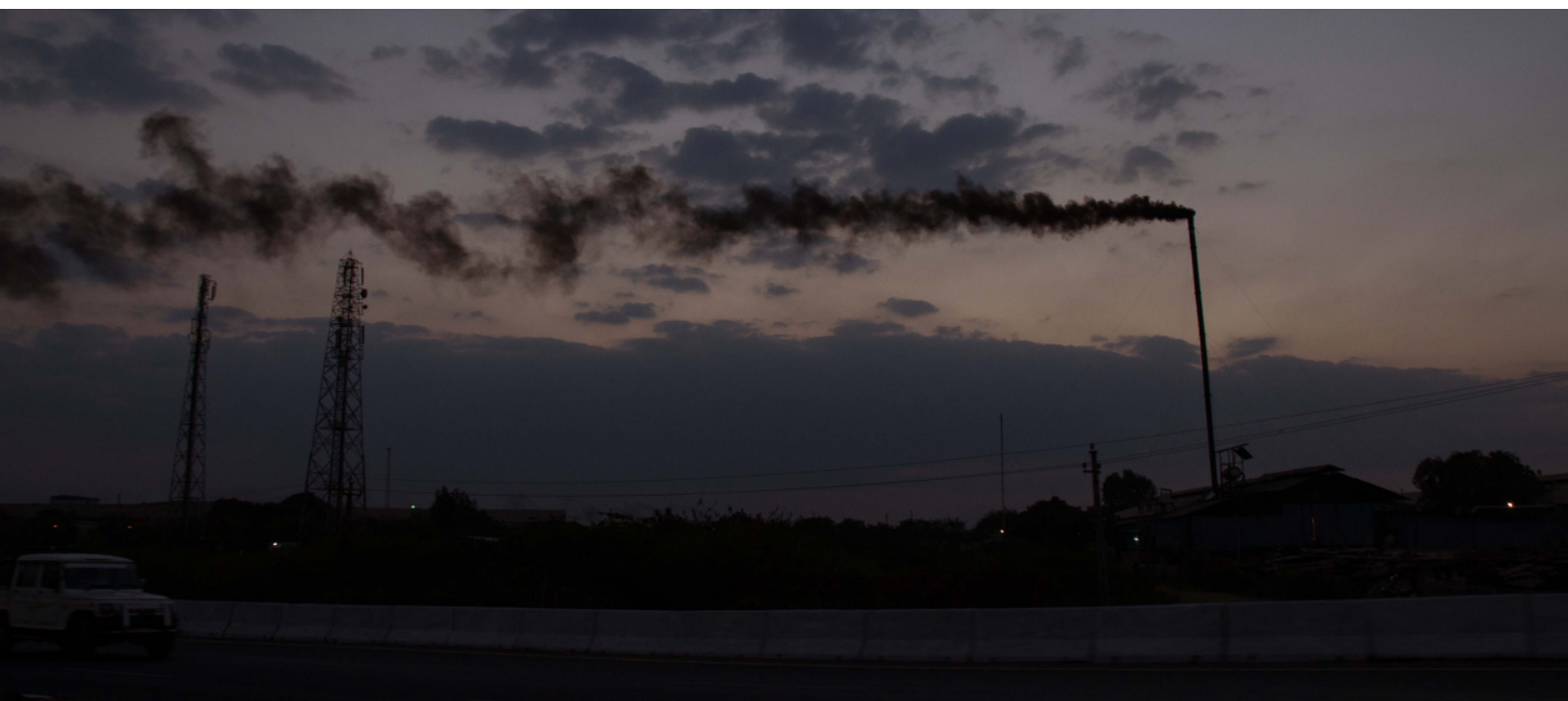
One of many polluting industries on the Assam-Meghalaya border.