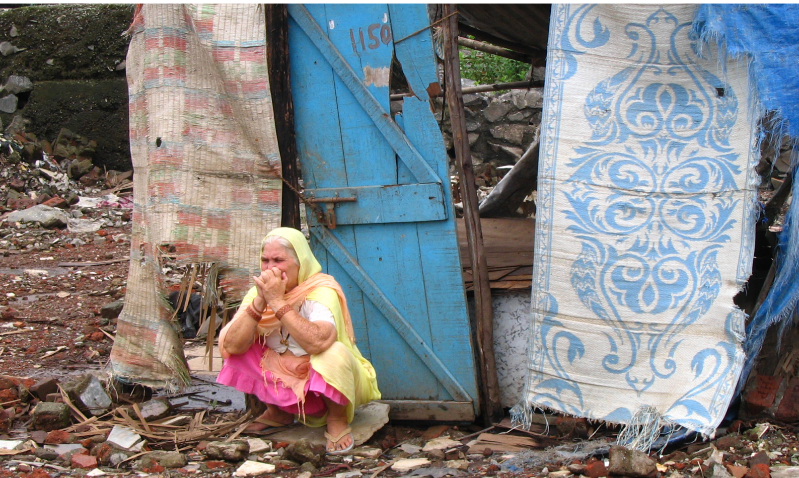
An old lady sitting dejected in front of the partly demolished structure which was once her home. Mumbai witnessed massive urban demolitions in the recent times, that has left many thousands homeless.

versial stalled projects will once again be brought forward if funding becomes available from the NIIF?