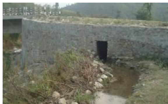
Reinstated irrigation canal, Kawa Khola Bridge

Program activities are unlikely to encroach upon or degrade sensitive habitats because the Program excludes any bridges located in sensitive areas of biodiversity such as protected national park areas. Adverse environmental effects of the bridge works are likely to be temporary in nature but depending on local conditions may have implications for the following issues to varying degrees.