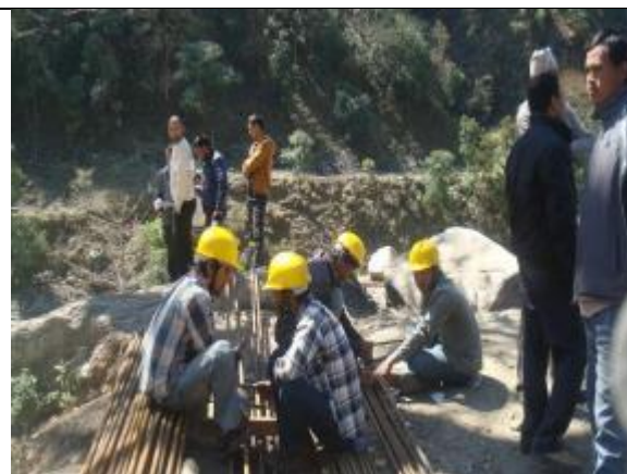
Workers on duty at Tipadagad bridge