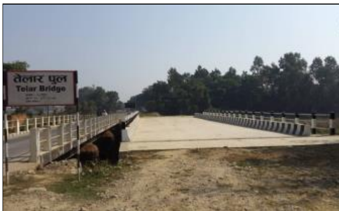
Completed Telar Bridge, Rupandehi