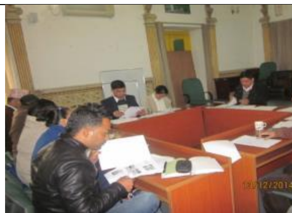
Safeguard orientation training to DoR, SM provided by GESU