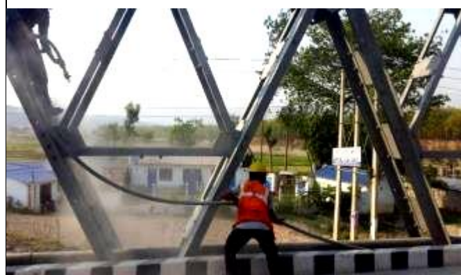
Sand Blasting work at Girwari Khola Bridge(45-H001-249)