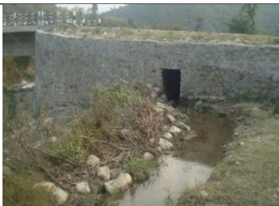
Reinstated irrigation canal, Kawa Khola Bridge