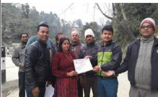
Distributing certificate of honor to the voluntary land donor