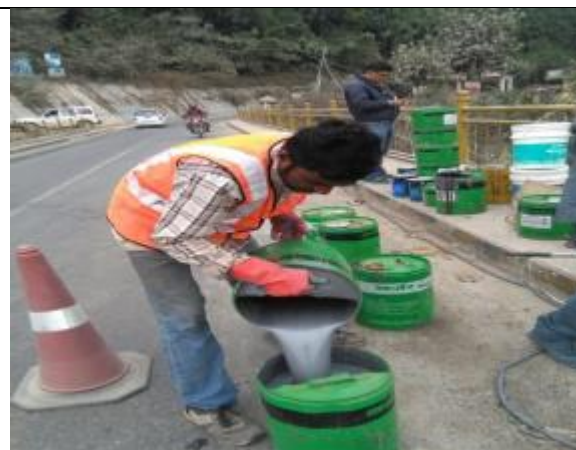
Repair (painting) works ongoing