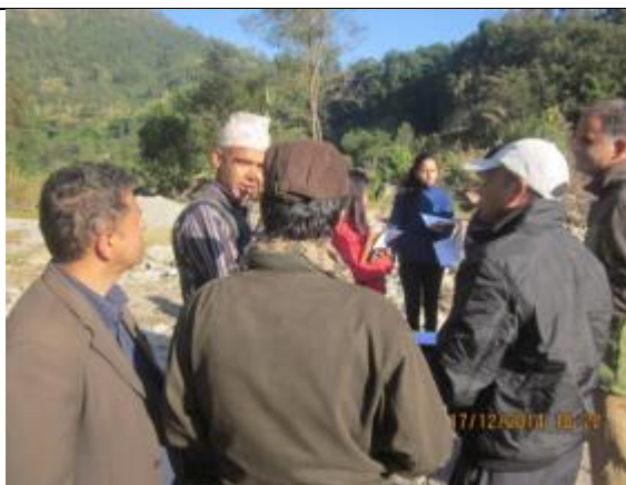
Consultation with community people during field visit