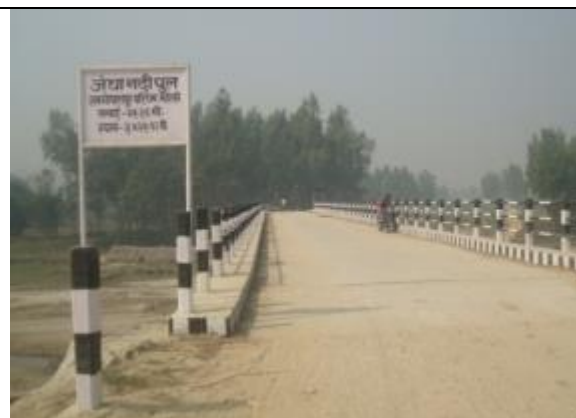
Completed bridge Jangaha river bridge