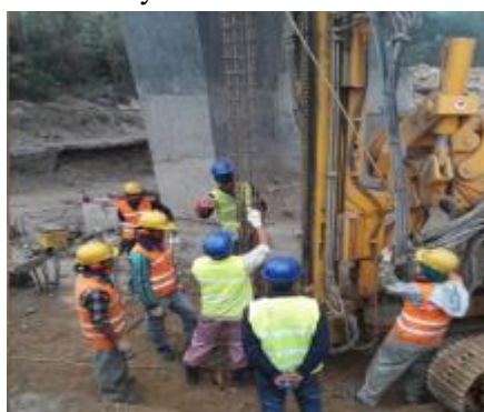
Workers on duty with safety gear

At the same time, the Program is expected to deliver several environmental benefits. The repair and maintenance of bridges will ensure that the risks of bridge failure are reduced and that erosion and sedimentations are minimized through repair of failing foundations and river training or abutment works. Improved performance of the DOR with respect to environmental planning and management will help to ensure that issues are identified earlier and more consistently and that contractors will be supervised more regularly and environmental provisions of contracts enforced more consistently.