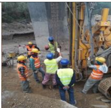
Workers on Major maintenance works at Jharai river bridge (45-H001-244)