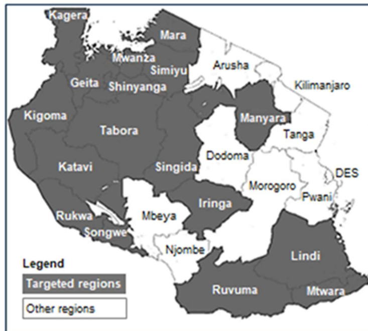
Figure 1: Targeted Regions of the Country under Parent Program and AF (Dark Shaded). AF will now be extended to unshaded Regions

2.4.2 Despite the remarkable achievements, the Program remains highly relevant to Tanzania’s rural water and sanitation sector development agenda, given that rural WSS services still need further support to improve access. With the establishment of RUWASA, water supply services are organized through CBWSOs, with technical support from the district and regional levels. Nevertheless, rural access to basic drinking water services stood at 45.4 percent in 2020, a number that is well below the Sub-Saharan African average of 56 percent. Beyond access, availability (distance and hours of service) and quality remain an issue for the sector. Unfortunately, the high correlation between poverty and lack of access to basic water supply means that the impact of subpar service performance falls disproportionately on the poor. Therefore, the Program is targeting regions that have low coverage of water supply and sanitation services, as well as high poverty and stunting rates. Furthermore, when developing solutions to address poor service performance, consideration needs to be given to the fact that vulnerable people, such as the elderly, disabled people, and women and children, experience different kinds of difficulty accessing water supply and sanitation services than groups that are not considered vulnerable. The sector requires continuous effort to maintain sustainable services and further efforts are needed to reach the Government program targets and Sustainable Development Goals.