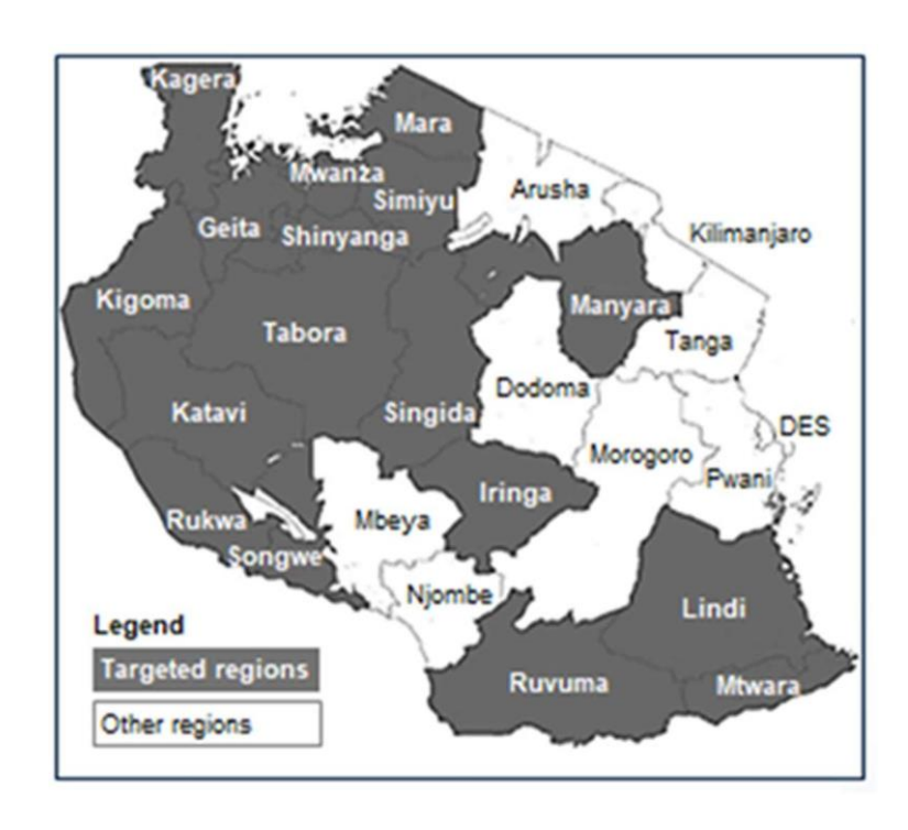
Figure 1: Targeted Regions of the Country under Parent Program and AF (Dark Shaded). AF will now be extended to unshaded Regions

2.4.2 Despite the remarkable achievements, the Program remains highly relevant to Tanzania's rural water and sanitation sector development agenda, given that rural WSS services still need further support to improve access. With the establishment of RUWASA, water supply services are organized through CBWSOs, with technical support from the district and regional levels. Nevertheless, rural access to basic drinking water services stood at 45.4 percent in 2020, a number that is well below the Sub-Saharan African average of 56 percent. Beyond access, availability (distance and hours of service) and quality remain an issue for the sector. Unfortunately, the high correlation between poverty and lack of access to basic water supply means that the impact of subpar service performance falls disproportionately on the poor. Therefore, the Program is targeting regions that have low coverage of water supply and sanitation services, as well as high poverty and stunting rates. Furthermore, when developing solutions to address poor service performance, consideration needs to be given to the fact that vulnerable people, such as the elderly, disabled people, and women and children, experience different kinds of difficulty accessing water supply and sanitation services than groups that are not considered vulnerable. The sector requires continuous effort to maintain sustainable services and further efforts are needed to reach the Government program targets and Sustainable Development Goals.