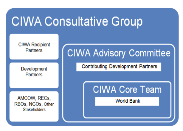
Figure 1: CIWA Structures

32. The Grant is being financed through the multi-donor trust fund for Cooperation in International Waters in Africa (CIWA). The CIWA MDTF is administered by the World Bank and has established two levels to facilitate management and governance of the supported activities. This includes: i) at the <u>CIWA Program Level</u> to guide the strategy and activities of the work of CIWA as a whole (Figure 1); and, ii) at the <u>CIWA Basin Level</u> with specific international river basins and regions which are responsible for the detailed activities within a river basin window (Figure 2).