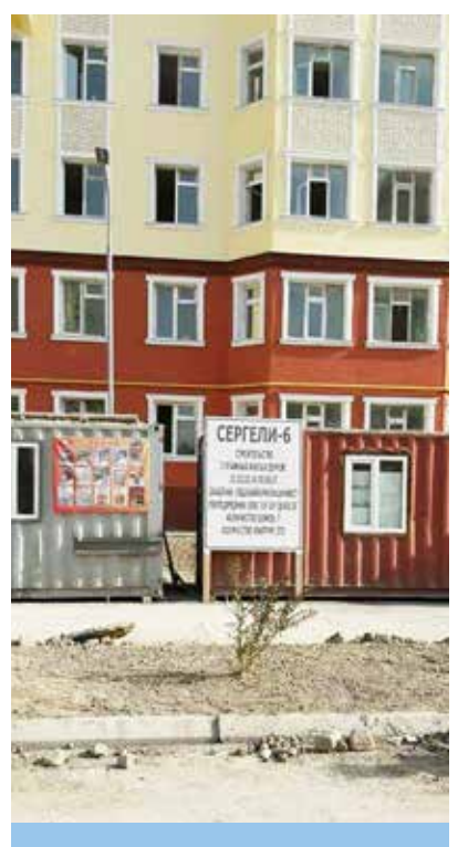
Teachers of a school in Uzbekistan's capital, Tashkent, were sent to clean up these new buildings in the Sergeli district of the city. November 5, 2018.

As this research was being conducted, officials in the Fergana region appeared to have been enforcing policies against forced labor. All eight of the public-sector employees interviewed in the Fergana region in May and June described being forced to work outside their regular jobs until April. All except one said that since the president's order prohibiting forced labor for public-sector workers, their employers had stopped requiring them to participate.<sup>31</sup> One doctor in Fergana said that while some forms of forced labor had stopped since April, some hospital staff, including nurses, continued to be forced to sweep, plant flowers and weed, especially on hospital grounds and in the surrounding area.<sup>32</sup>