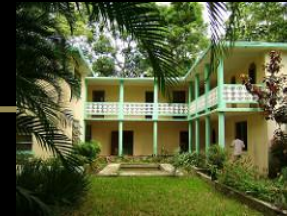
Université Du Nord Cap-haitien