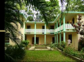
Universite Du Nord Cap-haitien