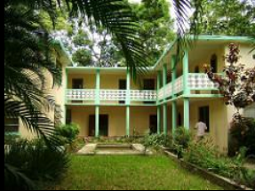
L'Université Chrétienne du Nord d'Haïti