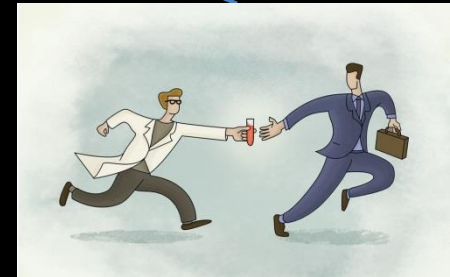
TTO/Tech Dissemination Center