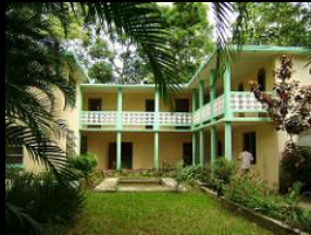
L'Université Chrétienne du Nord d'Haïti