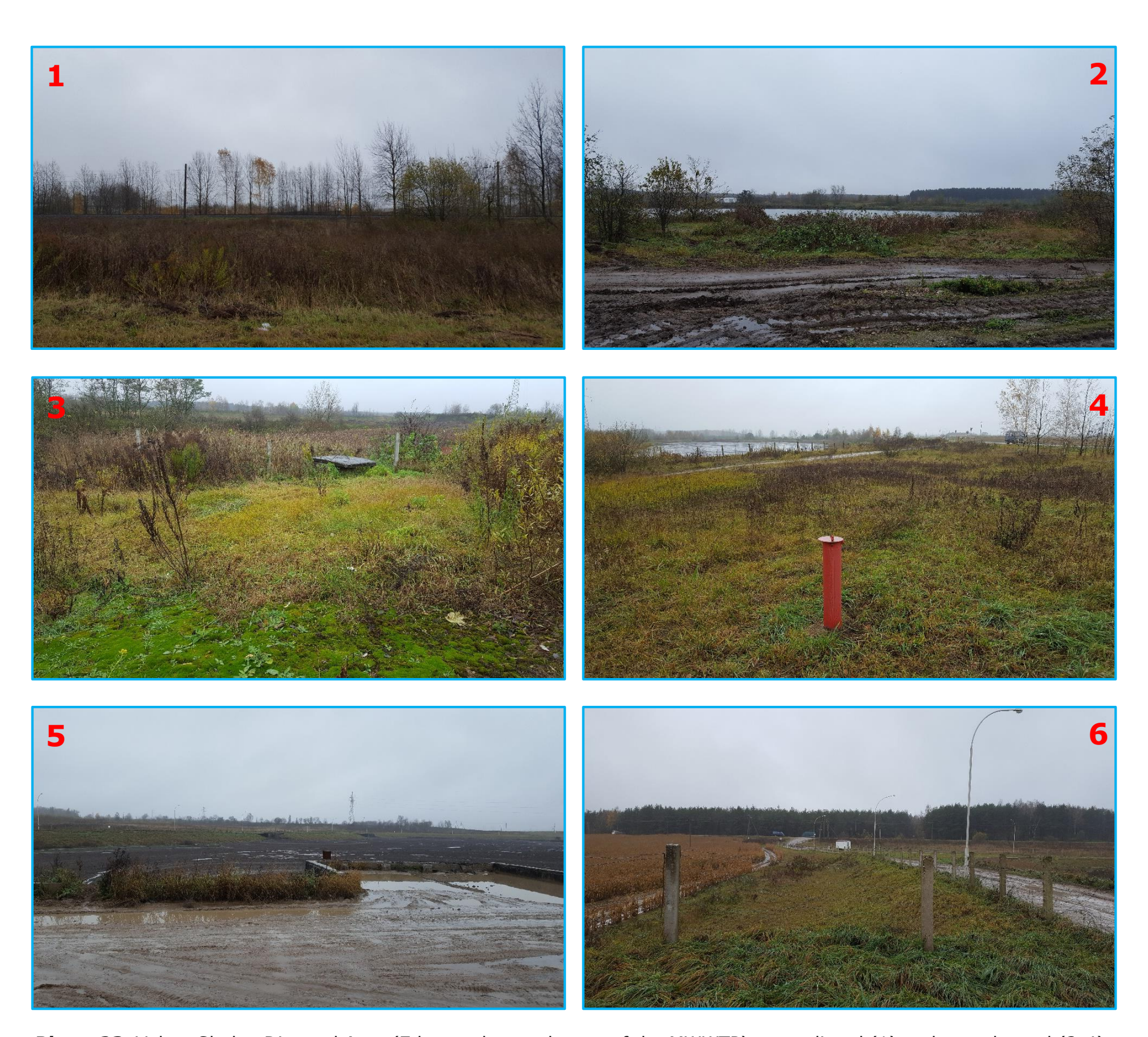
Photo 23. Volma Sludge Disposal Area (7 km to the south-east of the MWWTP): remediated (1) and waterlogged (2-4) ponds; the sludge pond in current operation (5) and adjoining area (6) with croplands located across the access road