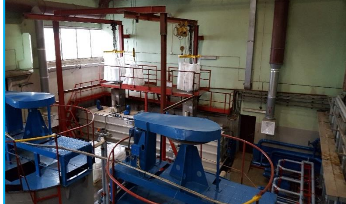
Photo 8. Exterior and interior view of the sludge dewatering facility