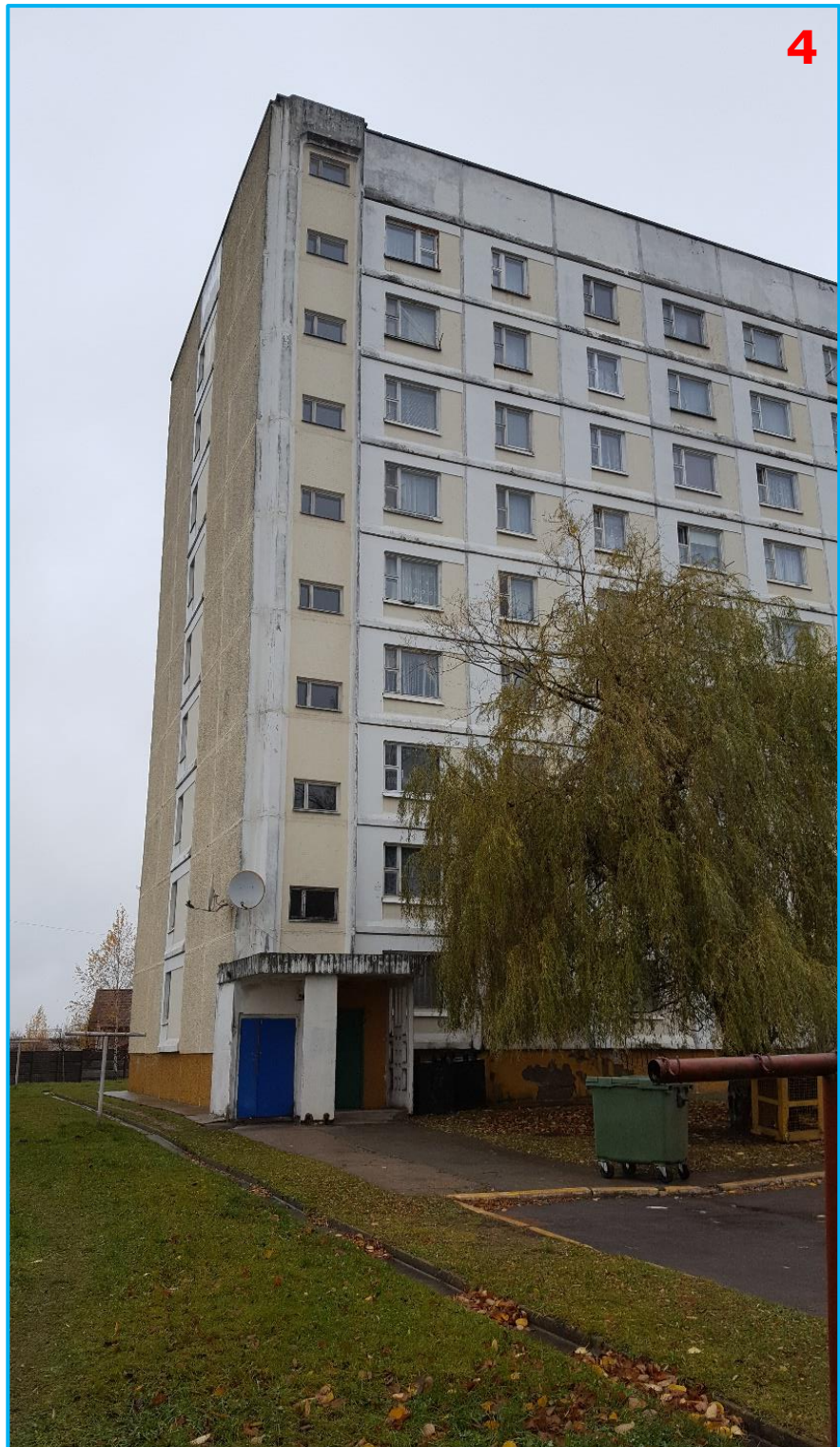
Photo 22. Shabany residential area along the boundary of the MWWTP sanitary protection zone: 1 - Rotmistrova and Shabany streets crossing; 2 - multi-storey apartment building at 11 Shabany str.; 3 - Shabany health and spa centre; 4 - Residential Hotel No. 5 operated at 16 Shabany str. by Health Department of the Minsk Municipal Executive Committee