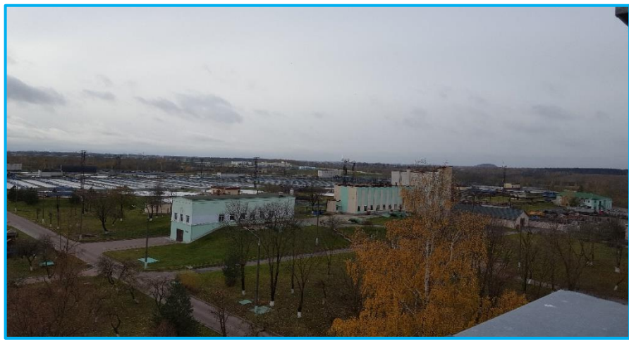
Photo 1. General view of the Section 1, Minsk Wastewater Treatment Plant area (MWWTP-1)