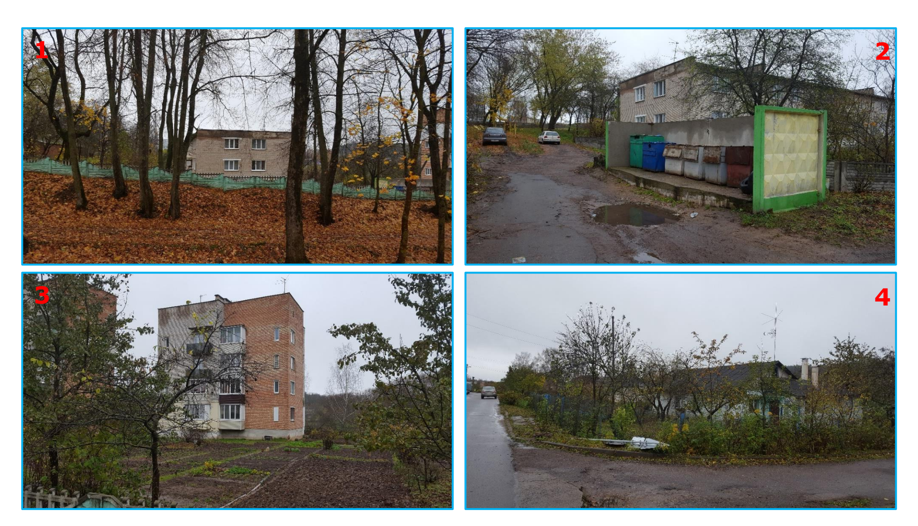
Photo 20. Middle- and low-rise residential area of Novy Dvor settlement, 950-1000 m to the south of MWWTP: 1 - a view from the Parkovaya street; 2 - entrance zone with a trash enclosure; 3 - an apartment building surrounded by private gardens; 4 - single-family houses with backyards and gardens