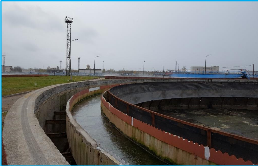
Photo 6. Primary sedimentation tanks (MWWTP-1), both operating (left) and being under maintenance