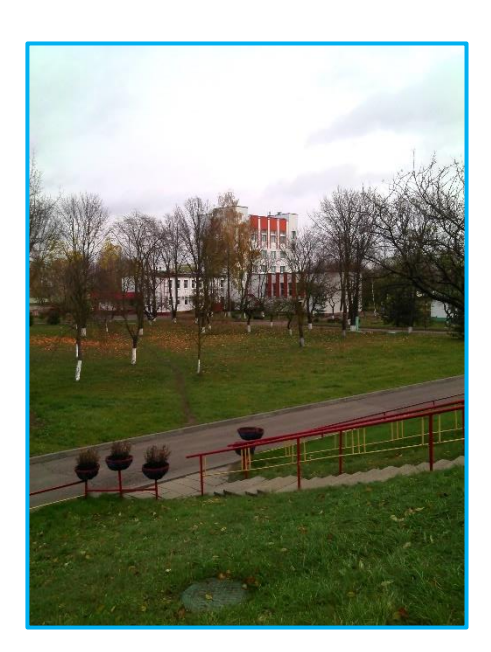
Photo 2. A view of the main administrative building across a vegetated area of the MWWTP-1