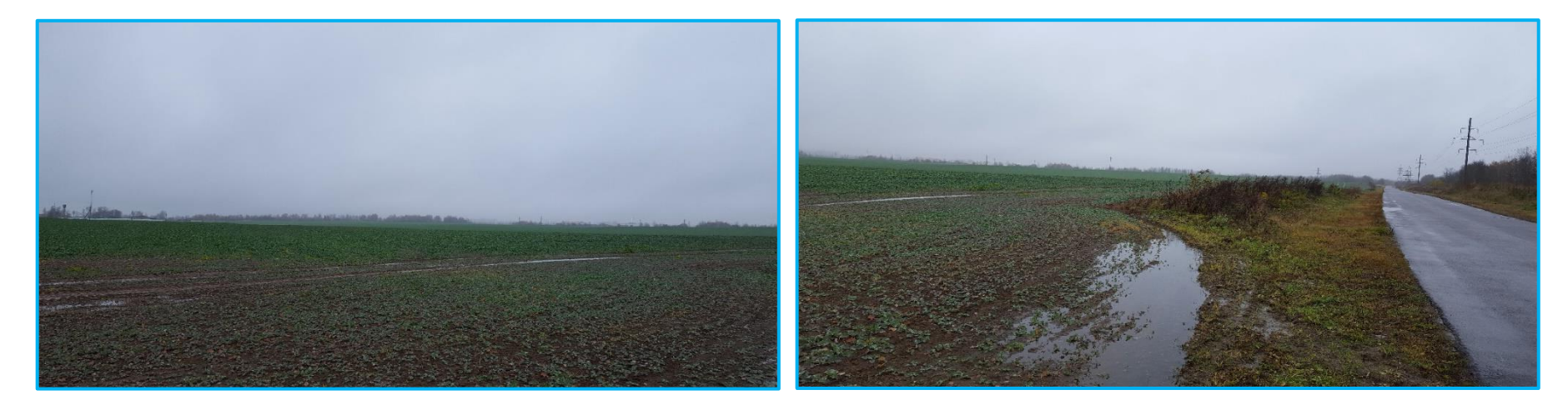
Photo 18. Adjacent property to the south-west, a cropland within SPZ¹ operated by Zhdanovichi agricultural company (a view facing north-west from the southern corner of the cropland)