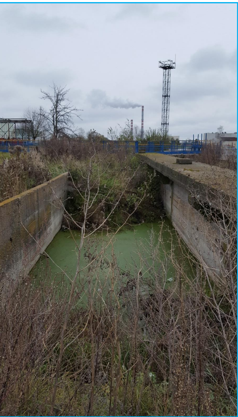
Photo 5. Open wastewater channels, both operating and decommissioned (right)