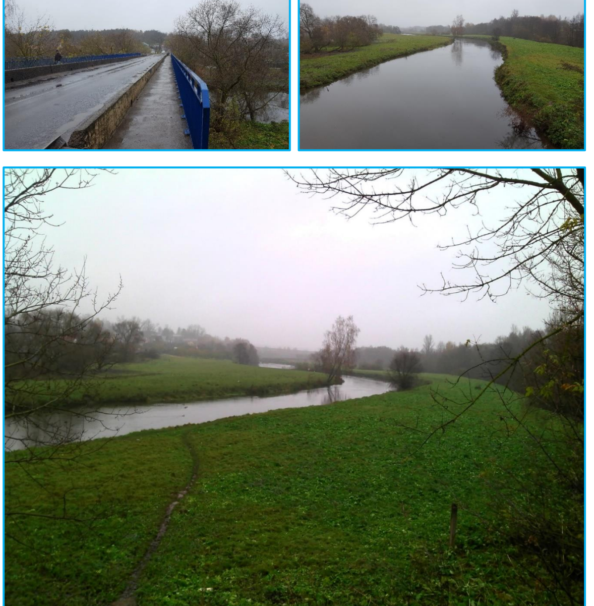
Photo 16. Svisloch river valley downstream the outflow of the MWWTP