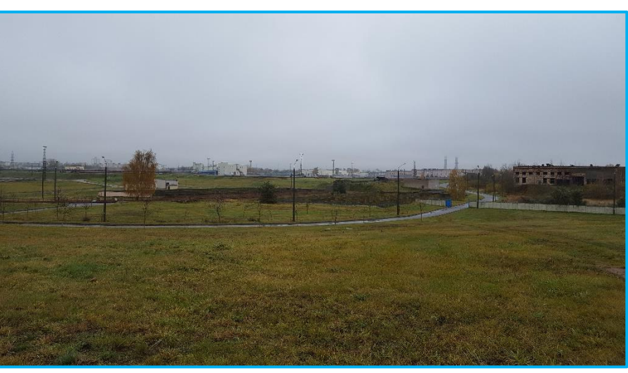
Photo 12. Section 2 of the MWWTP (clockwise): operating buildings and structures; recent earthworks area at a pipe break site; a subsurface utility area along the NE boundary of the property; general view of the WWTP-1 facility across the downslope lagoon