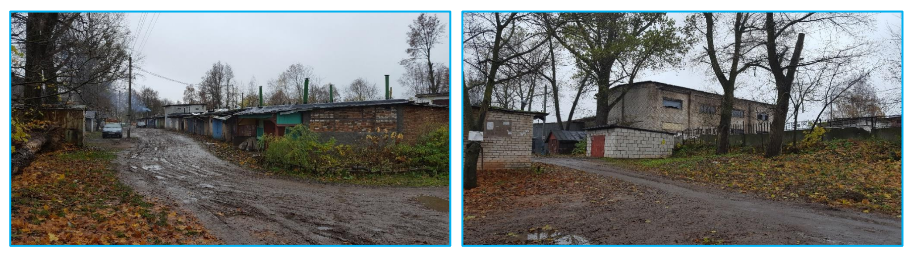
Photo 19. Southern part of the planned Shabany Industrial Hub: car sheds, garages and service stations along Parkovaya street, 800 to 900 m south of MWWTP territory