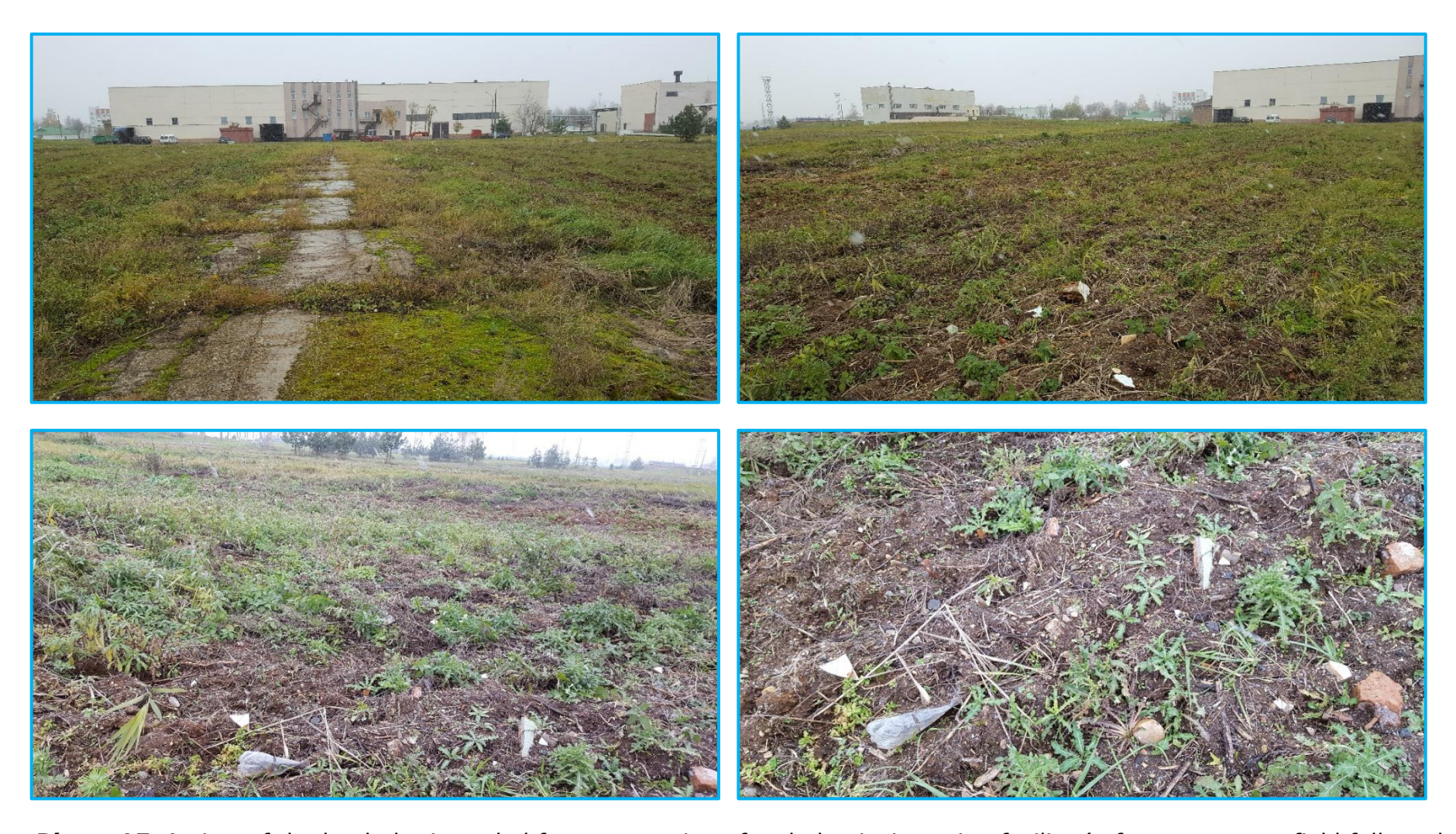
Photo 15. A view of the land plot intended for construction of a sludge incineration facility (a former sewage field followed by the MWWTP-1 sludge dewatering facility building on the background of the upper photos)