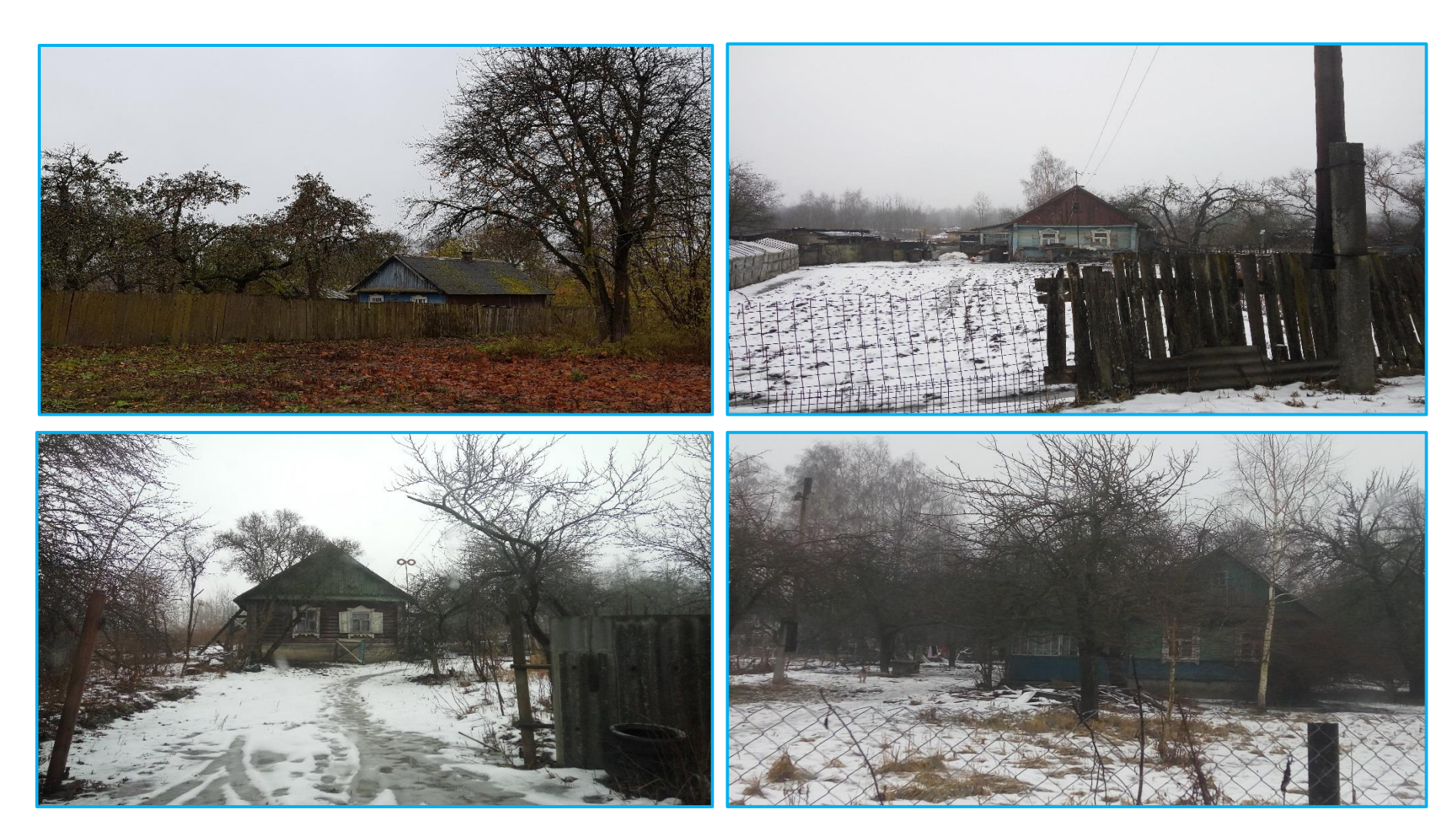
Photo 17. An undestroyed house of a relocated village within or near the boundary of sanitary protection buffer zone of the MWWTP