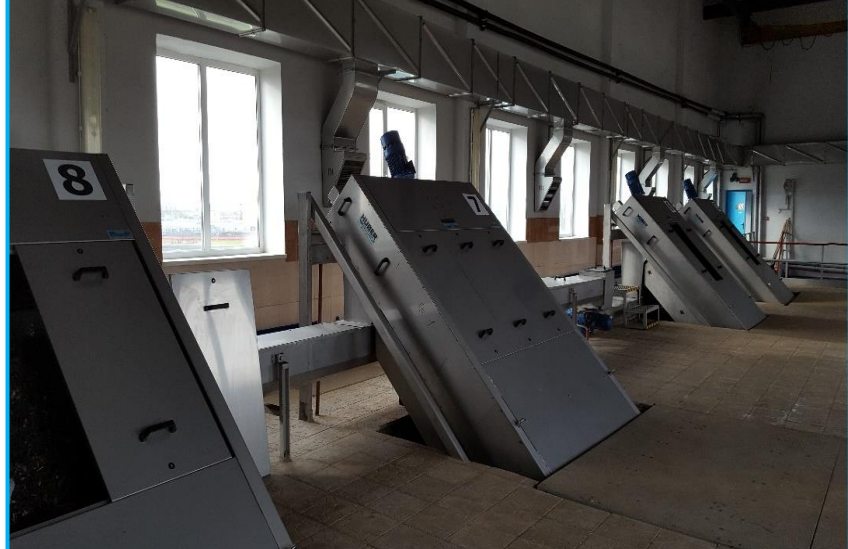
Photo 3. An exterior and interior view of a screening chamber building (MWWTP-1)