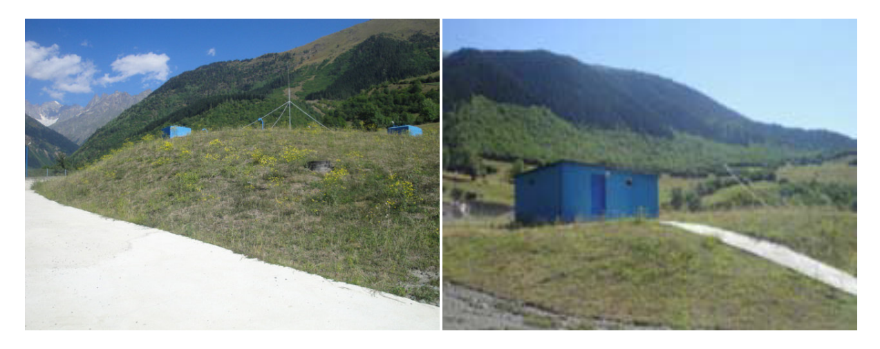
Figures 21 and 22:Reservoir territory

35. Restoration works have been performed well on the reservoir territory (Figures 21and 22).