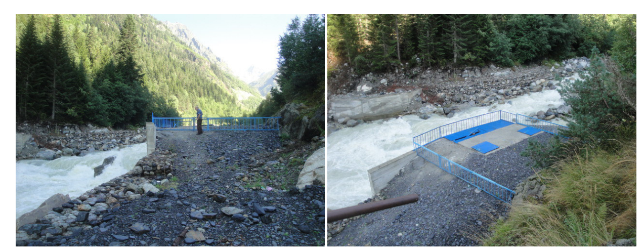
Figures 5, 6:Tyrolean Weir in Mestiachala River

24.Recovery works have been performed to a satisfactory level, the traces of construction waste could not be observed anywhere at the construction site, neither inert waste, nor municipal waste.