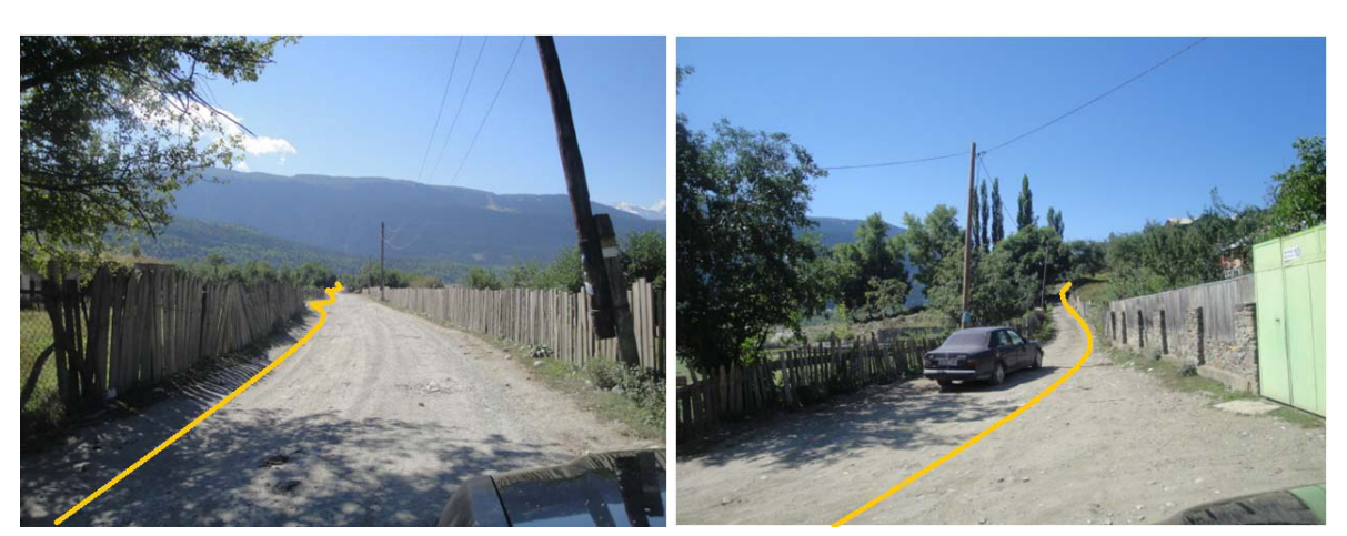
Figures 23, 24:Restoration works performed in settled areas