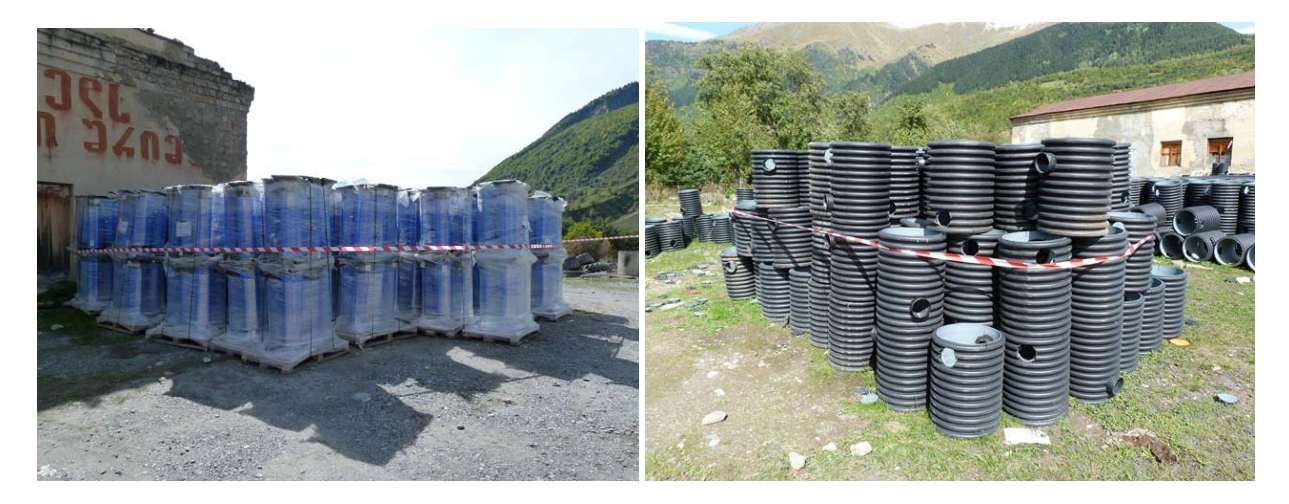
Figures 31 and 32: Storage area