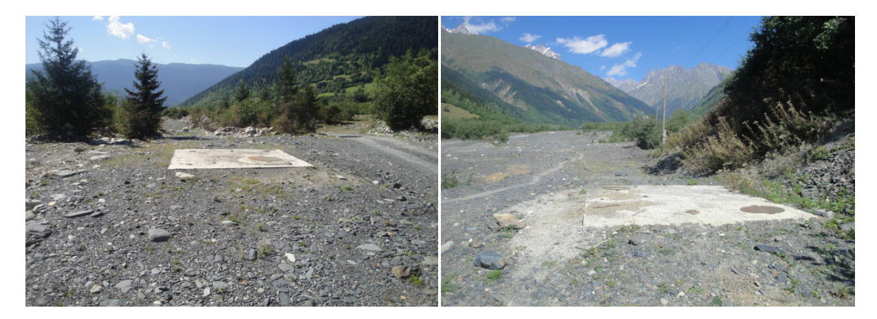
Figures 13 and 14: Restored landscape on the territories adjacent to the wells

28. No photos of the said territory were taken before the onset of the construction. Therefore, it is impossible to fix the adequacy of the restoration works to the pre-construction state. However, following the situation on the adjacent territories, we may conclude that the Restoration works on the territory adjacent to the wells have been performed to different degrees, predominantly to the satisfactory level( Figures 13 and 14 ).