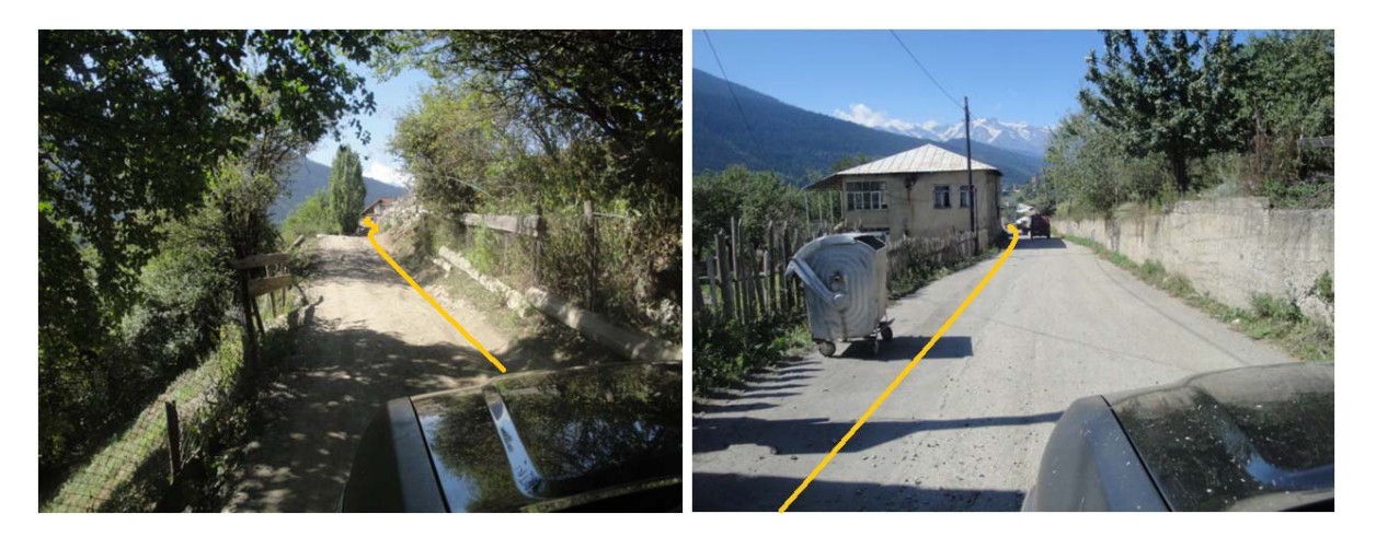
Figures 25, 26:Restoration works performed in settled areas

39. The pipeline crosses River Mestiachala riverbed on the territory of the existing crossing bridge via an open method. The pipeline flows along the existing bridge ( Figure 25 and 26 ).