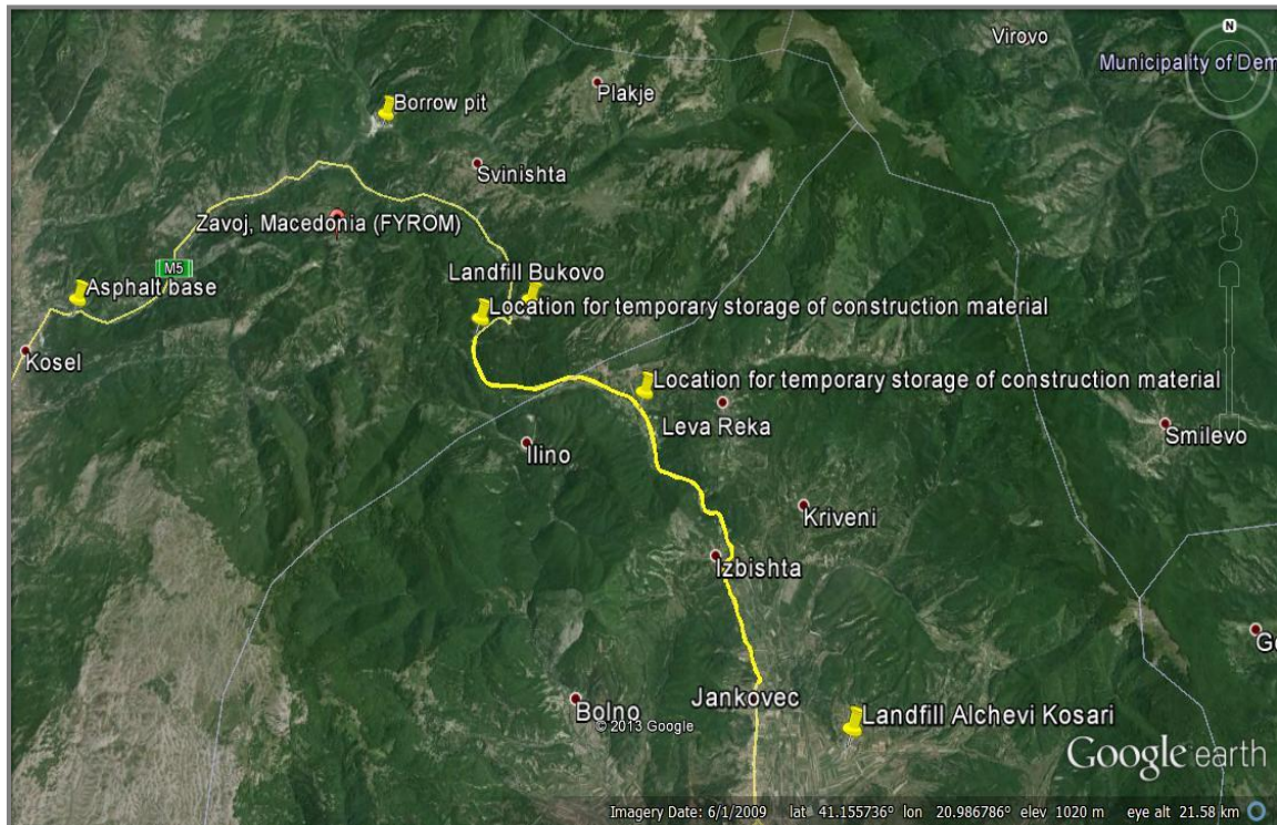
Figure 3 Proposed locations of borrow pit, asphalt base, landfill and location for temporary storage of construction material