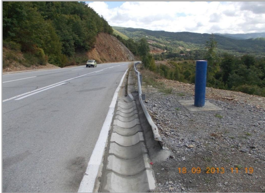
Figure 2 Damages of the pavement construction

The existing pavement is in unsatisfactory condition with damages. On the pavement there are different damages, such as longitudinal and transverse cracks, pot holes, block cracklings, rutting, deflections of the pavement and other damages are visible.