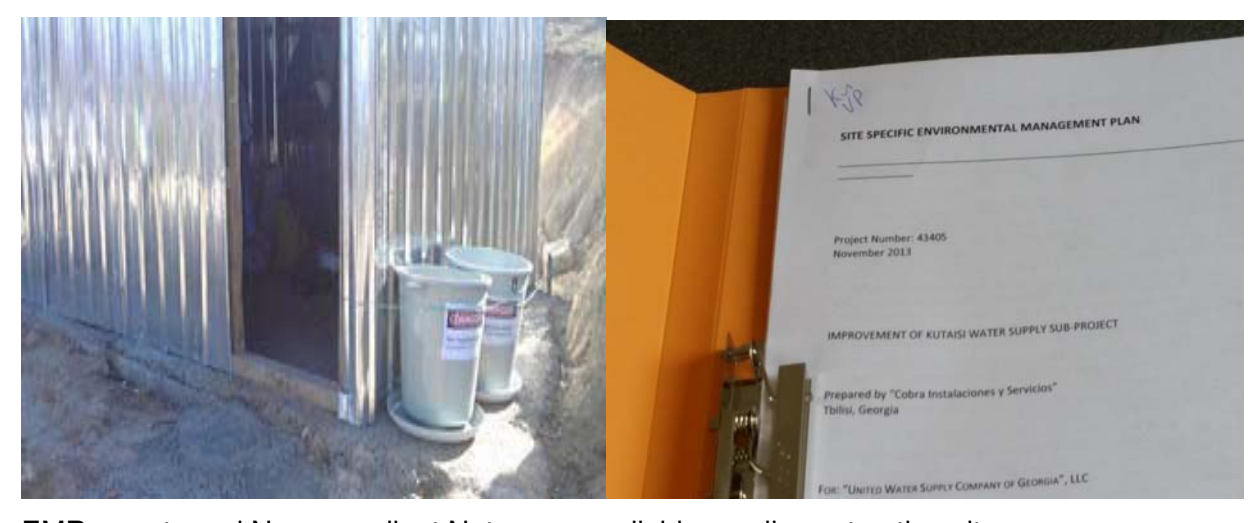
EMR reports and Non-compliant Notes are available on all construction sites Kutaisi TV Tower