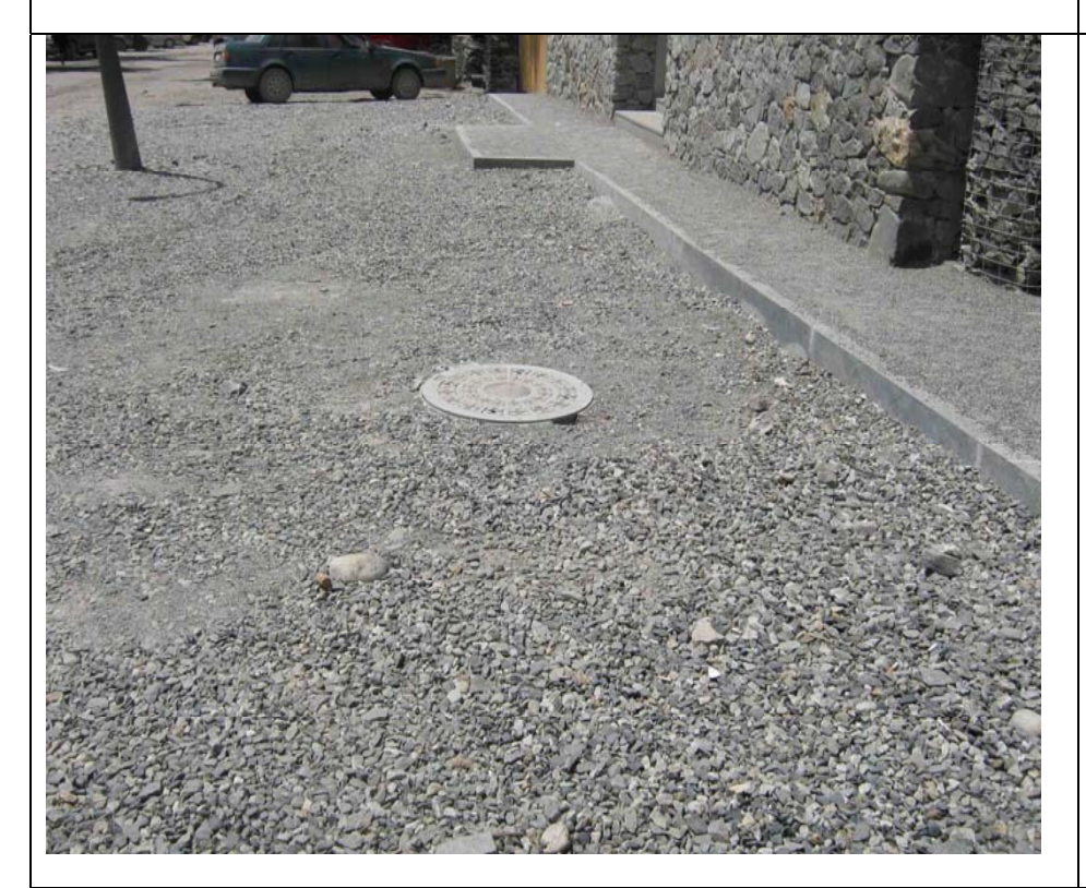
Site after reinstatement.

Construction of Mestia Headworks – Project Area