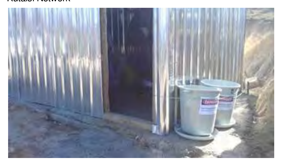
Kutaisi TV Tower