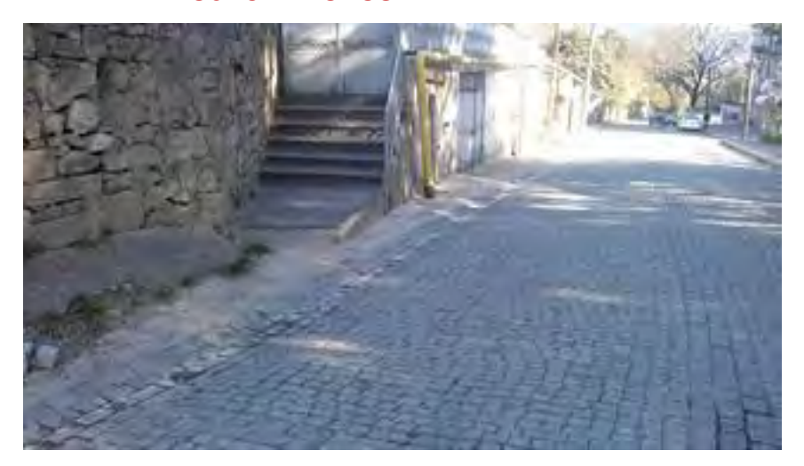
Kutaisi network after reinstatement