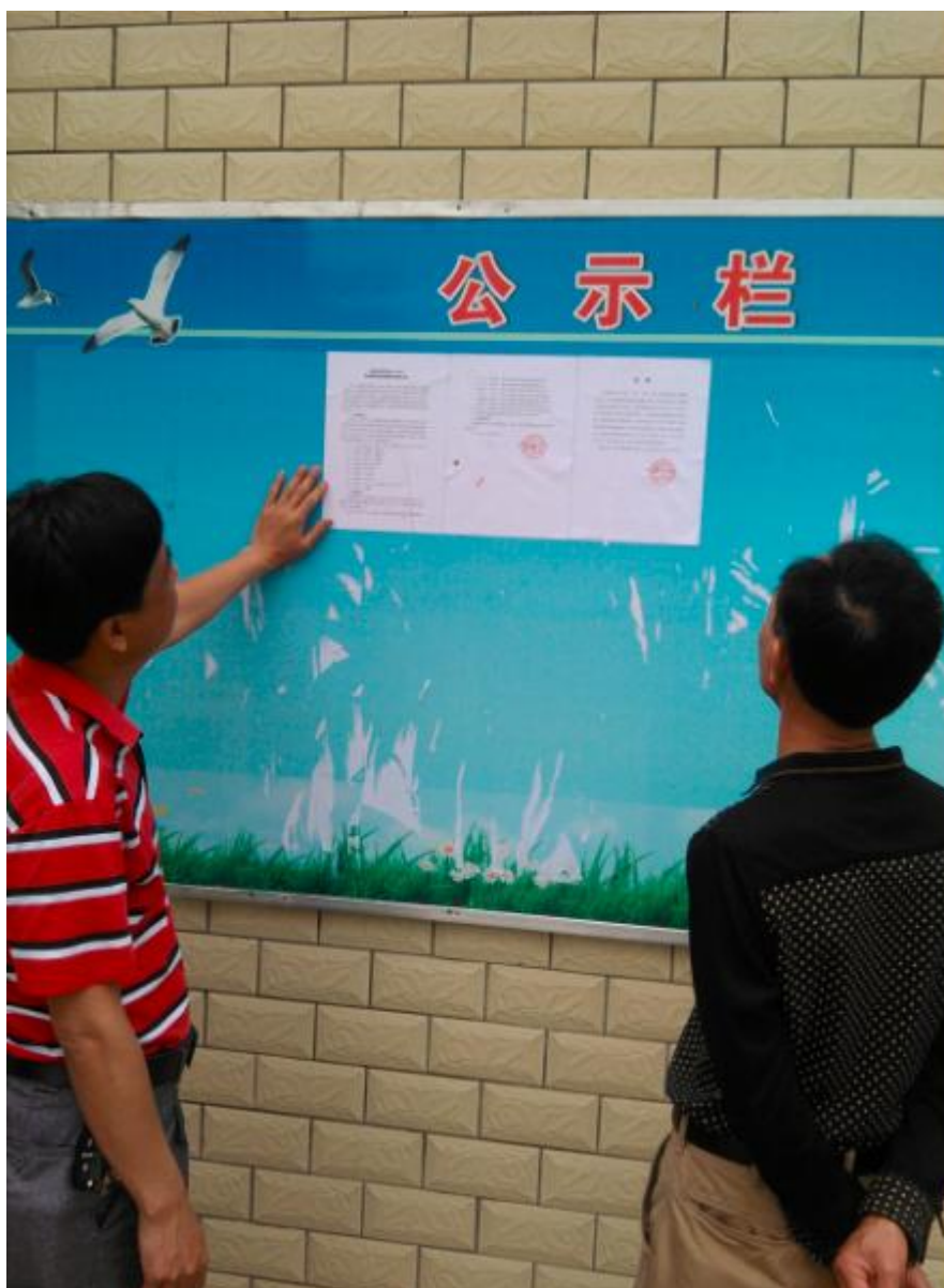
Picture (Annex) 2-2 The publish of temporary settlement framework of Bazai township central primary school in Wengyuan county