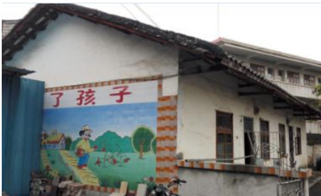
Figure2-2 External housing structure of the affected people in Jiangwei Town central primary school