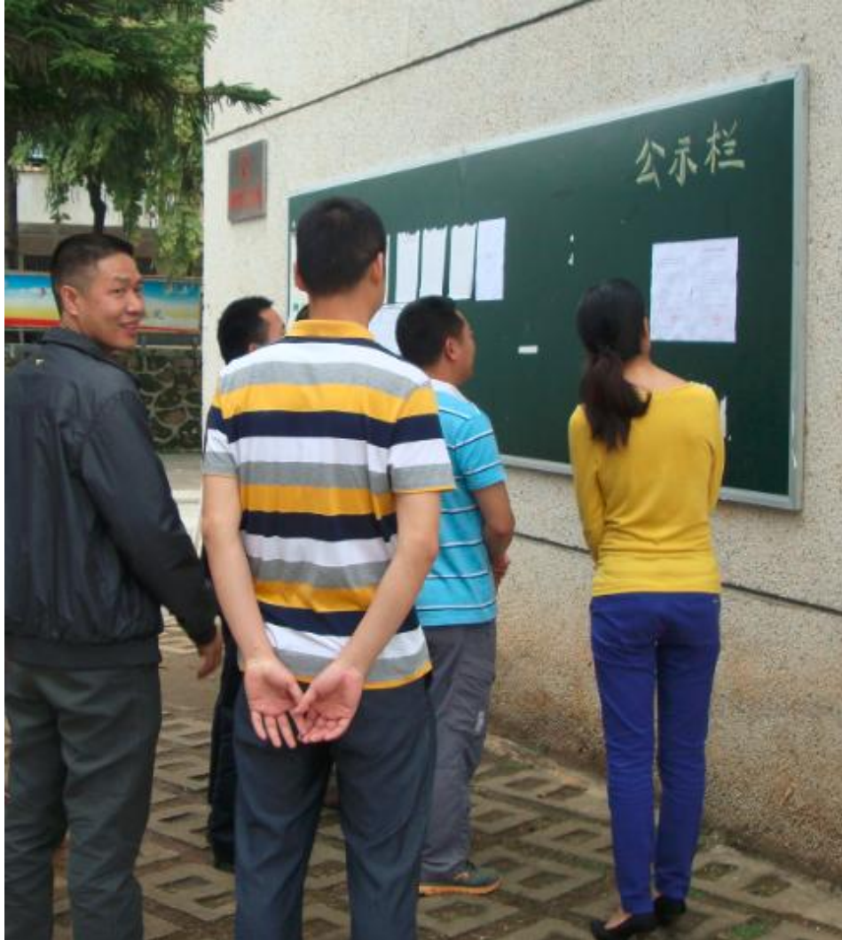
Picture (Annex) 2-1 The publish of temporary settlement framework of Jiangwei township central primary school in Wengyuan county