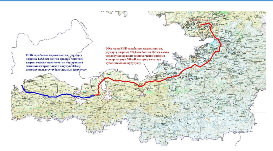
Blue: TW05; Red: TW06-L2

9. Overall progress of implementation under the two EPC contracts reached as of today in the Kyrgyz Republic is satisfactory, however increased prices for goods and transportation due to the pandemic, the exchange rate fluctuations between XDR and USD and economic crisis are impacting contract costs, creating significant budget deficit which, if not resolved, will cause implementation delays. The Project facilities in the Kyrgyz Republic are constructed through two contract packages (TW05 and TW06 – Lot 2) by one Contractor. The total length of the TL is about 456 km (126.4 km under TW05; and 329.56 km under TW06-L2) with a total number of 1243 towers planned to be erected. Progress to date is shown in the table below.