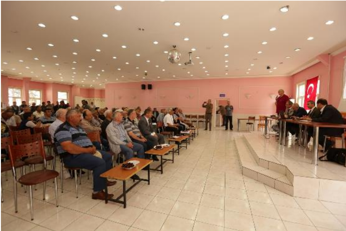
Photo 1. Atabey DSİ Presentation

A public consultation meeting was held in Atabey-Isparta on June 20, 2018 in order to introduce ESMF, LARPF and Atabey ESMP and receive the comments of people (Photos 1 and 2). The meeting was held with the participation of WUA members, irrigation employees, workers and local people where at a total of 120 participants with 6 women were present. The minutes of the meeting and the participant list is given in Annex 3 and 4. The attendees from DSİ's side included Regional Deputy Manager, Project and Civil Department Manager, Operation and Maintenance Department Manager, DSİ General Directorate Property and Expropriation Head of Department, Survey and Assessment Department Manager and Topographical Engineer, while Atabey WUA Chief and Manager have attended from WUAs side. DSİ together with WUA's presentation included information on the project in general as well as its advantages for the farmers, technical details of the project, financial sources and land acquisition and consolidation studies. It was also pointed out that all the works will be implemented in environmental friendly means. In addition, technical details of the site-specific work to be undertaken for Atabey were shared with participants. The attendees asked technical details on the land consolidation practices as well as their requests on acceleration of the consolidation activities.