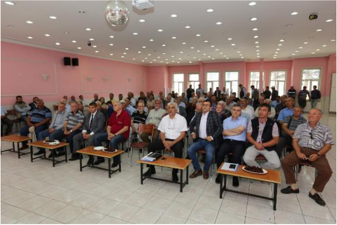
Photo 2. Atabey Public Consultation Meeting