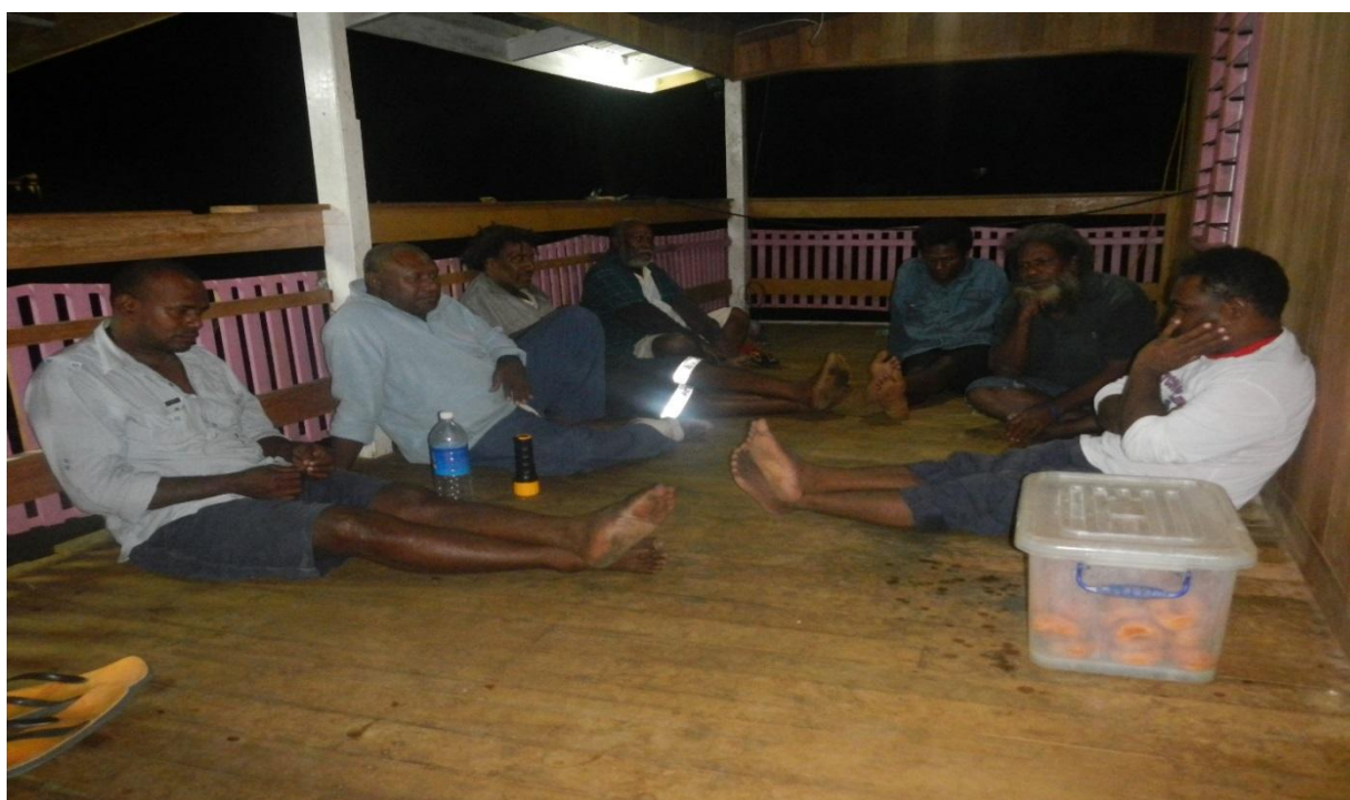
Solomon Power consultation meeting with Hauhui Chiefs in Afio