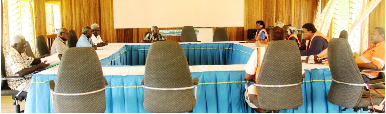
Meeting with Provincial Executives