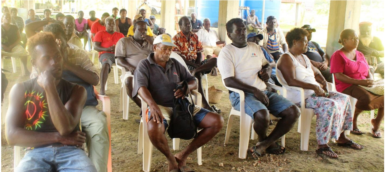
Consultation meeting in Seghe