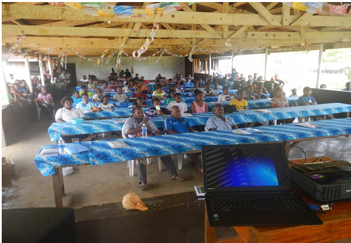
Solomon Power presentation in Rokera School – Afio