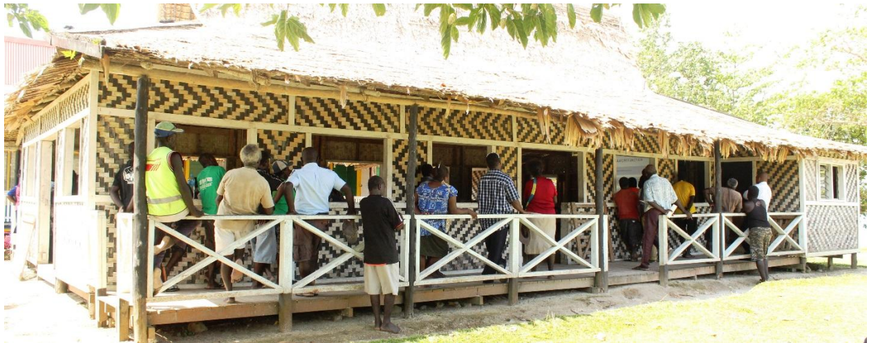
Taro meeting house