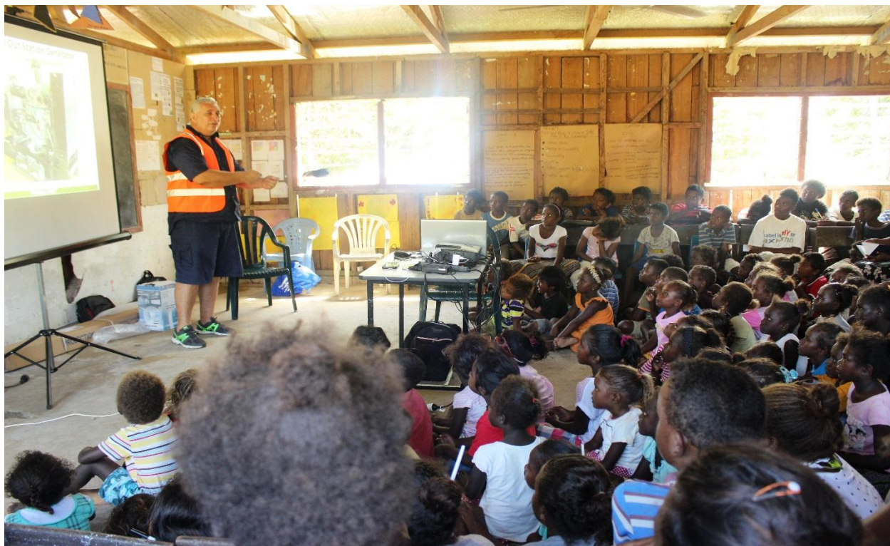
Solomon Power presentation in Seghe at school on safety of electricity