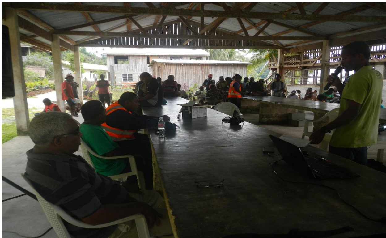
Consultation meeting in Afio