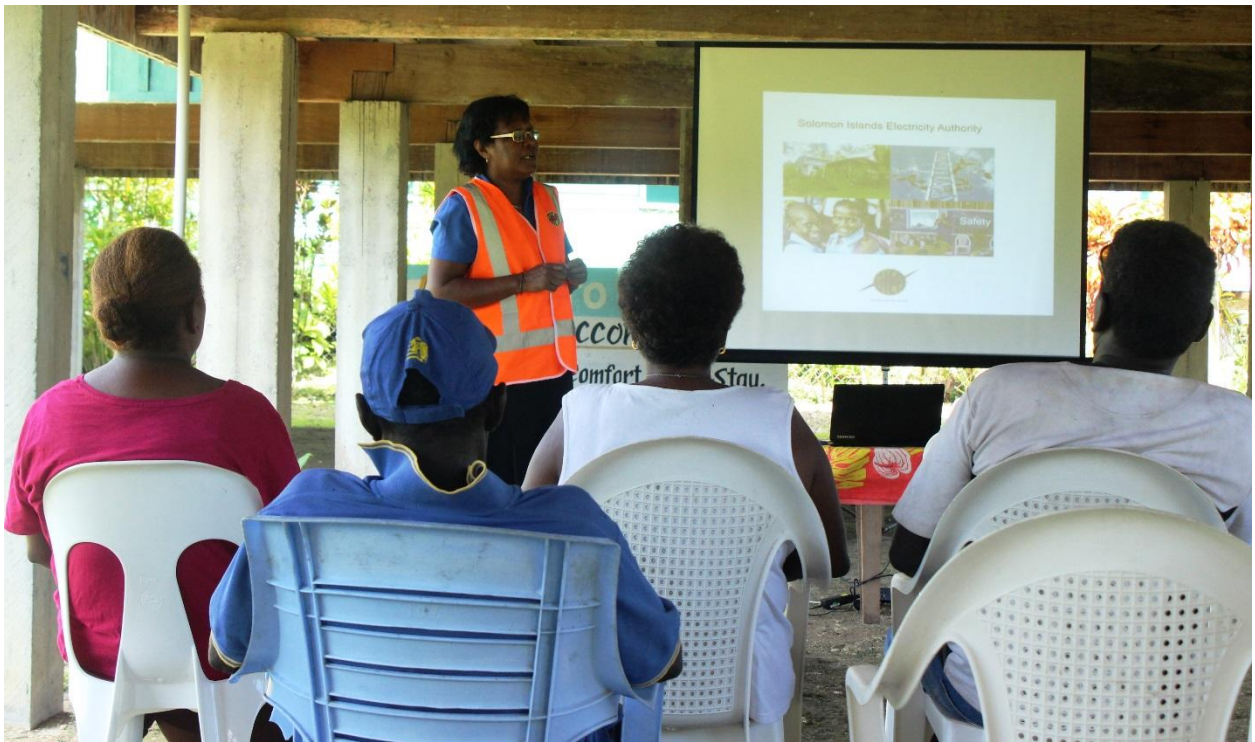
Solomon Power presentation in Seghe