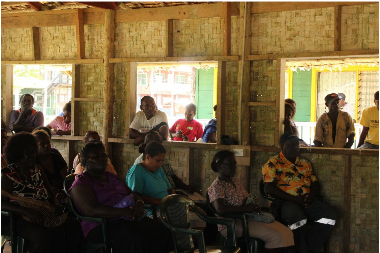
Consultation meeting with community in Taro