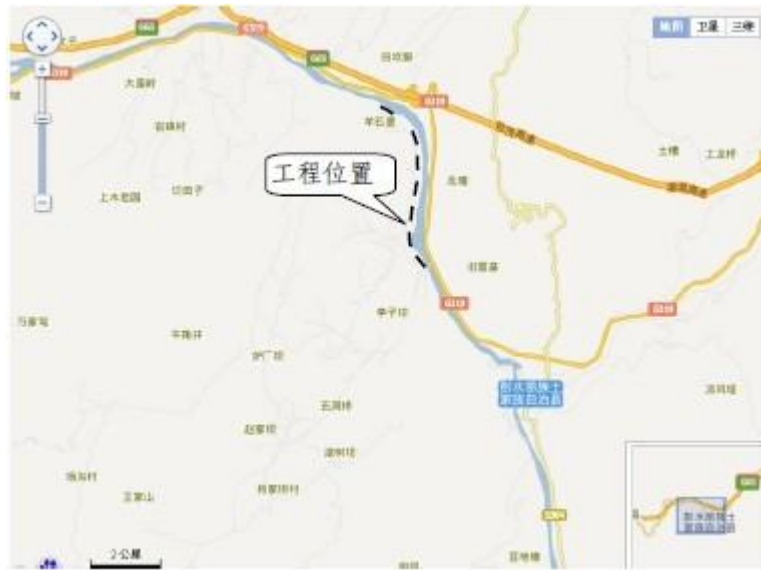
Figure 1-1 Location Map of the Subproject

8 According to the construction schedule, the construction period will be 22 months.