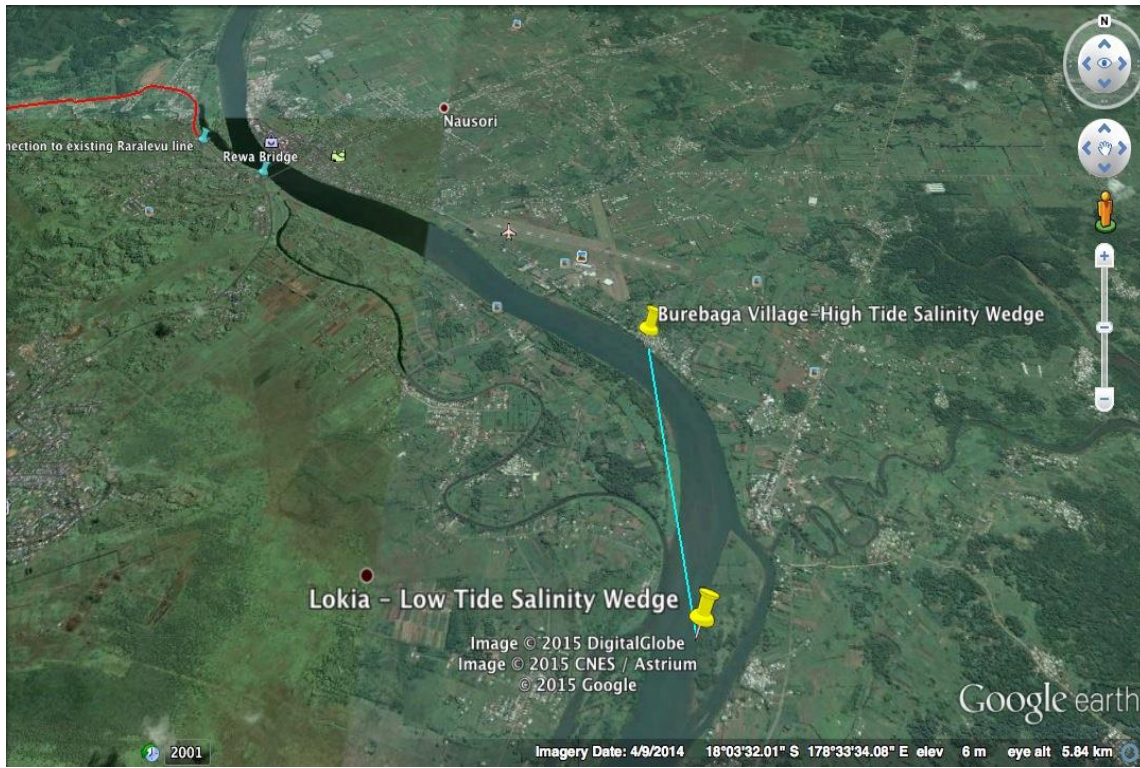
Figure 4.2. Rewa River showing results of NWQL salt water sampling