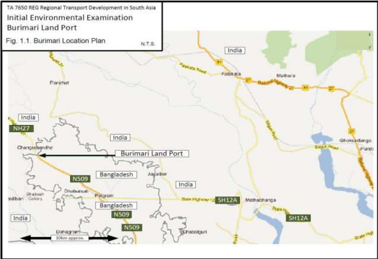
Figure 3: Burimari Land Port