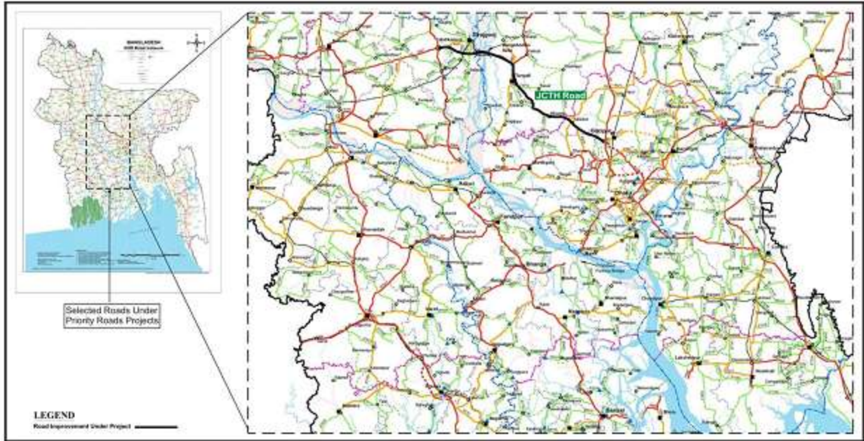
Figure 1: JCTE Road Location Map