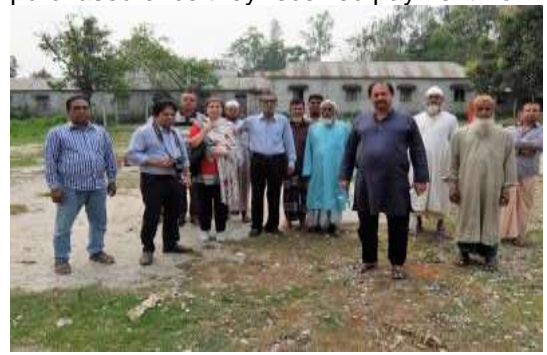
Left picture: Proposed location of the new mosque that will be constructed in Hatubanga, Gorai, Gazipur (around 1 km from the road and existing mosque).

The Government Community Committee called WAQHFD claimed that they have control over the property (mosque) and the payment for the resettlement compensation should be paid to WAQHFD Committee and not to the Mosque Committee. The Deputy Commissioner's Office of Gazipur has still to settle the issue, and a meeting was set on the last week of March 2017 to settle the issue. Once the issue on ownership has been settled, the RHD through the CCDB will pay the compensation for the affected mosque/ structure (replacement cost). The Mosque Committee has already identified the location of the mosque (a private lot) which will be purchased once they received payment from the DC and CCDB.