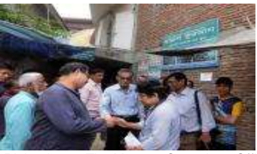
Right picture: The Mosque Committee Officers with the Project Implementation Consultant's Resettlement Specialist (18 March 2017)