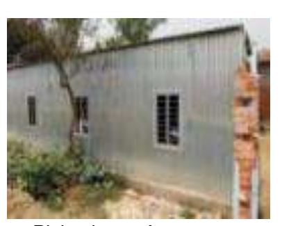
Right picture: A temporary school made of galvanized iron sheets has been constructed, while the concrete school building in not yet finished

8. Telirchala Dakkin Para Jame Mosque Located in LAP - 2. The mosque is partially affected by the road project. The Mosque Committee has already received the compensation for the affected structure. The affected area of the mosque will just be repaired/ improved and will remain on the same location (outside the RoW).