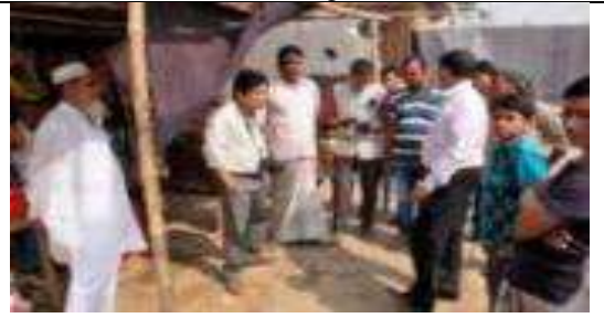
Left picture: The national resettlement specialist and CCDB staff conducting consultation with the affected persons in Work Package -02.

Left picture: Partly affected residential unit affected by the project (TH). Right picture: Part of the shop/residential unit demolished/ affected by the project. In the pictures above are the DDC consultant, resettlement specialist and the CCDB field organizer/ coordinator. Pictures taken on March 16, 2017 during the site visit in selected project areas along the SASEC road project.