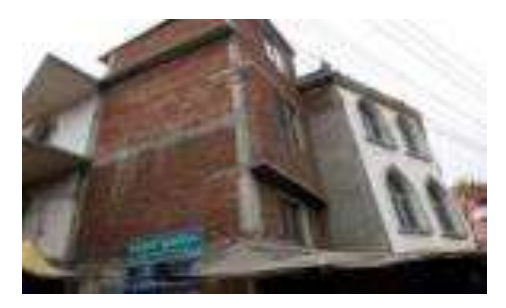
Left picture: The existing mosque which has a pending issue on ownership located in Hatubanga, Gorai, Tangail district

building and construct a new mosque in another location within the same community, less than 1.0 km from the road and existing location of the mosque. There is an issue as regards to the ownership of the land where the mosque is located. The Mosque Committee mentioned that they have the legal documents to prove that it was constructed on a private property. The lot is owned by the father of one of the officers of the Mosque Committee. However, the Government Community Committee called WAQHFD also claimed ownership of the land where the mosque is constructed, and they said they have control over the property (mosque) thus, payment for resettlement entitlements should be paid to WAQHFD Committee and not to the Mosque Committee (Vogra Junction Mosque Commitee). The Deputy Commissioner's Office of Tangail district has still to settle the issue, and a meeting was set on the last week of March 2017. Once the issue on ownership has been settled, the DC will pay for the land and the RHD through the INGO CCDB will pay the compensation for the affected mosque/ structure (replacement cost). The Mosque Committee has already indentified the location of the mosque (a private lot) which will be purchased once they received payment from the DC and CCDB. See pictures below for additional information.