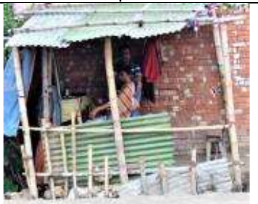
Left picture: A NTH wearing green shirt (grocery shop constructed on the RoW demolished last year). He already received payment for the affected structure which he used to increase capital for his grocery store business (located along the existing road but outside the RoW).

Middle picture: A NTH in stripes white shirt being interviewed by the PIC resettlement specialists and the CCDB staff. He used the amount received for compensation of the demolished shop constructed on the RoW for his business (restaurant/ grocery shop located along the existing road but outside the RoW).