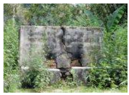
Right Picture: The Burner was retained to mitigate resettlement impacts (located on RHD land). Picture taken on March 18, 2017):

3. Jamurky Graveyard LAP-6: with 183 graves belonging to Non-titled Holders was relocated to a private land after the AHs have received the payment. The process went smoothly after extensive consultations with affected grave owners. The Graveyard Committee Officers have expressed that they need help for the processing of the registration of the lot (new graveyard). One of the graves belongs to a national hero whose remains were already transferred to the new location, with a ritual (see picture below in the middle). There were no other complaints from the APs, and they have expressed gratitude for the payment made by the RHD through CCDB.