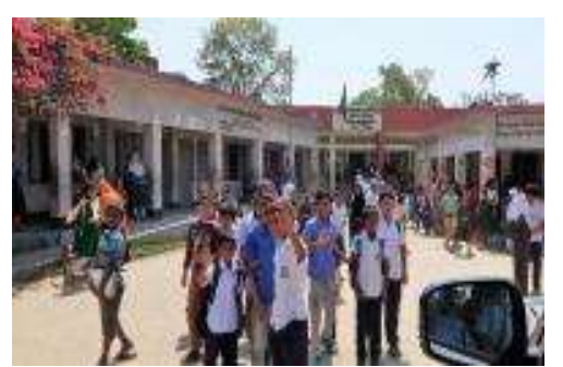
Left picture: The Government Primary School that will be affected by the road project.