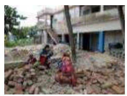
Left picture: The international social resettlement specialist interviewing the female worker in the school affected by the road project last Aug. 2016).

7. The Mirdewhata Jonab Ali High School (a 2-storey concrete building) in LAP – 4 located on government land is affected. The school management committee expressed that they are happy and satisfied with the compensation costs/ value of the affected structures they received and will be able to construct a new 4-storey concrete secondary school, as the concrete fence (boundary wall) and part of the school that was demolished last year (affected by the project) was already old. The school management committee hired local people including women in reconstruction civil works (i.e., breaking stones, bricks, clearing, etc.). The students were also given regular orientation on road safety by the teachers, and their plan is to construct a concrete fence as soon as possible to ensure the safety of the students. A temporary school made of galvanized iron sheets has been constructed in the meantime, which also serves as a boundary fences/ wall for the safety of the students. Shown below are pictures of the Mirdewhata Jonab Ali High School during the site visit on 18 March 2017