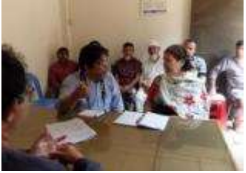
Right picture: Consultation with the Mosque Committee Officers in Gorai, Gazipur by the PIC's resettlement specialists and CCDB field coordinator on 18 March 2017.

2. Chandra Junction Mosque and Market located in LAP -2 with 24 Shops within the two-storey concrete building constructed on the government land (RHD). The mosque will be relocated to a government land (RHD) few meters from the existing location of the mosque and along the road. The proposed mosque will be bigger (3-storey concrete building). The groundbreaking ceremony led by the Minister of the Ministry of religion and Culture and attended by the RHD officers and staff, Project Implementation Consultants for SASEC I Road Connectivity Project, and local people was held on 16 March 2017 (see pictures below).