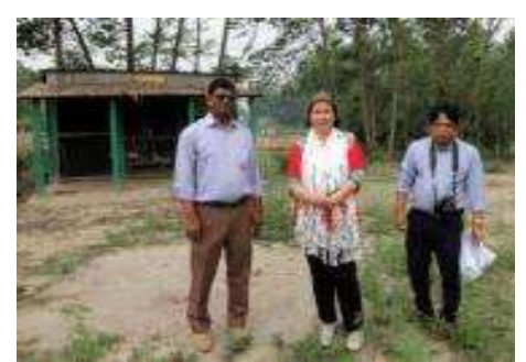
Left: The Hindu Graveyard (Mirdewhata Cremation Center), NTH in LAP 4.