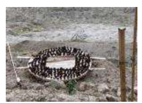
Left: The new graveyard (previously located on RHD property, within the ROW).

3. Jamurky Graveyard LAP-6: with 183 graves belonging to Non-titled Holders was relocated to a private land after the AHs have received the payment. The process went smoothly after extensive consultations with affected grave owners. The Graveyard Committee Officers have expressed that they need help for the processing of the registration of the lot (new graveyard). One of the graves belongs to a national hero whose remains were already transferred to the new location, with a ritual (see picture below in the middle). There were no other complaints from the APs, and they have expressed gratitude for the payment made by the RHD through CCDB.