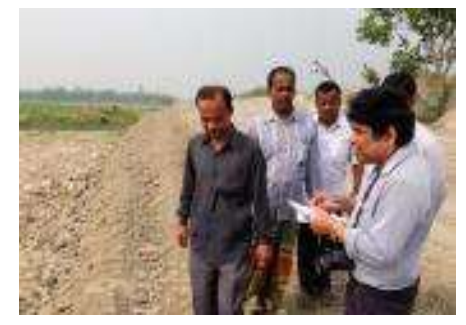
Right: The officers of Jamurky Graveyard Committee are having a meeting with the PIC resettlement specialists and CCDB

4. A multi-story building and a mosque (in LAP -4 Vogra Junction) will be partially affected by the road project located. The Mosque Committee Officers plan to demolish the