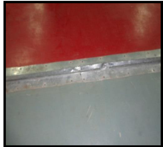
Observation No. 04