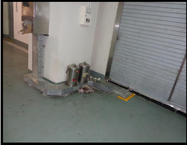
Observation No. 01