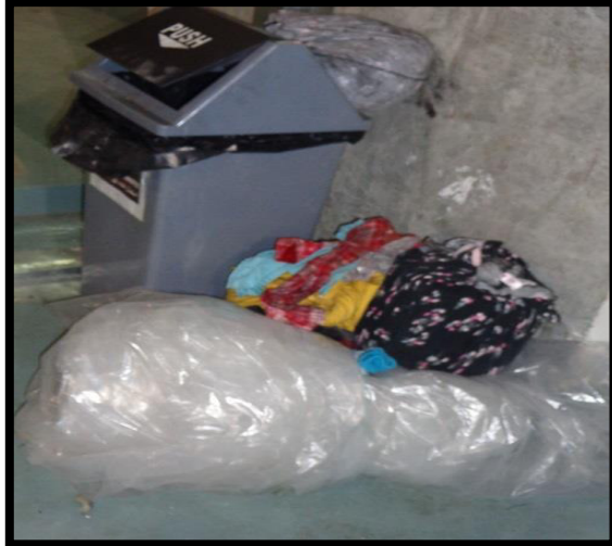
Observation No. 08