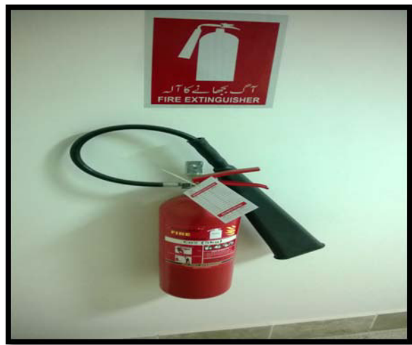
Observation No. 04