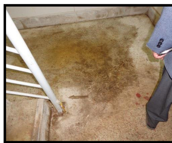
Observation No. 12