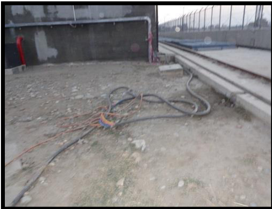
Observation No. 17