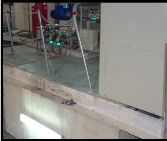
Observation No. 09