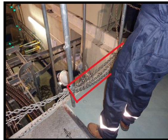
Observation No. 10