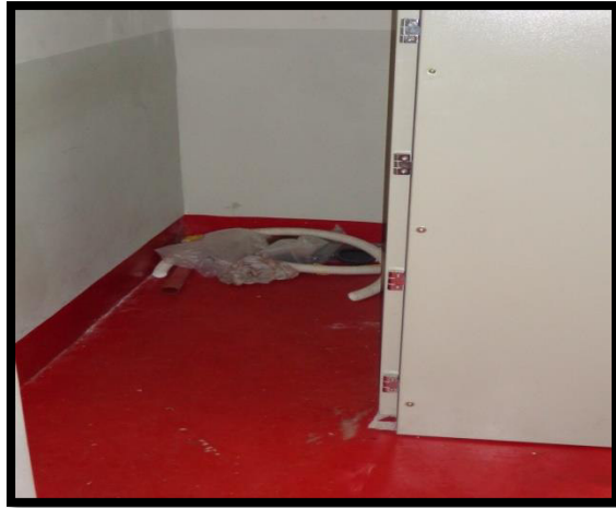
Observation No. 04