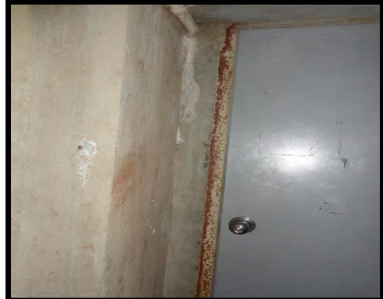
Observation No. 18