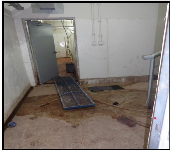
Observation No. 06