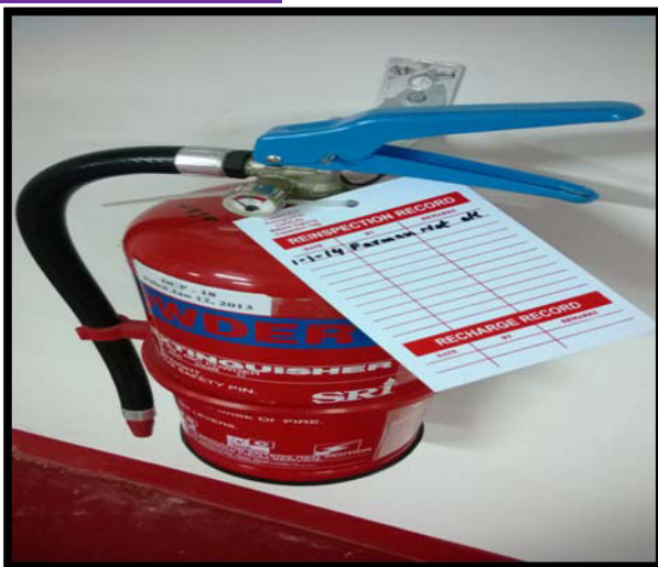
Observation No. 05