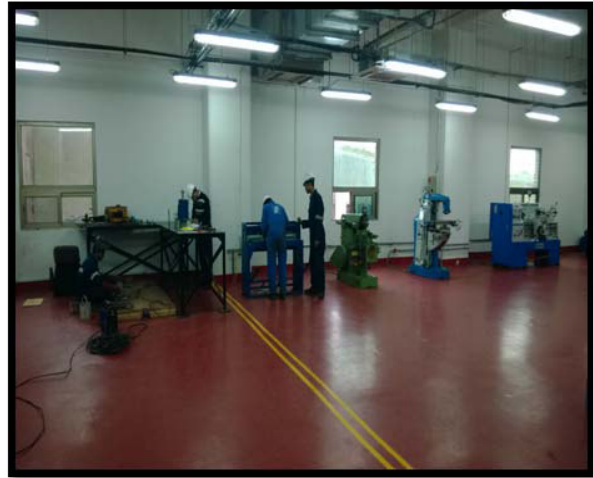
Observation No. 02