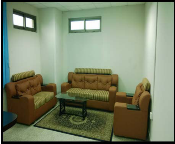
Observation No. 01