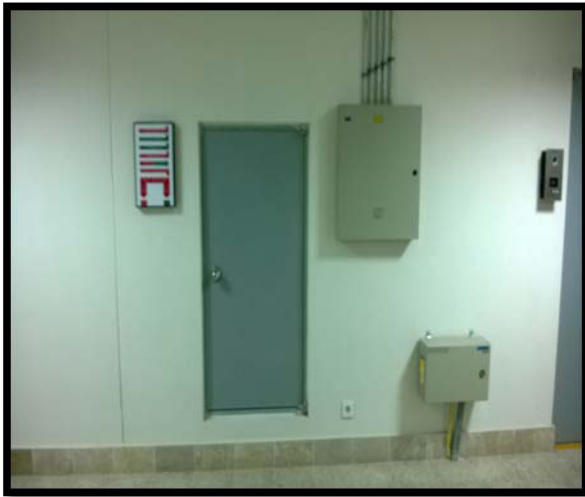
Observation No. 03