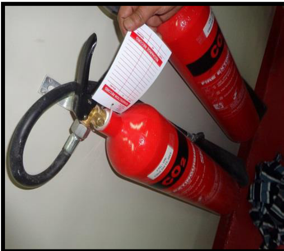
Observation No. 05