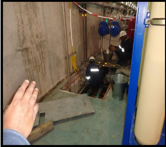
Observation No. 07