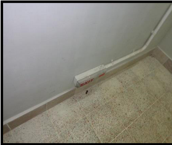
Observation No. 11