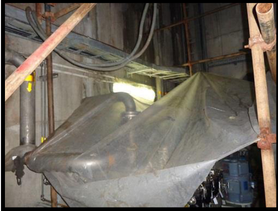
Observation No. 13