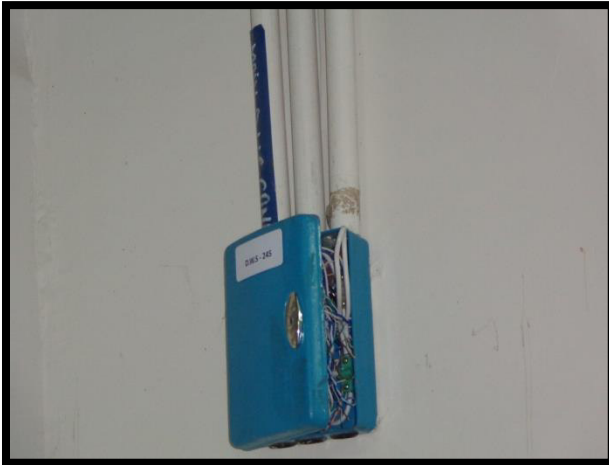
Observation No. 03