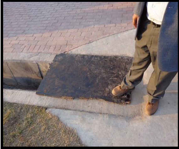
Observation No. 01