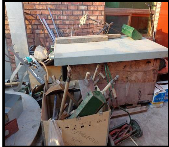
Observation No. 02