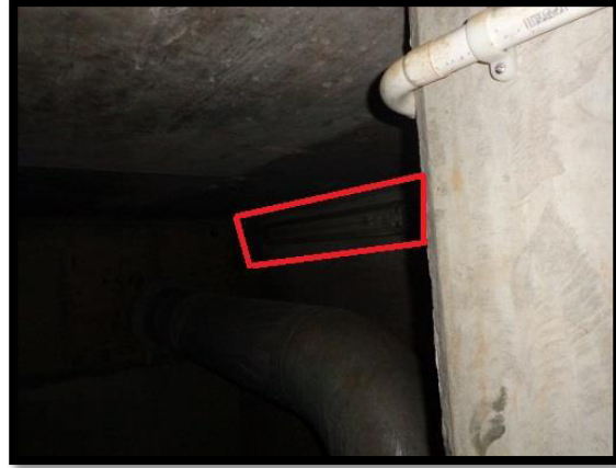
Observation No. 14