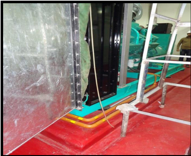
Observation No. 05