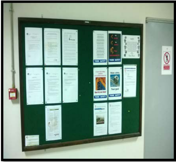
Observation No. 07