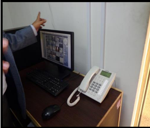
Observation No. 03