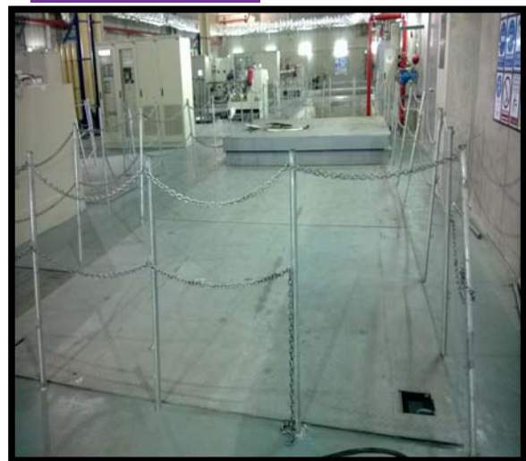
Observation No. 06