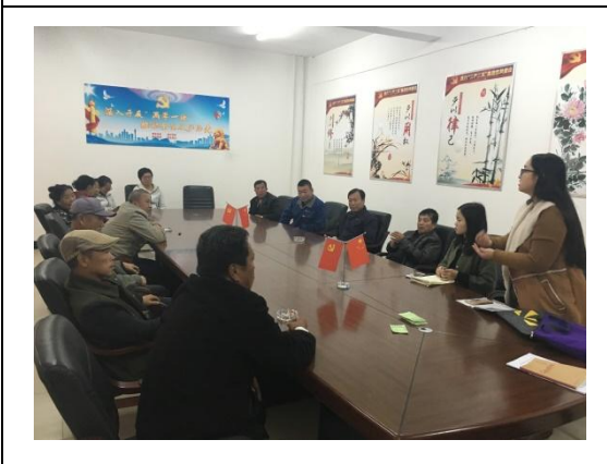
FGD in Sishui Community, Fushun