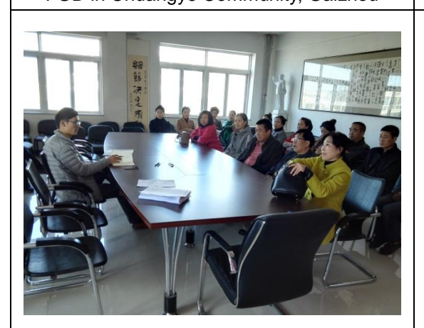
FGD in Shengli Community, Gaizhou