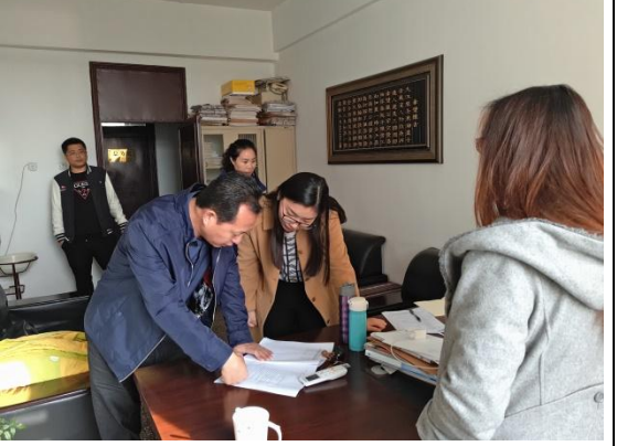
Interview at the Gaizhou Municipal Labor and Social Security Bureau