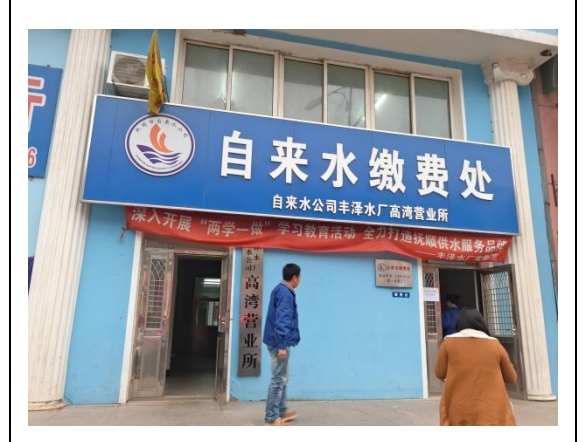
A water charge collection station in Fushun