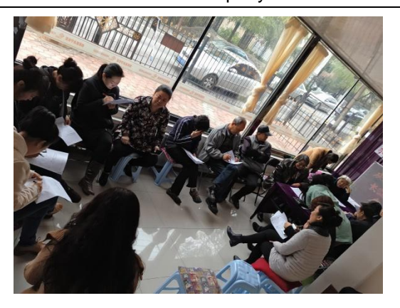
FGD in Yongning Community, Fushun