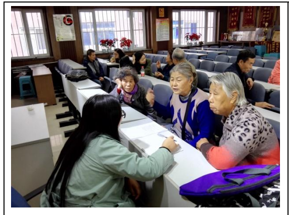
FGD in Shandongbao Community, Shenyang