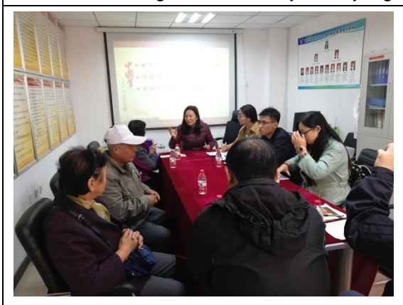
FGD in Heping New Village, Shenyang