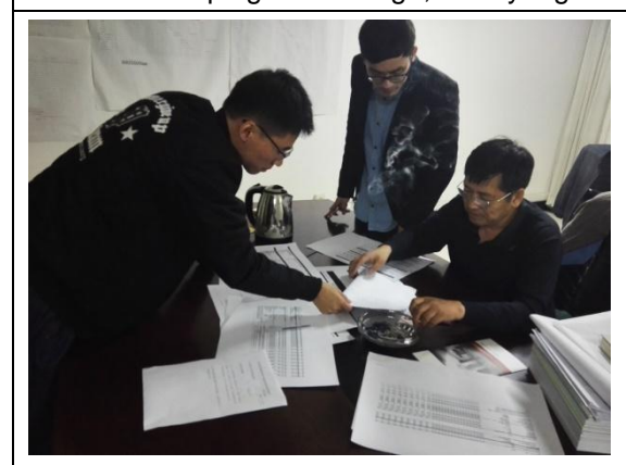
Interview at Anshan Water Company