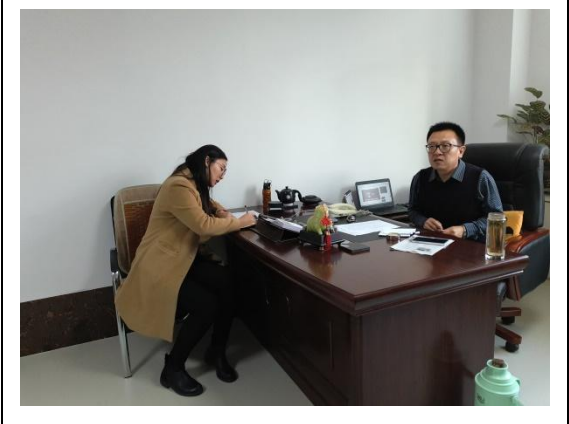
Interview at the test center of Fuxin Water Company