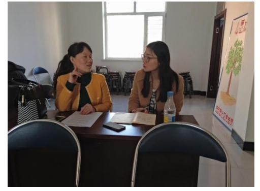
Interview with the secretary of Xiyi Community, Fuxin