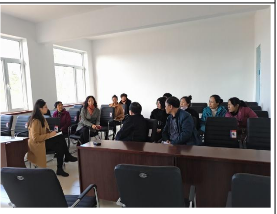
Interview in Xinglong Community, Gaizhou