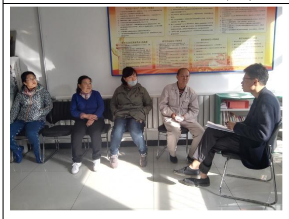
FGD in Shanzuizi Community, Anshan