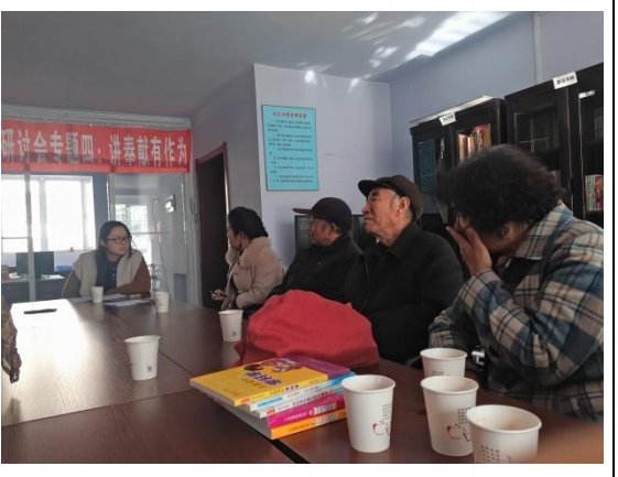
FGD in Chuangye Community, Fuxin