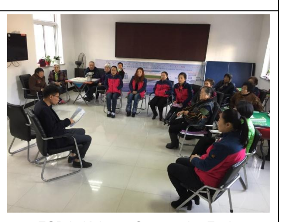
FGD in Kaiyuan Community, Fuxin