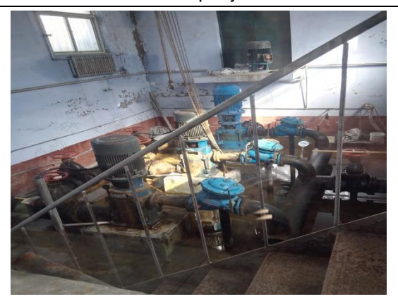
A secondary pump station in Fuxin