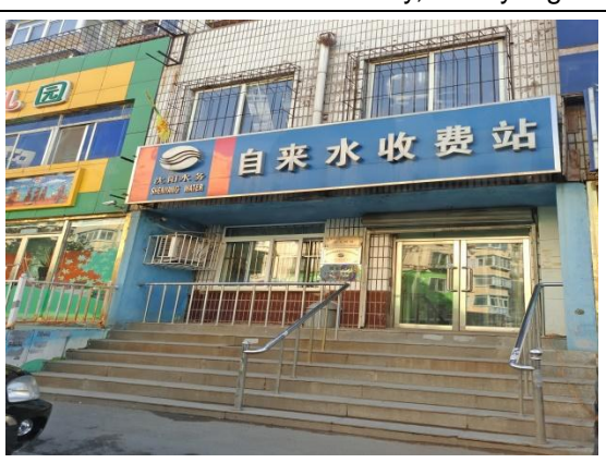
A water charge collection station in Shenyang