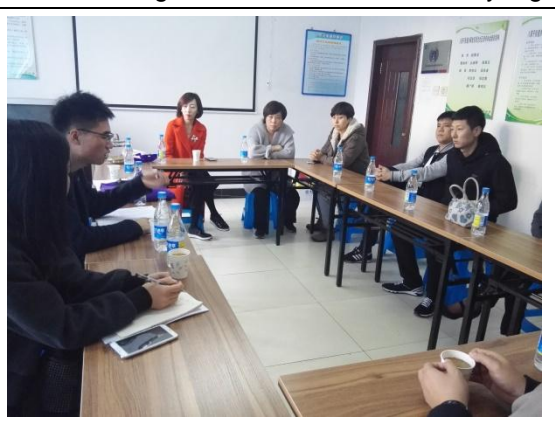
FGD in Bajiazi Community, Anshan