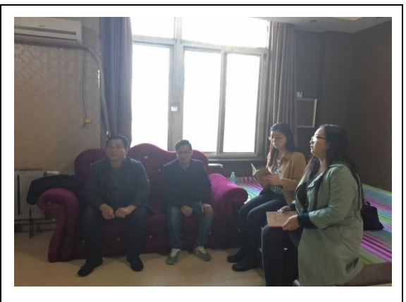
FGD in Changyingzi Village, Fuxin