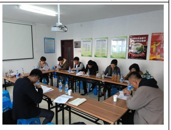
FGD in Dongminsheng Community, Anshan