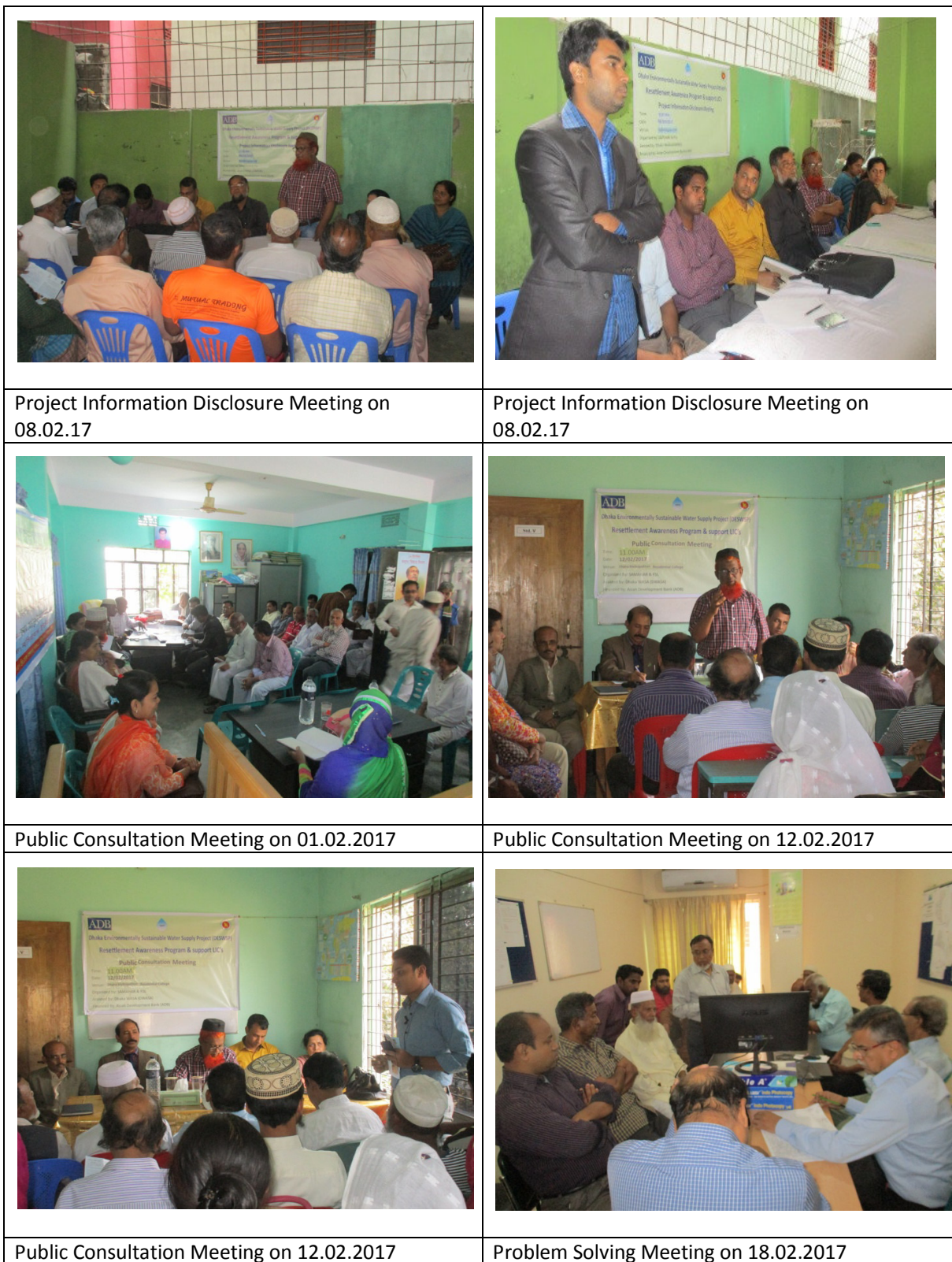
Photo Gallery on Activities at DMA – 605 for Resettlement Plan Preparation Procedure