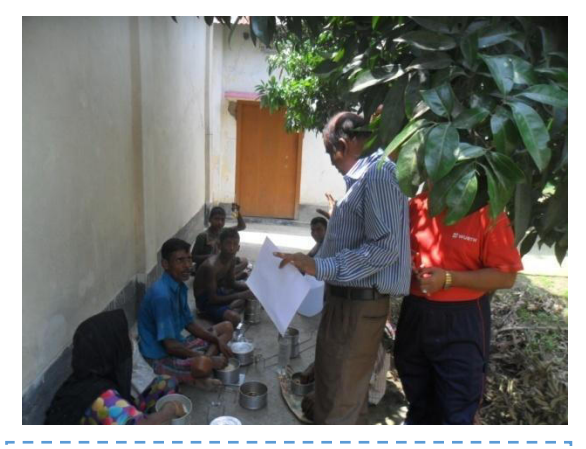
NRS & Xen of Joypurhat consult with Labors