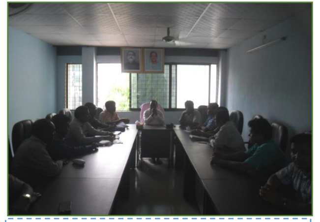
Consultation with mayor and other official of Muktagacha PS