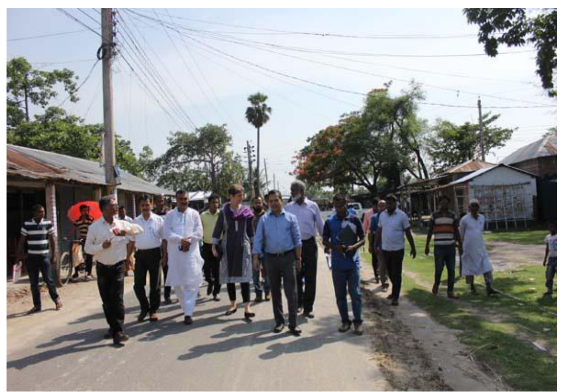
Bangladesh: Third Urban Governance and Infrastructure Improvement (Sector) Project ADB Loan 3142-BAN (SF)/1626P OFID

Period: January 2016- June 2016 Project Number: 39295