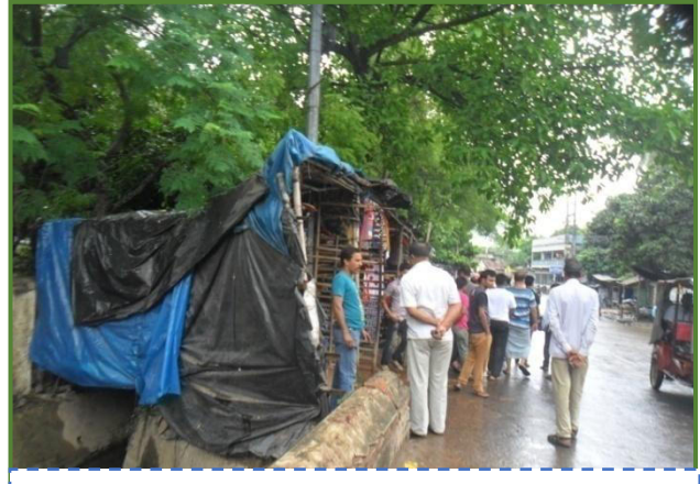
D4- Present condition of drain, Magura