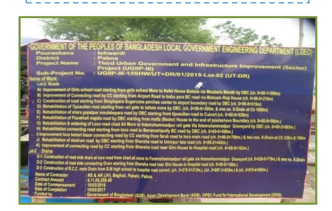
Signboard at construction site, Ishwardi