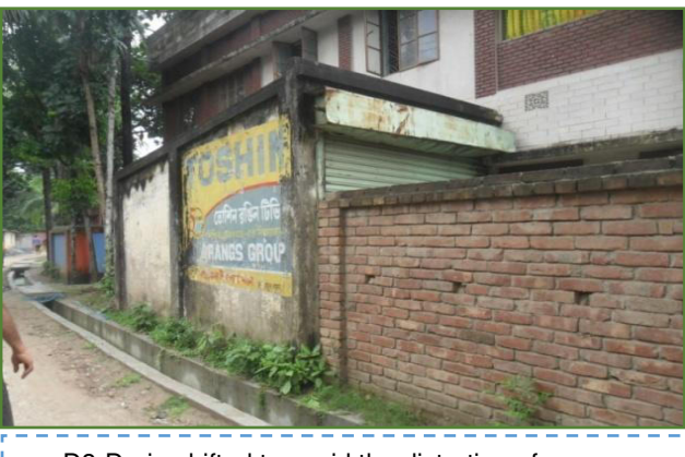
D8-Drain shifted to avoid the distortion of garage, Magura