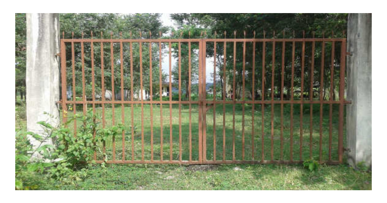
Figure 4 Chlorination unit