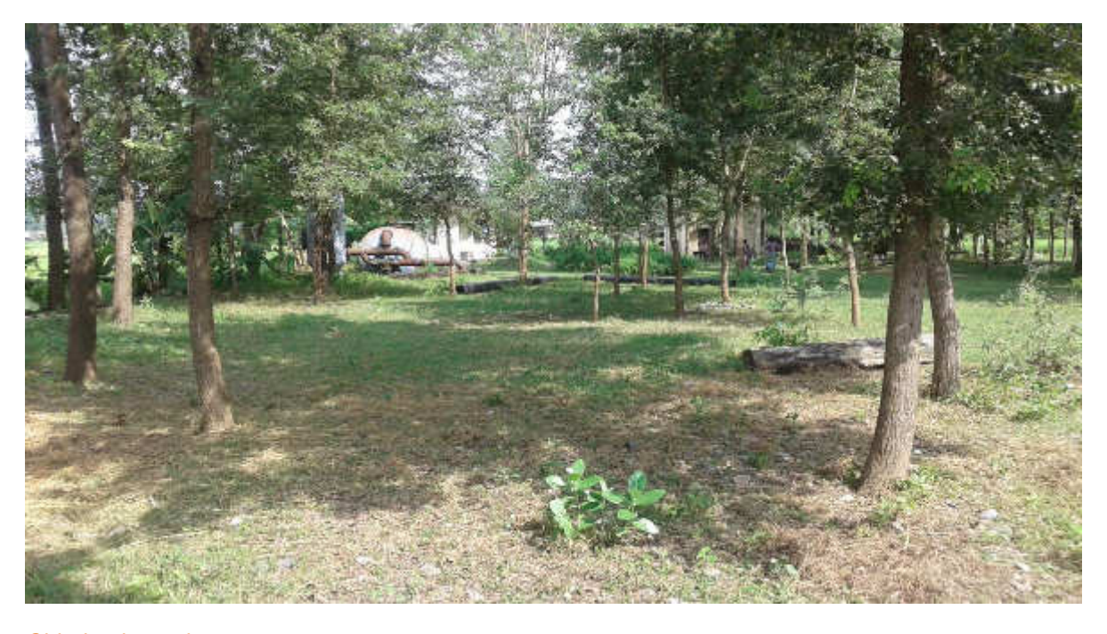
Figure 5. Chlorination unit