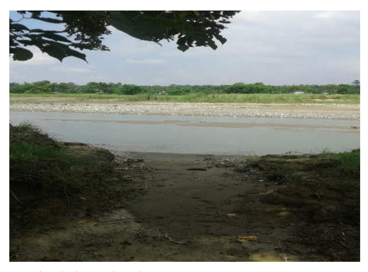
Figure 5- Luandra river crossing work