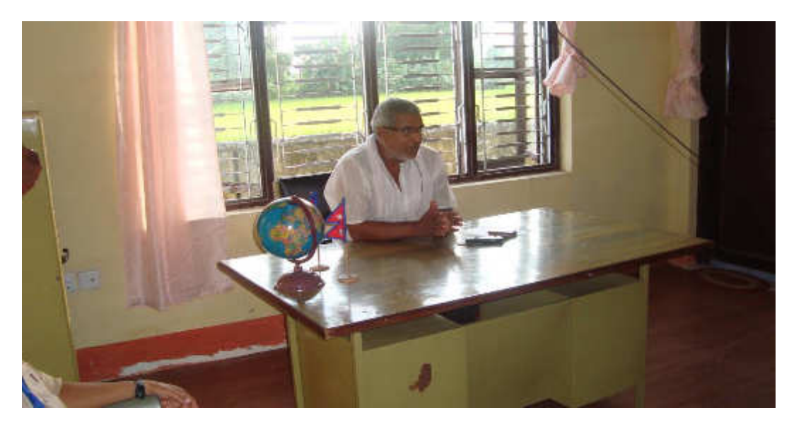
Figure 1 WUSC Chairman participate consultation meeting