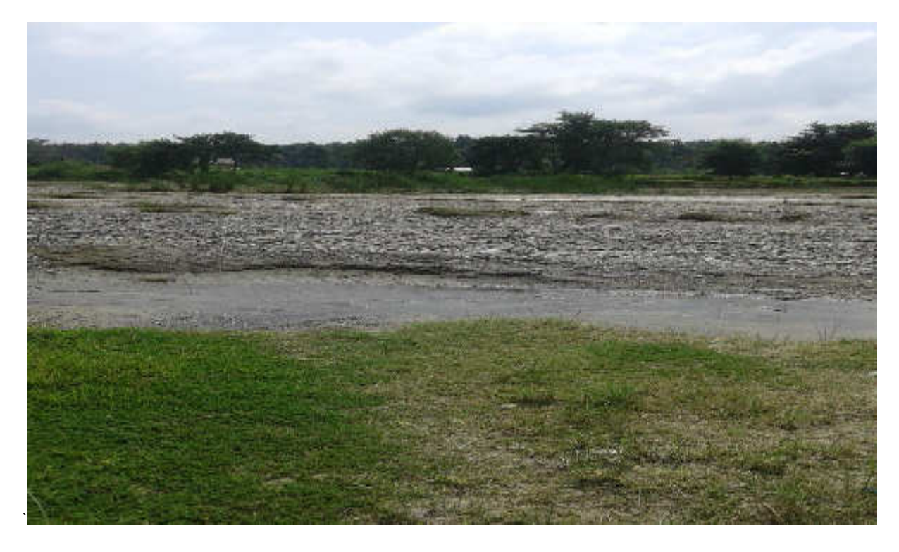
Figure 6 Luandra river crossing work