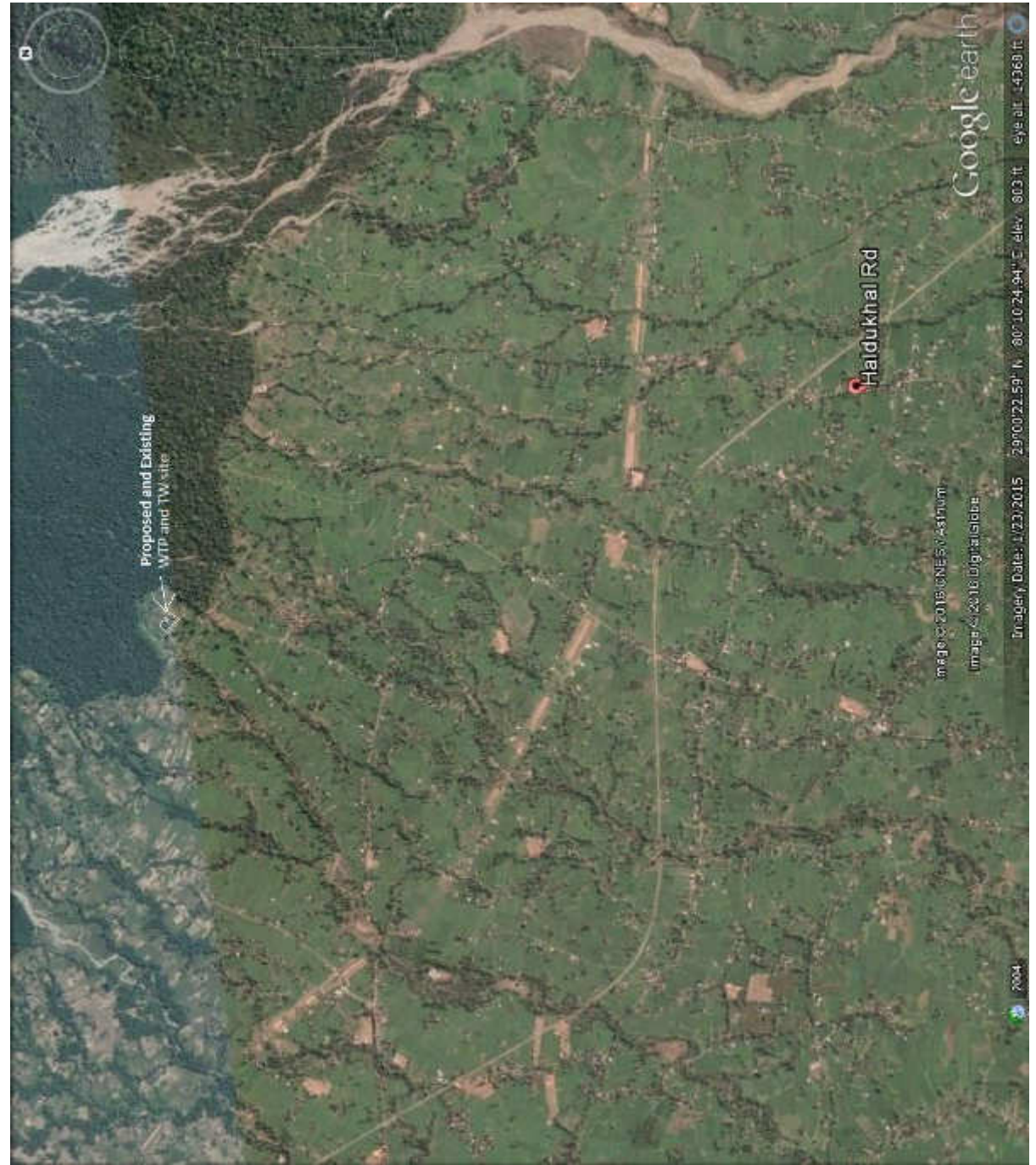
Figure 2: Google map location for proposed and Existing structure