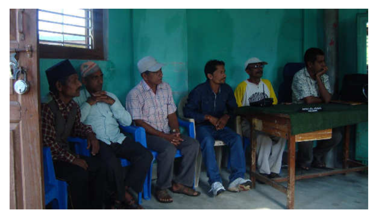
Figure 1 Consultions with WUSC