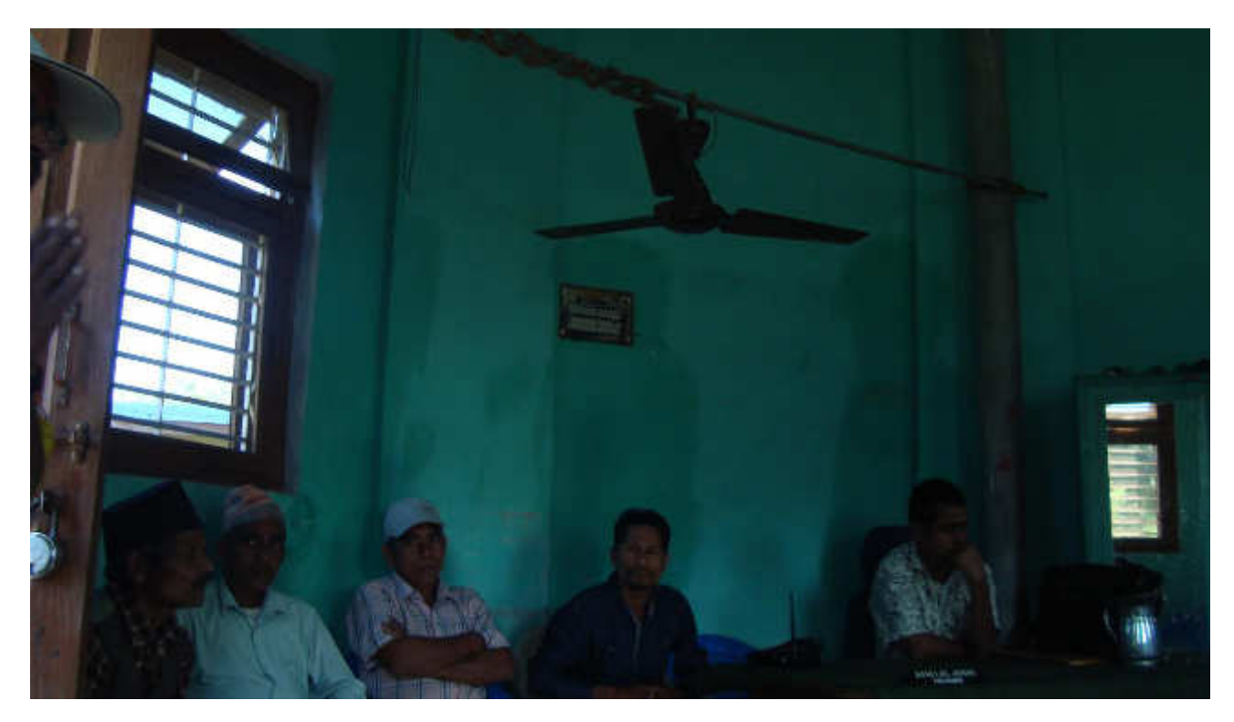
Figure 2 Consultions with WUSC