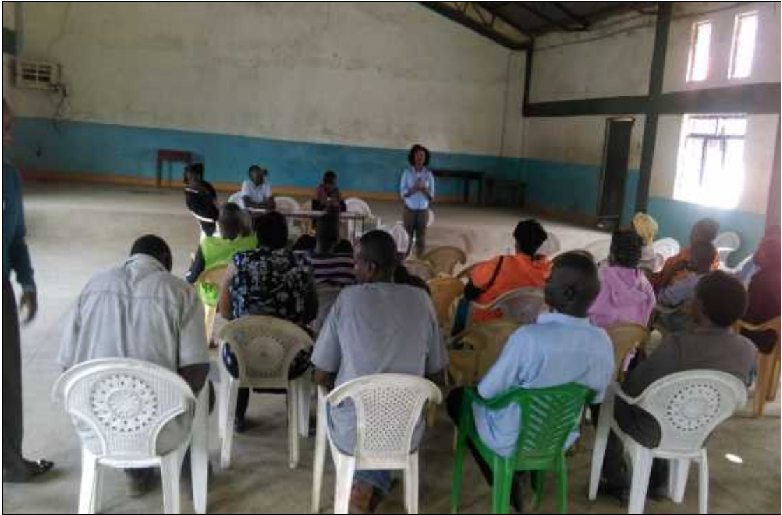
Figure 5: stakeholders' awareness meeting