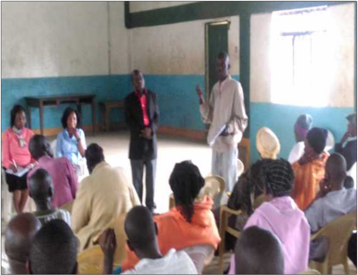
Figure 7: Stakeholders forum