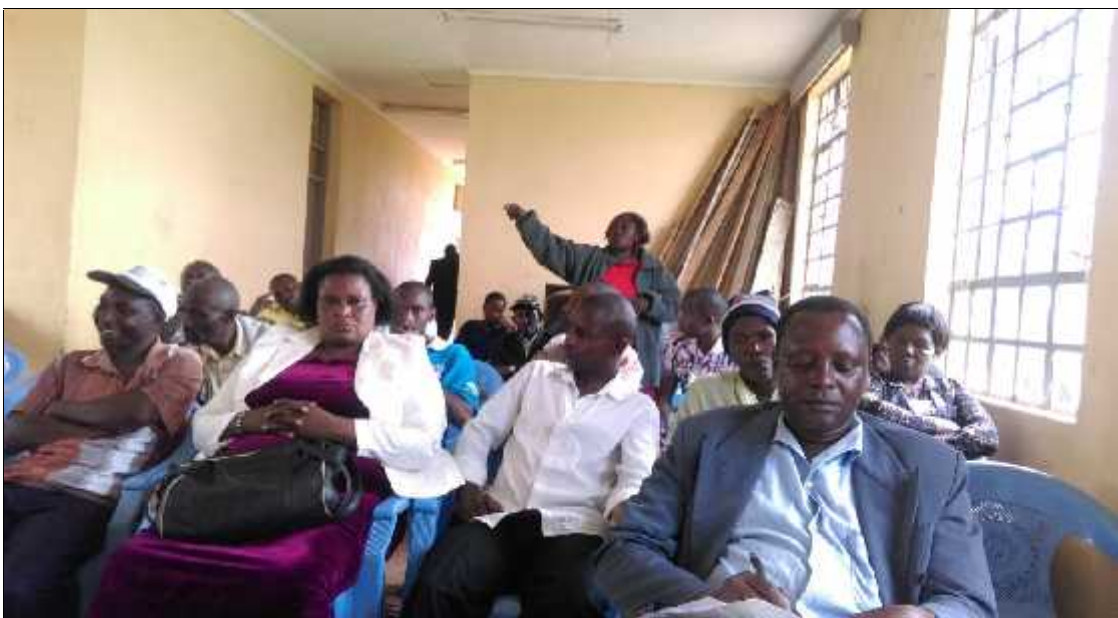
Figure 4: Stakeholders' forum