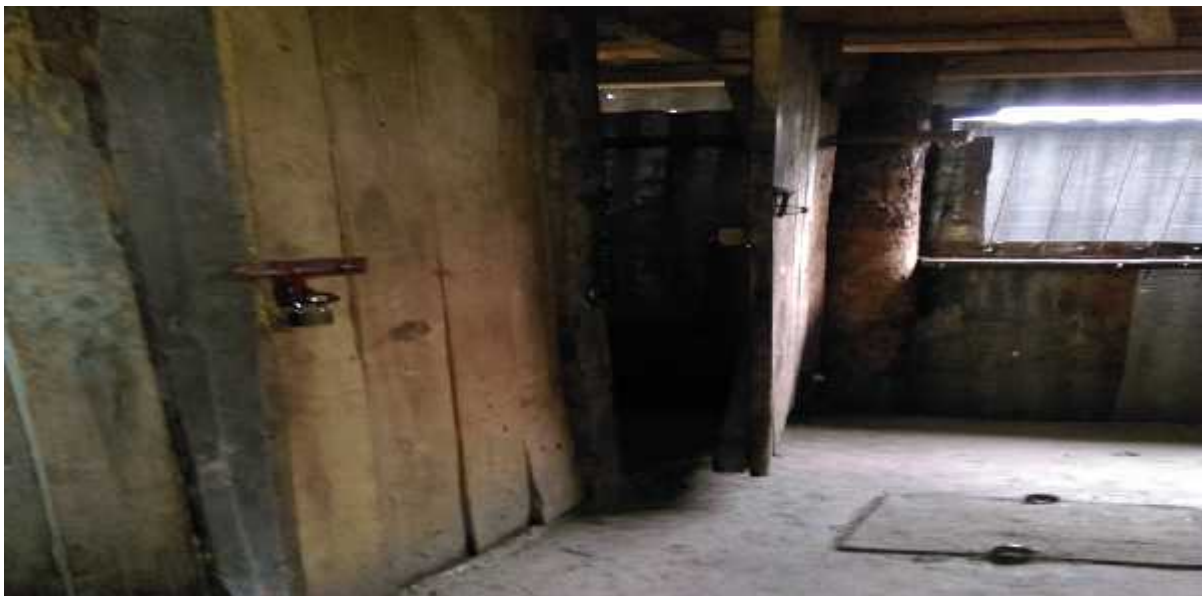
Plate 6: Toilet in the residential area

There are only 5no. toilets serving the whole area serving over 300 No people. These toilets are managed by Wamama Tunaweza group. The area has a mixture of permanent and semi-permanent houses and a mixture of sanitation facilities. There exists water and sewerage infrastructure. Some areas have no water connections and as a result they buy water from vendors. In some areas there is a bathroom and water point and lacks children friendly toilets. The waste from these sanitation facilities are discharged direct to the river.