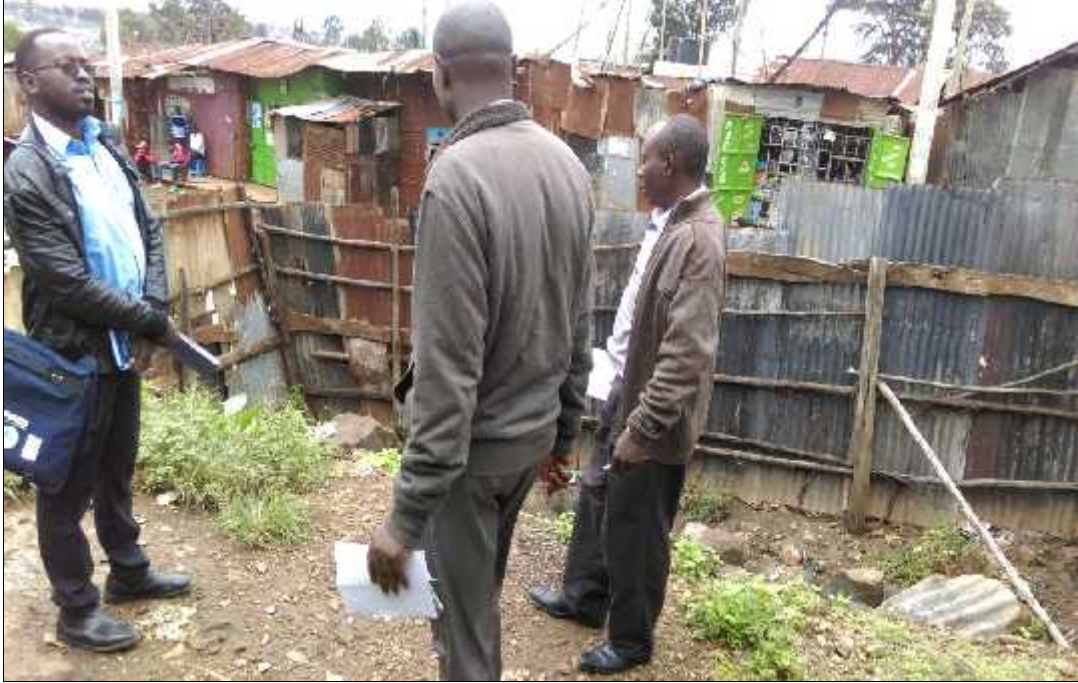
Figure 10: Audit team on a field visit