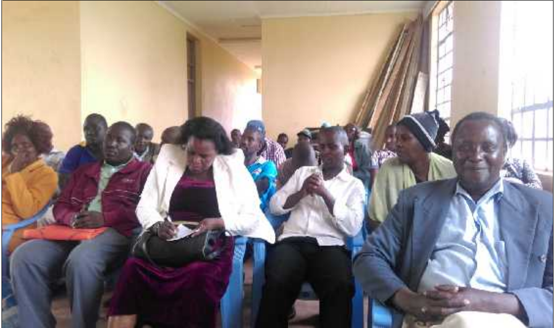
Figure 1: A stakeholders meeting