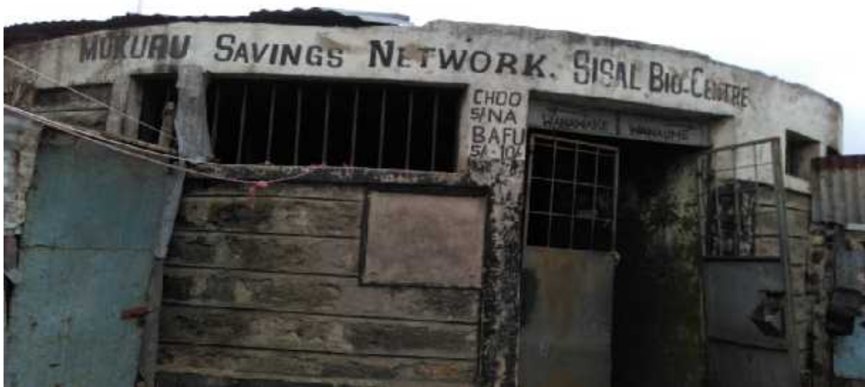
Plate 11: A Bio-centre at Sisal village Mukuru

wape and Sisal, at an altitude between 1618 and 1623 m. There is a general smooth slope towards the stream water line that passes through Mukuru Kwa Njenga, a reason why most of the areas around it remain flooded during the rainy season. Ngong River flows bordering the north of the settlement in Sisal, and it is one of the critically polluted points in the area.