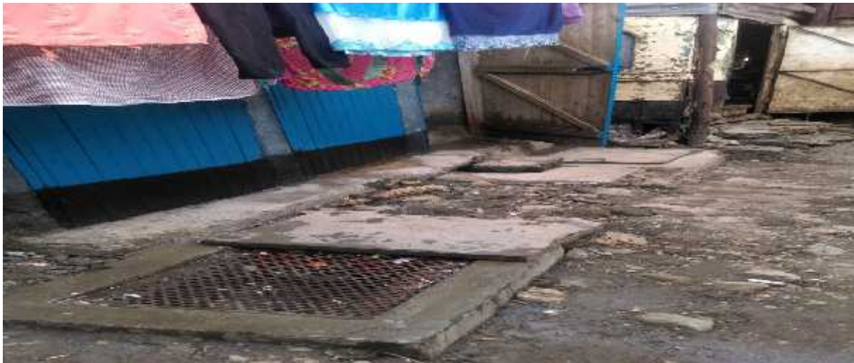
Plate 5: Toilet connected to a septic

Matopeni/Spring Valley is in Njiru location bordering Kayole and Stone Quarry. Matopeni and Spring Valley Settlement are both planned. Nairobi City County has provided titles to individual plot owners and there are no obstacles to the proposed project. There are also some areas lacking basic sanitation services. Many households have no proper garbage disposal means and sanitation facilities. The ground in Spring Valley slopes towards Kangundo road. A brook to the north of the village carries all sullage and the sewage from the residential plots. Like in other areas waste water runs through open drains creating a health hazard in the area. The Matopeni ground slopes towards the river that passes through the Nairobi Industrial area. There are no obstacles to the proposed project as there is an existing sewer passing through the area. At the center of the village the area is flat. A waste stabilization pond treatment works used to occupy part of this area before it was moved to Ruai. Inadequate sanitation leads to a number of financial and economic costs including direct medical costs. Residents within Matopeni/Spring Valley/Manna have access to a variety of excreta disposal facilities; the most dominant ones being WC connected to septic tank and pit latrines.