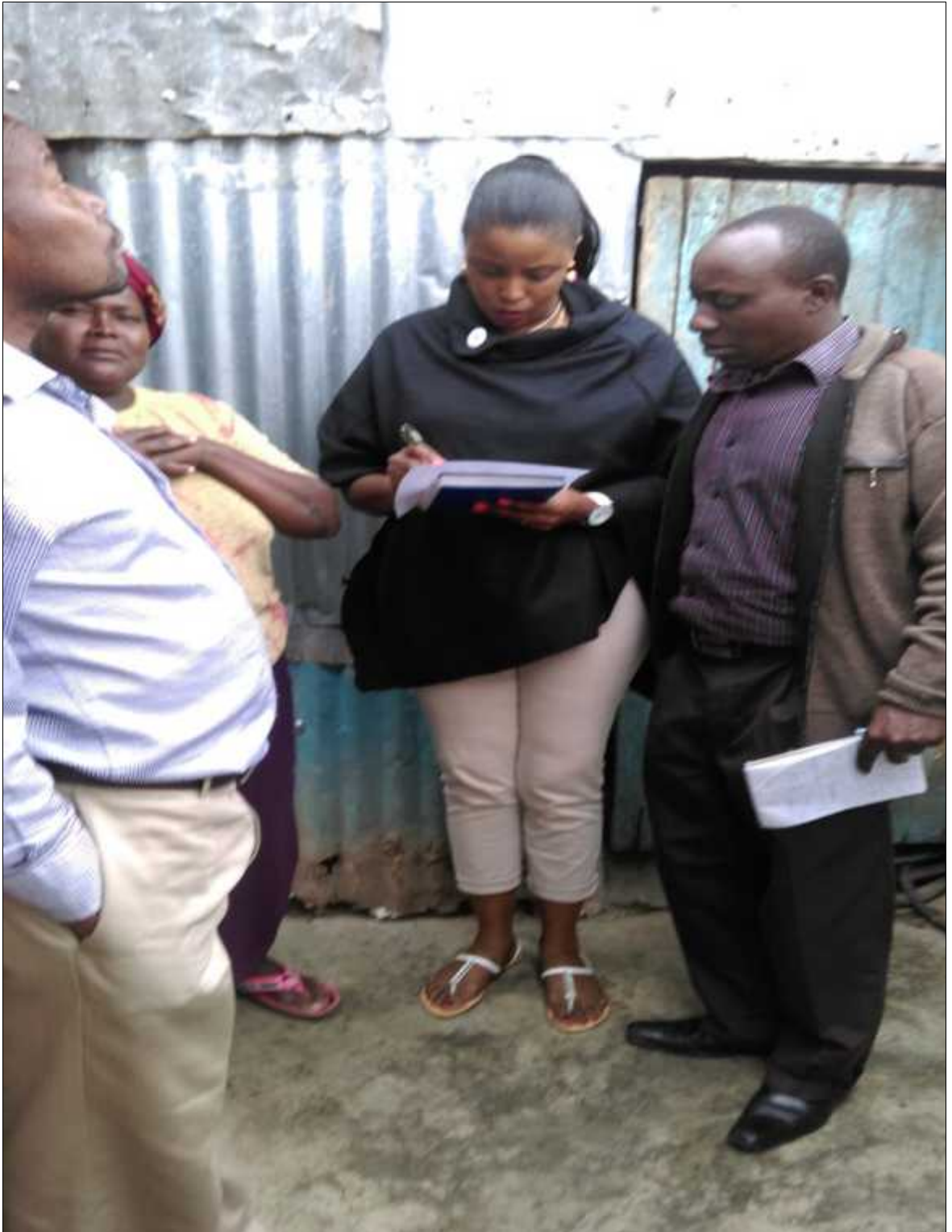
Figure 9: Audit team interviewing participants