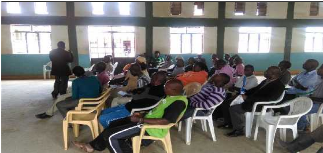
Figure 6: Stakeholders forum