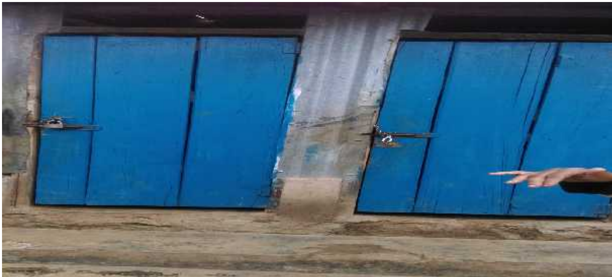
Plate 7: Plot based toilets

areahas no water connections and as a result they buy water from vendors. There is need to provide proper sanitary facilities in the villages by upgrading the existing ones and connecting them to the sewer lines