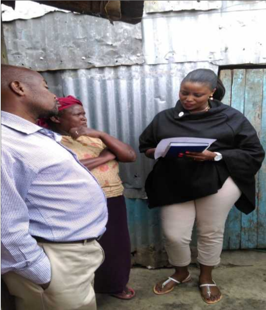
Figure 8: Audit team interviewing participants