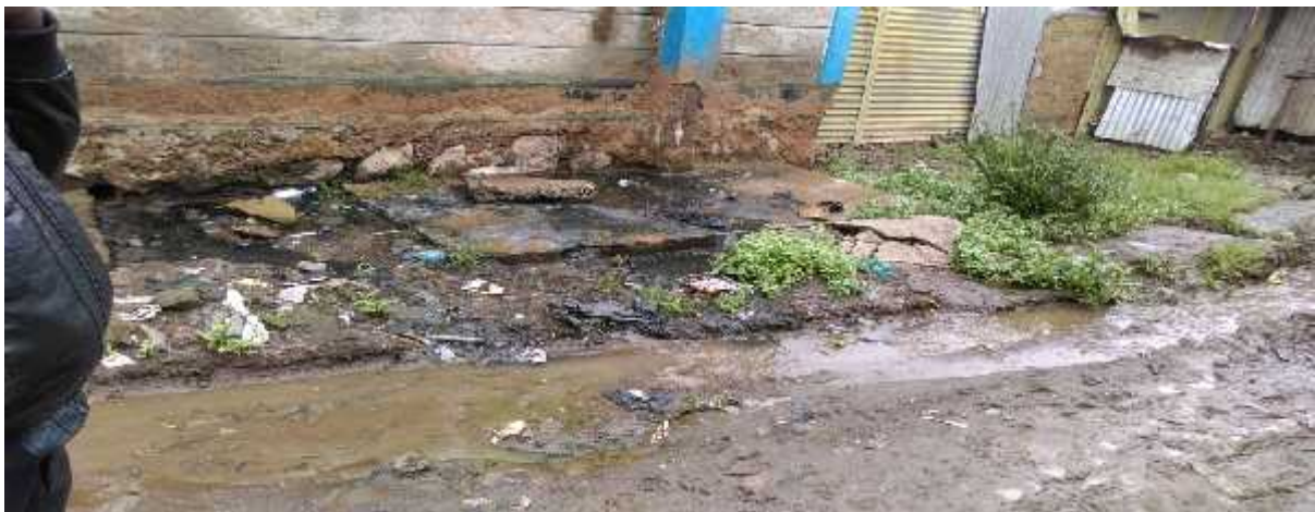
Plate 9: Overflow from a septic tank

Mowlem is located in the large Eastlands community, bordering Dandora, Komarock, Kariobangi south and Umoja. Mowlem is 13 Kilometers away from the city center, which makes it convenient for those working in town and those intending to move to and from the city. The cost of living in this location is low and so is the housing cost. There is mixture of sanitation facilities; pour flush which are connected to septic tanks and pit latrines. During the time of visit most of the facilities were full. Most of the private pit latrines are located within the residential areas. The septic tanks cannot support the high populations hence cases of overflows.