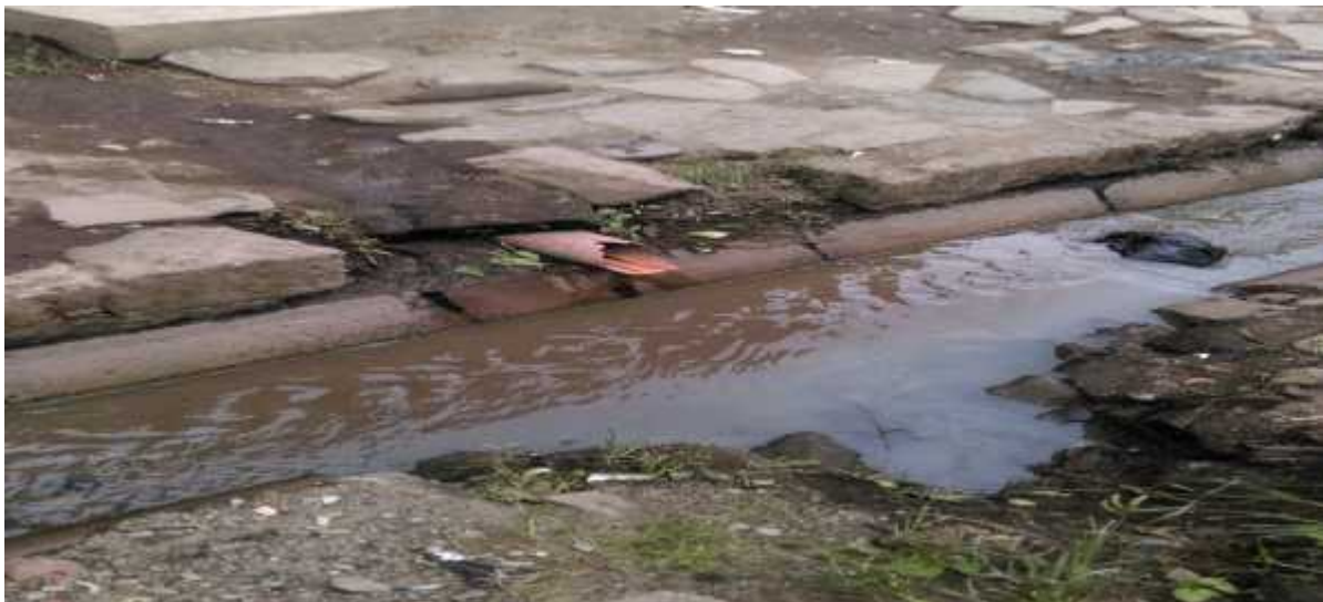
Plate 8: direct discharge of waste to storm drain at Mahiira

Huruma consists of six villages: Mahiira, Kambi Moto, Ghetto, Gitathuru, Redeemed and Madoya. The Huruma informal settlements are on public land under the trusteeship of Nairobi City County. The structures in Huruma are mainly semi-permanent. Most of the areas are served by served by NWSC in terms of water provision.