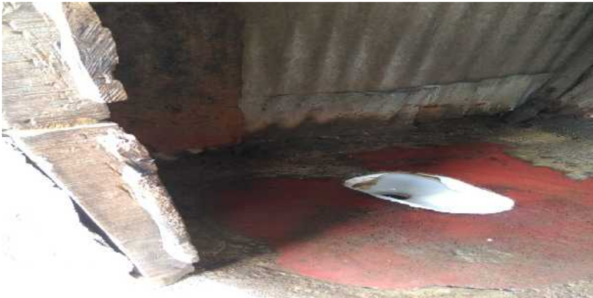
Plate 10: Pour flush toilet at Muslim village, Kawangware

The Muslim village has been identified for rehabilitation of the existing sanitation facilities. The slum is characterized by scarcity of adequate clean drinking water and poor drainage system.