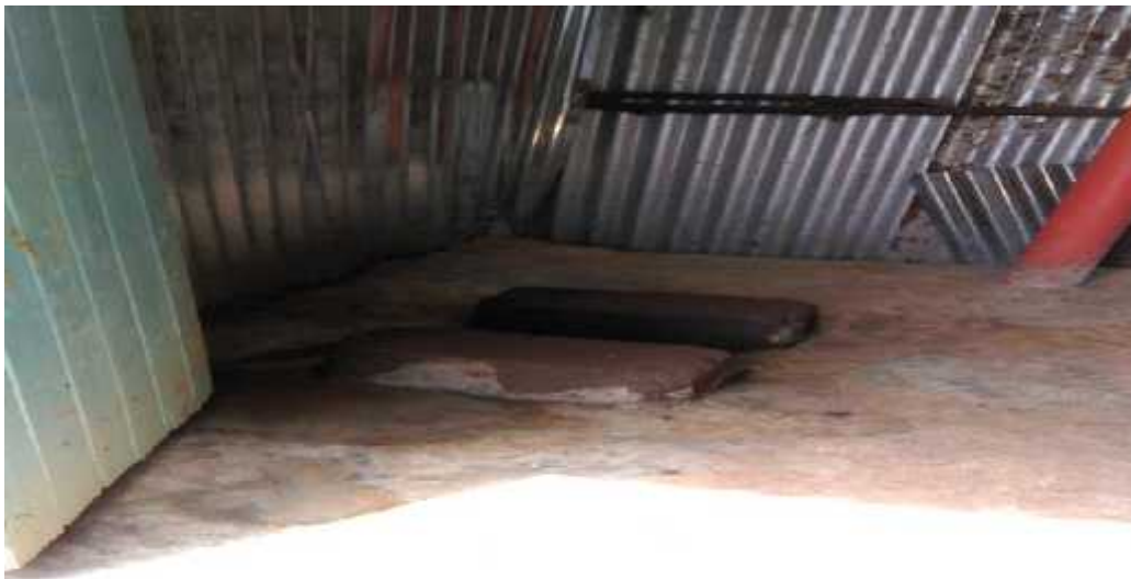
Plate 3: Pit latrine

Kibera is located southwest of Nairobi City Centre. It is approximately 5km southwest of the city centre. Much of its southern border is bounded by the Nairobi River and the Nairobi Dam. Kibera as a whole is an informal settlement comprising of ten villages covering approximately 250 hectares of land. Kibera generally comprises of steep hills and river valleys which ensures that the railway line that cuts across the slum had cut through a section of the hilly terrain creating steep trenches that drain the site to the Nairobi dam situated on the periphery of the slum. Kibera neighbourhood presents a microclimate of Nairobi city which lies one third degrees south of the equator thus expected to experience an equatorial climate. But due to the Cities altitude of about 5,500 feet above sea level, the climate is similar to that of low latitude highlands. The site enjoys a fairly moderate climate that is very attractive for human habitation. The altitude makes the area chilly in the mornings especially in the months of June to October which is usually cloudy and misty with temperatures dropping to about 12 0 C. Majority of the inhabitants are workers in middle and high income homes in the nearby Lavington, Highrise estates and Langata estates. Others are casual labourers in the factories nearby industrial area. There exist NGOs and CBOs that are supporting groups in undertaking small scale businesses through revolving funds.