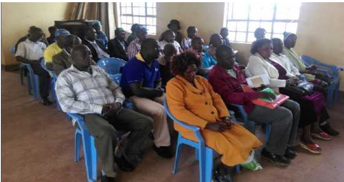
Figure 2: A stakeholders meeting