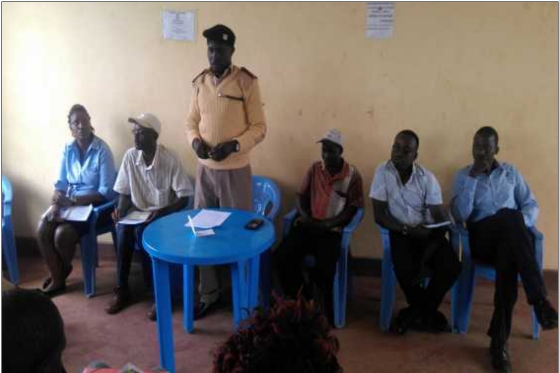
Figure 3: meeting with the administrators and stakeholders