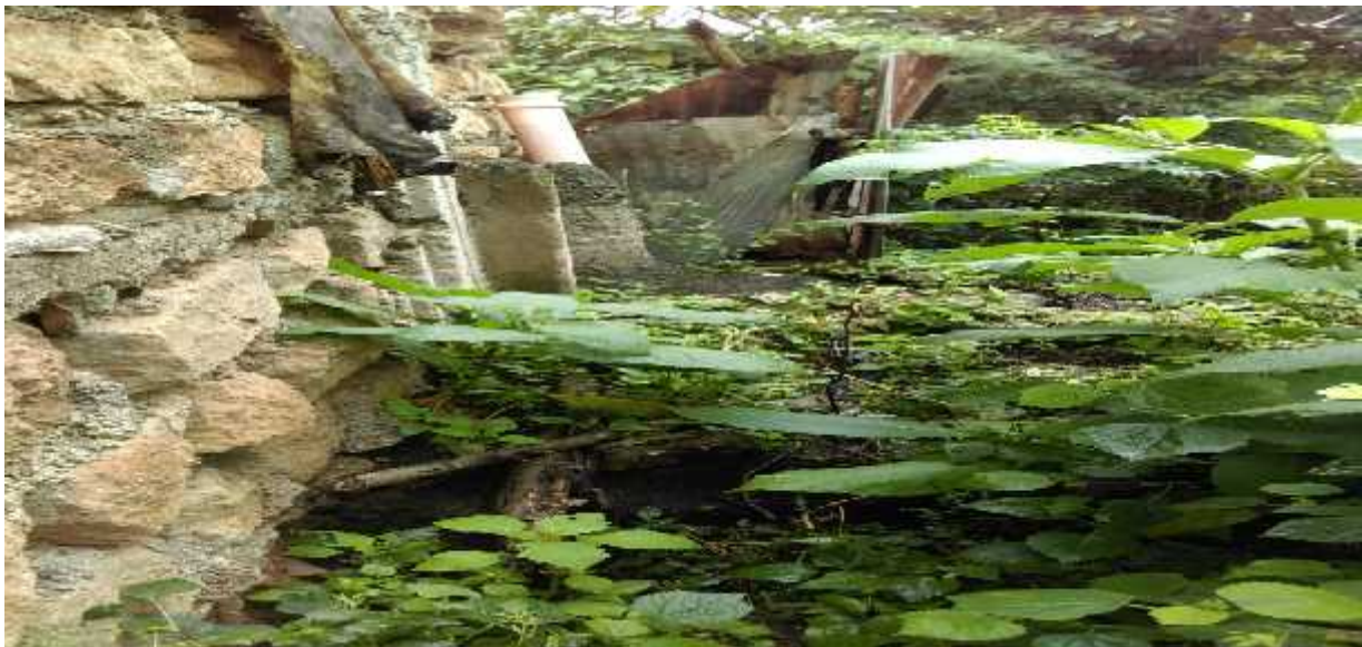
Plate 4: waste discharged to the river

Mailisaba is situated in Eastern Part of Nairobi in Embakasi constituency, Saika Sub-Location, Njiru Location. It is subdivided into 9 villages (zones) including Bondeni, K.P.C.U, Silanga Railway, Bosnia, Silanga Riverside, Mailisaba Central, Biafra, Silanga Central and Ogopa. Water and basic sanitation services is lacking in some areas. The trunk sewer passes through Ogopa and Silanga. The residents have been issued with plot cards as survey on plot sub-division has been carried out pending issuance of title deeds. Most of the residents eke a living by working at the quarries (mostly youth and women) or at the Dandora and Kayole dumpsites where they collect waste materials for resale for recycling. The area is easily accessible both by paths and roads and borders Dandora Phase V on one side and Saika Estate on the other side. A large number of the residents own the plots/houses and housing is largely semi-permanent. The area lacks proper public sanitary facilities, with most of the residents sharing pit latrines which are dotted across homesteads.