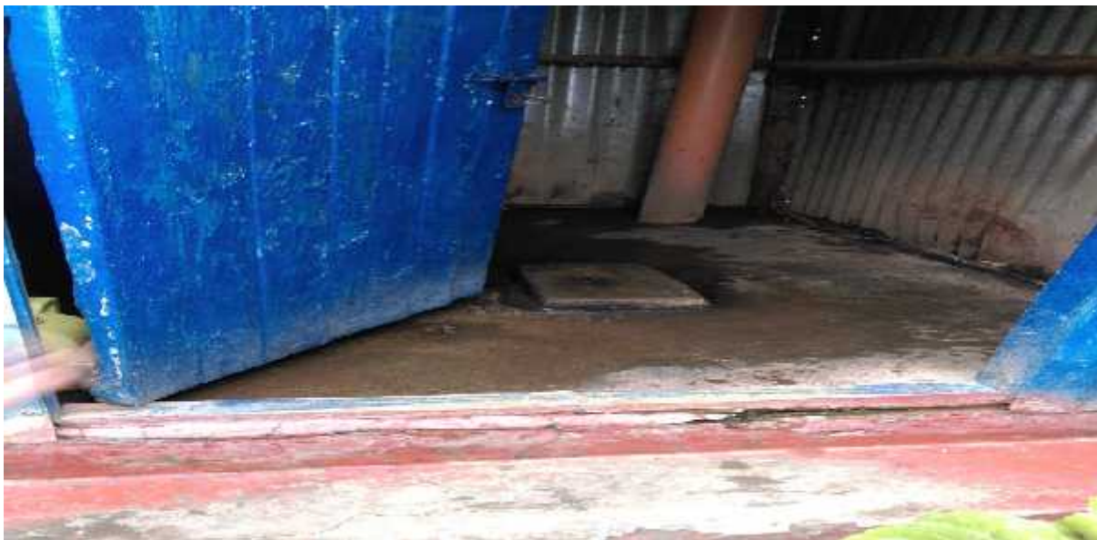
Plate 2: Pit latrine at River bank

River bank informal settlement is Located in Embakasi location, Tassia sub-location. It is estimated that the size of the settlement is 30 acres. Residents settled in the settlement in 2002. Most of the land is under the ownership of the Nairobi City County while a small portion is on electricity way leave. Some people have managed to connect themselves to the Nairobi City Water and Sewerage Company network. There is a mixture of sanitation facilities in the settlement. There are two sewer lines passing through the area; one from Donholm through Embakasi and another from Industrial area through Embakasi and Umoja estates. Residents were found using various excreta disposal facilities among them pit latrines, pour flush toilets, and WC connected to septic tank.