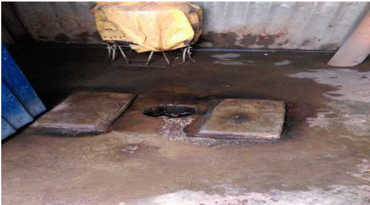
Plate 1: A pit latrine at Kayole Soweto

Kayole Soweto village is situated in Embakasi Division in Nairobi's Eastlands area, 8 km from the city centre. It occupies an area of 1.9 sq. kms. The land in which the settlement is built belongs to the Nairobi City County. However, most of the residents have been given allotment cards. Administratively the settlement is divided into nine zones which are locally known as Muthaiga Central, Shauri Yako, Bahati, Muoroto, Kibagare, Gitau, Muungano and Mzesa. Some residents work casual and odd jobs in industrial area and in the neighbouring Komarock, Umoja, and Jacaranda estates. Most of the people who are self-employed operate small scale businesses. The status of the land it occupies is quasi-legal with isolated portion being allocated to individuals who have constructed permanent structures. Quarrying is also a major activity near Soweto.