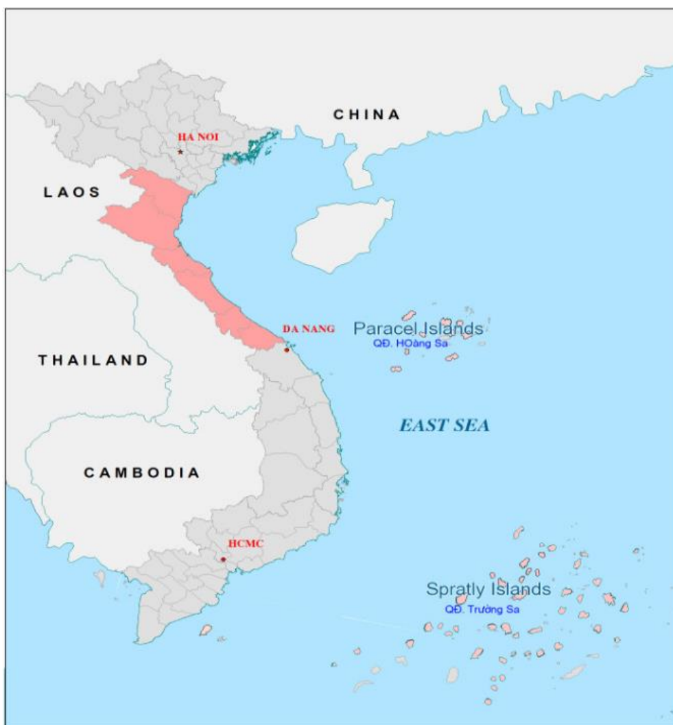
Figure 1.1 The ER-P Accounting Area

The proposed ER Program Accounting Area (Figure 1.1) encompasses the entirety of the North-Central Agro-Ecological Region, an area of land totalling 5.1 million ha (16% of the total land area of Viet Nam), of which 80% is hills and mountains and the remaining is coastal plains with agricultural land, accounting for 14% of the natural area. The region has a tropical monsoonal climate. Average rainfall is about 2,500 mm with two seasons a year: the rainy season from June to December with tropical depressions and typhoons, and 85% of the rainfalls concentrating during September to November and the dry season from January to May.