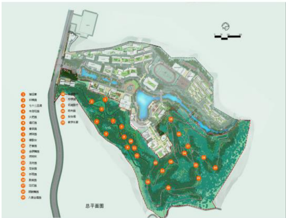
Outdoor Teaching Points