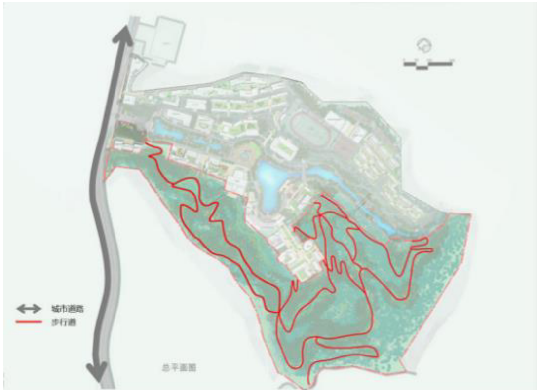
Location of Baise China- Viet Nam Economic and Cultural Exchange Training Center